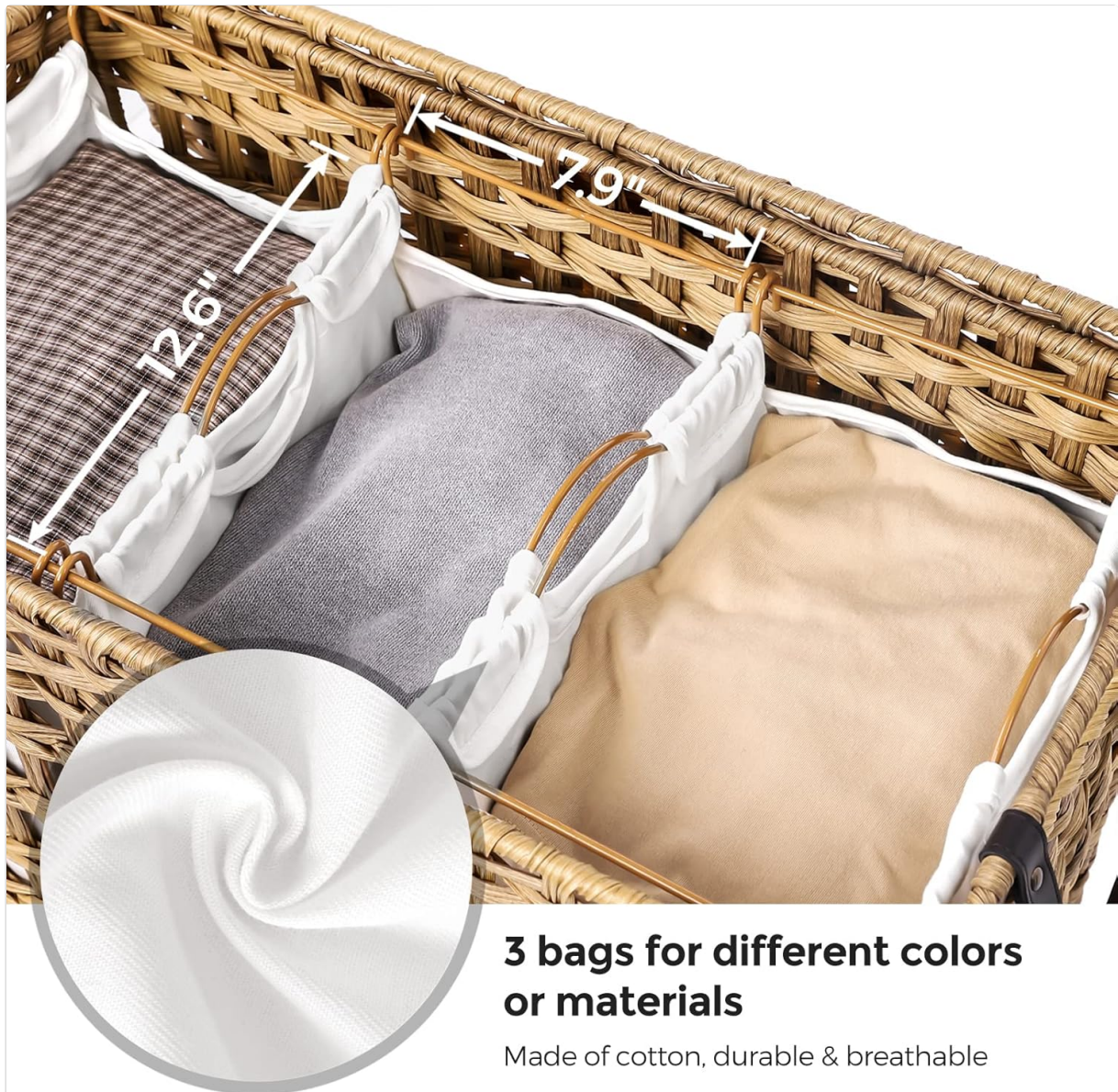
Figure 3: Internal view showing three compartments with removable liner bags.