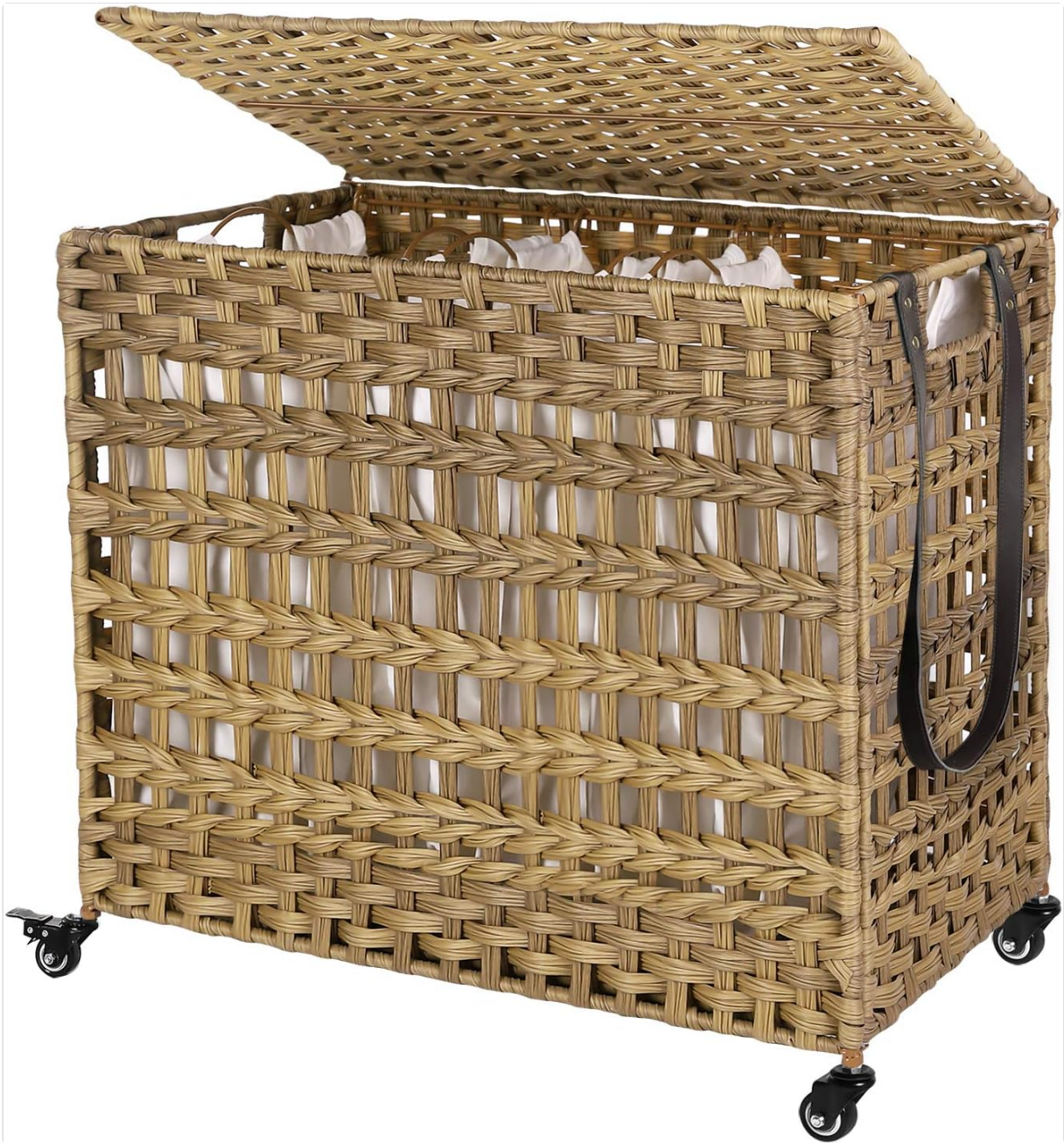
Figure 1: Fully assembled SONGMICS 140L Synthetic Rattan Laundry Hamper.