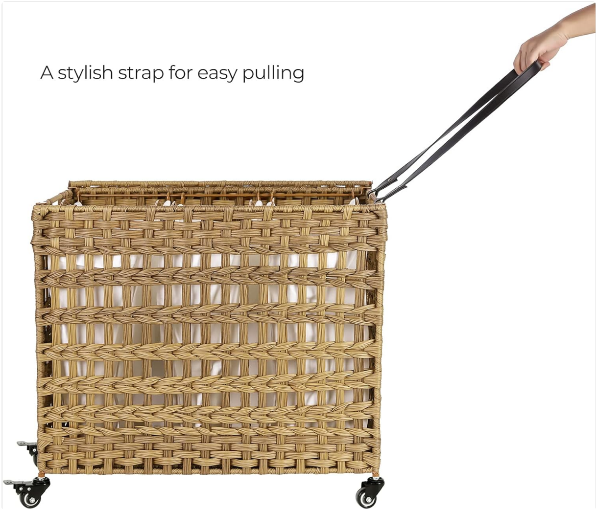
Figure 4: Demonstrating the use of the pull strap for easy transport.

Your browser does not support the video tag.