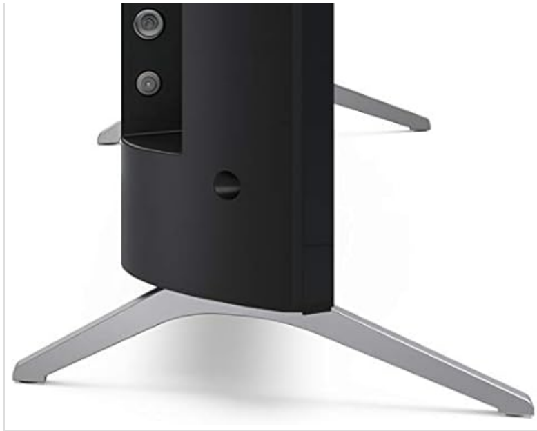
Image: Side view of the Sharp 32Bi3EA TV, illustrating the slim profile and the attached pedestal stand.