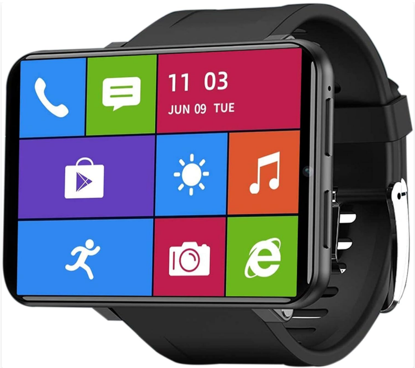
Image 1.1: The KOSPET TICWRIS MAX Smart Watch showing its vibrant main interface with quick access icons for phone, messages, time, weather, music, shopping, fitness tracking, camera, and browser.