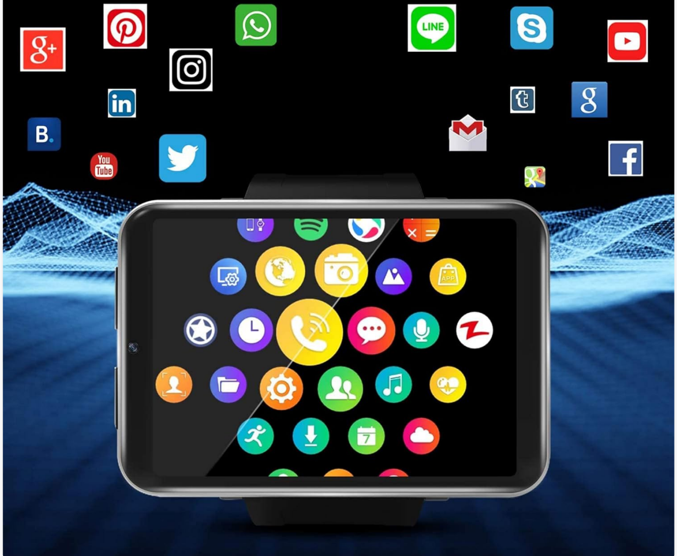
Image 3.3: The KOSPET TICWRIS MAX Smart Watch showcasing its Android 7.1.1 operating system with a variety of popular application icons, indicating its smart functionality.

Running on Android 7.1.1 operating system, it supports all Google applications. Built-in Google play store, Google map, Google voice and other Google applications, users can also install any third-party application in Google play store.