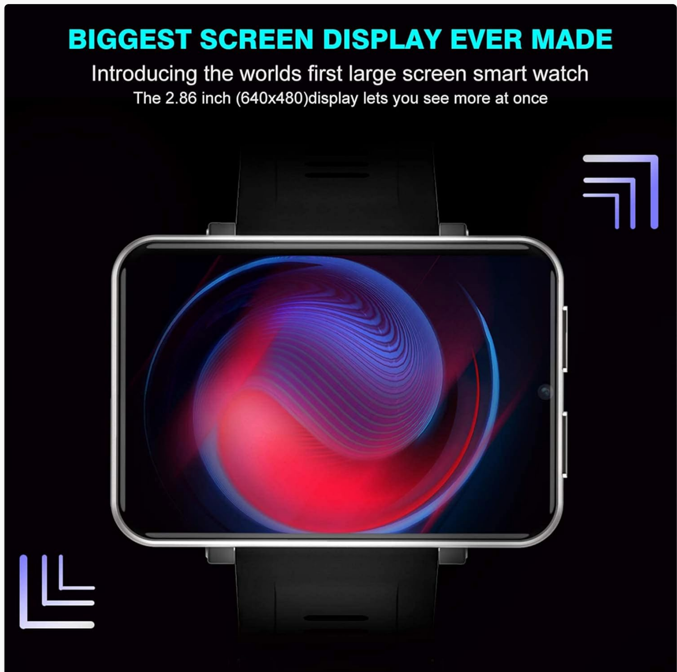
Image 3.1: The KOSPET TICWRIS MAX Smart Watch highlighting its expansive 2.86-inch display, designed for enhanced viewing and interaction.

The TICWRIS MAX features a 2.86-inch square LCD screen with a 480x640 resolution, providing a clear and immersive visual experience for videos, games, and photos.