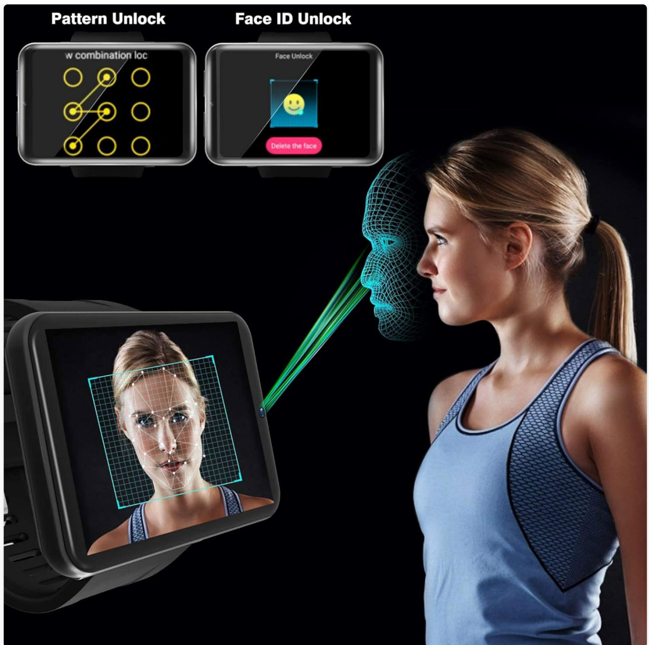
Image 3.2: This image displays the security options for the KOSPET TICWRIS MAX, showing both pattern unlock and the Face ID unlock feature in action.