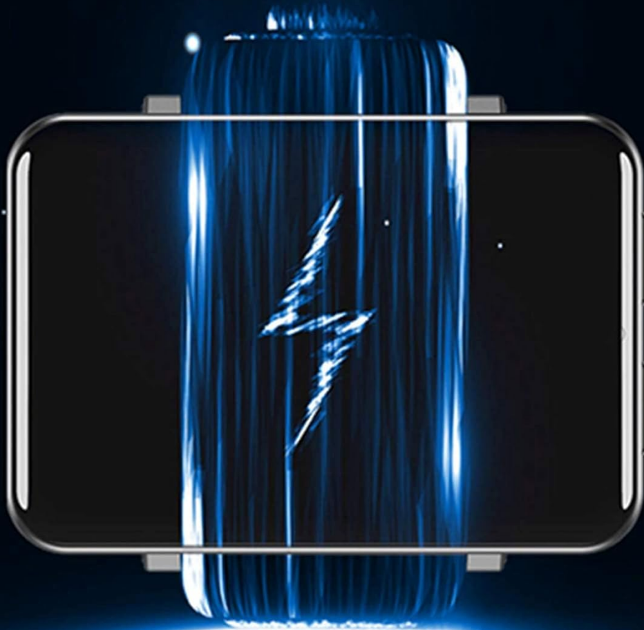
Image 4.1: This image details the battery performance of the KOSPET TICWRIS MAX, highlighting its 2880mAh capacity and estimated usage times for standby, video watching, daily use, continuous calls, and GPS exercise, along with charging time.