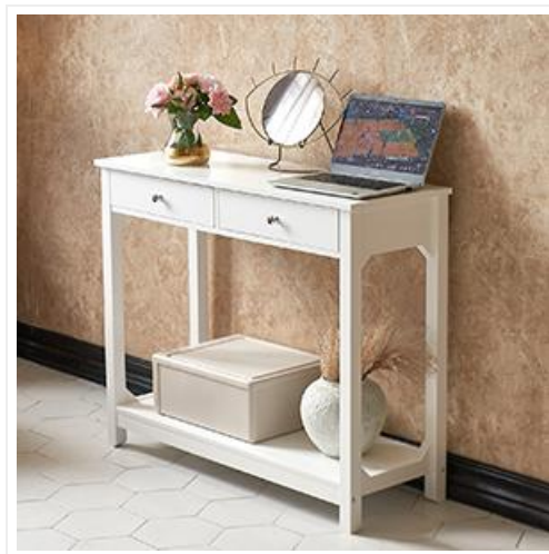
Image: Close-up view of the console table's two drawers, demonstrating their smooth operation.