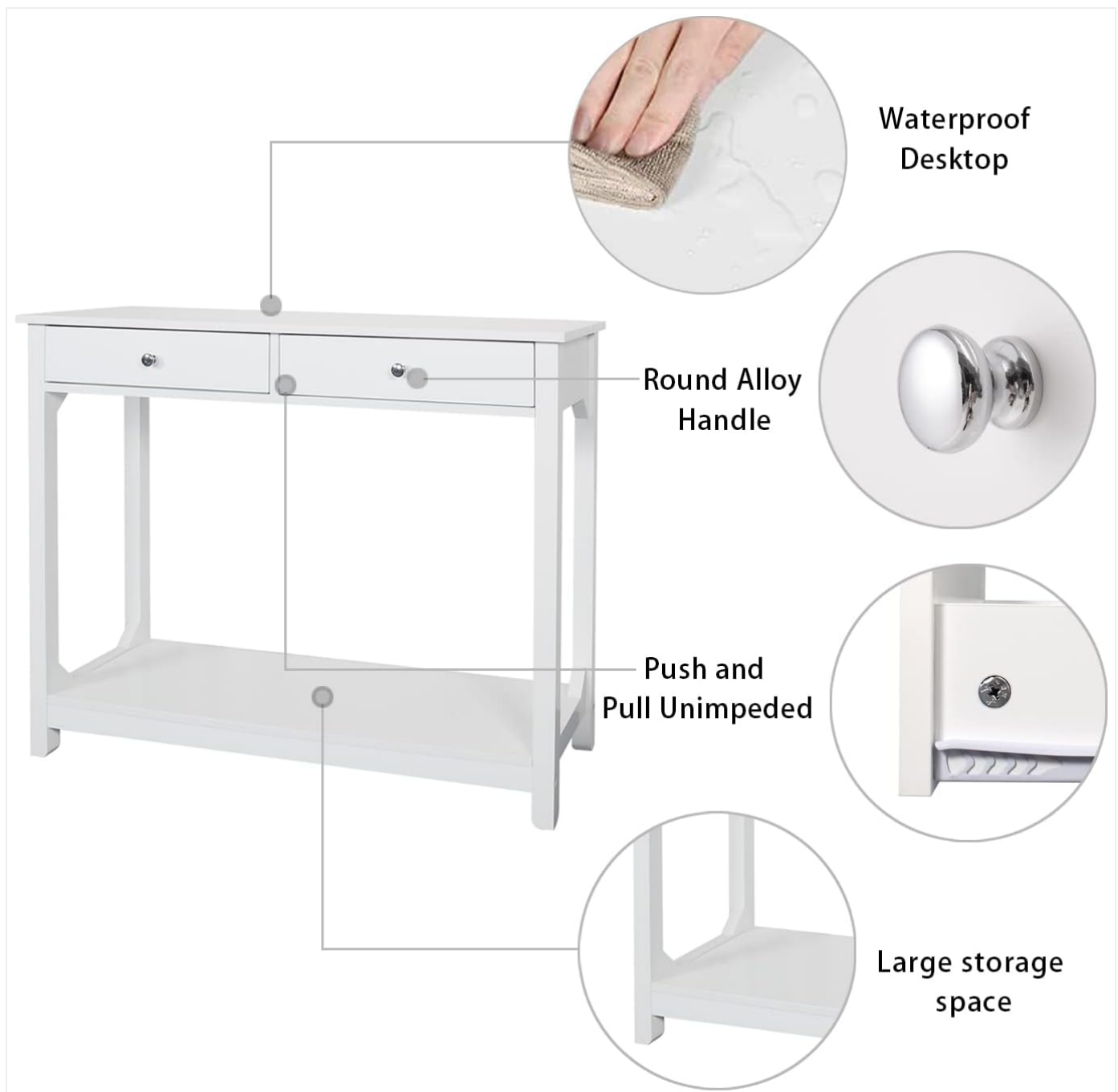
Image: Diagram highlighting key features: waterproof desktop, round alloy handles, and ample storage space provided by drawers and the lower shelf.

Your browser does not support the video tag.