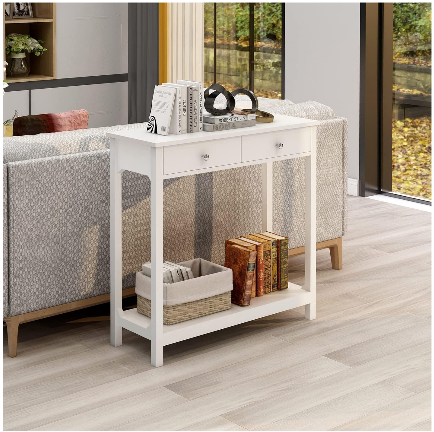
Image: The TaoHFE Console Table positioned in a living room, showcasing its compact design and utility.