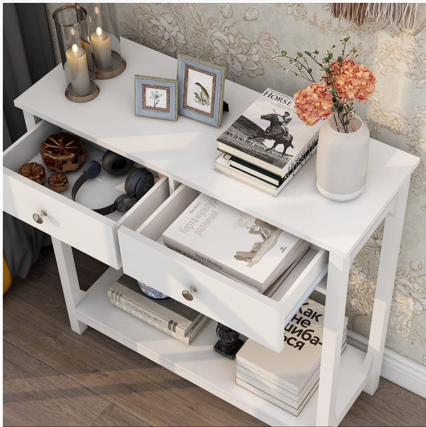
Image: The TaoHFE Console Table in White, featuring two drawers and a lower shelf.