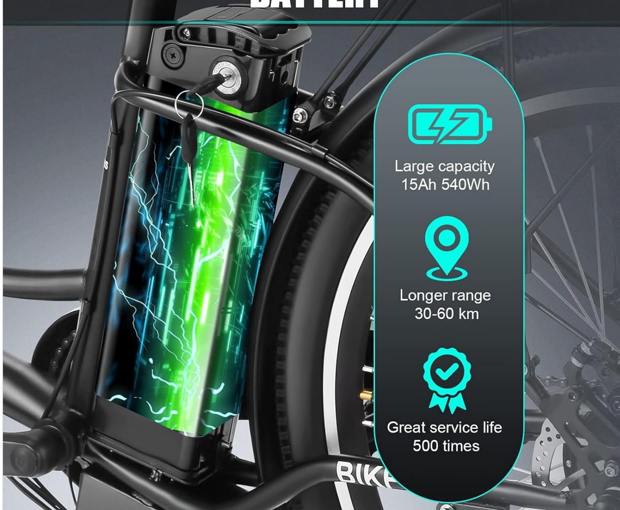
Figure 6.2: The removable lithium battery, highlighting its capacity and service life.