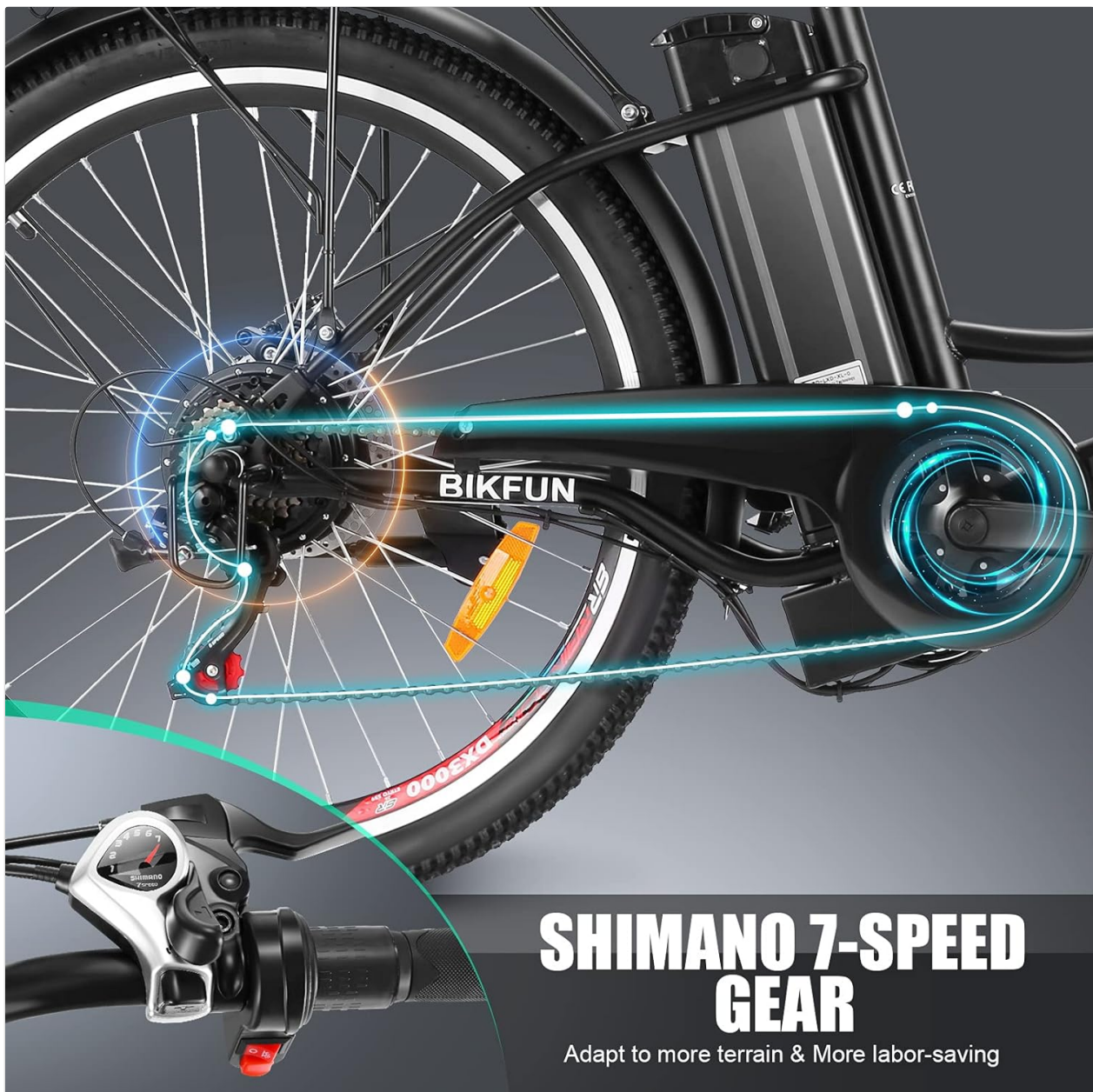
Figure 5.1: Detail of the Shimano 7-speed gear system, designed for adapting to various terrains.