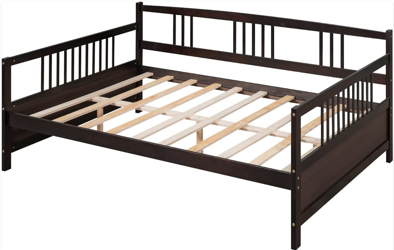
Figure 4.1: Daybed frame with slats, angled view.