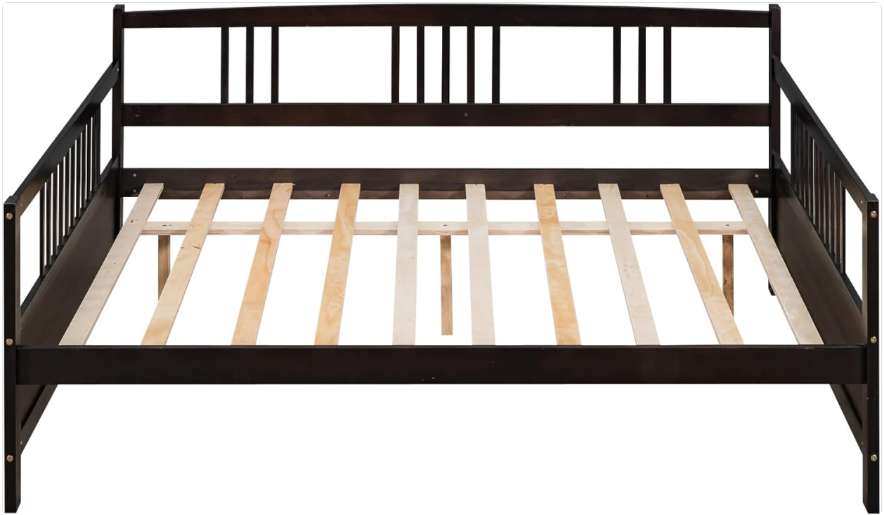
Figure 4.2: Daybed frame with slats, front view.