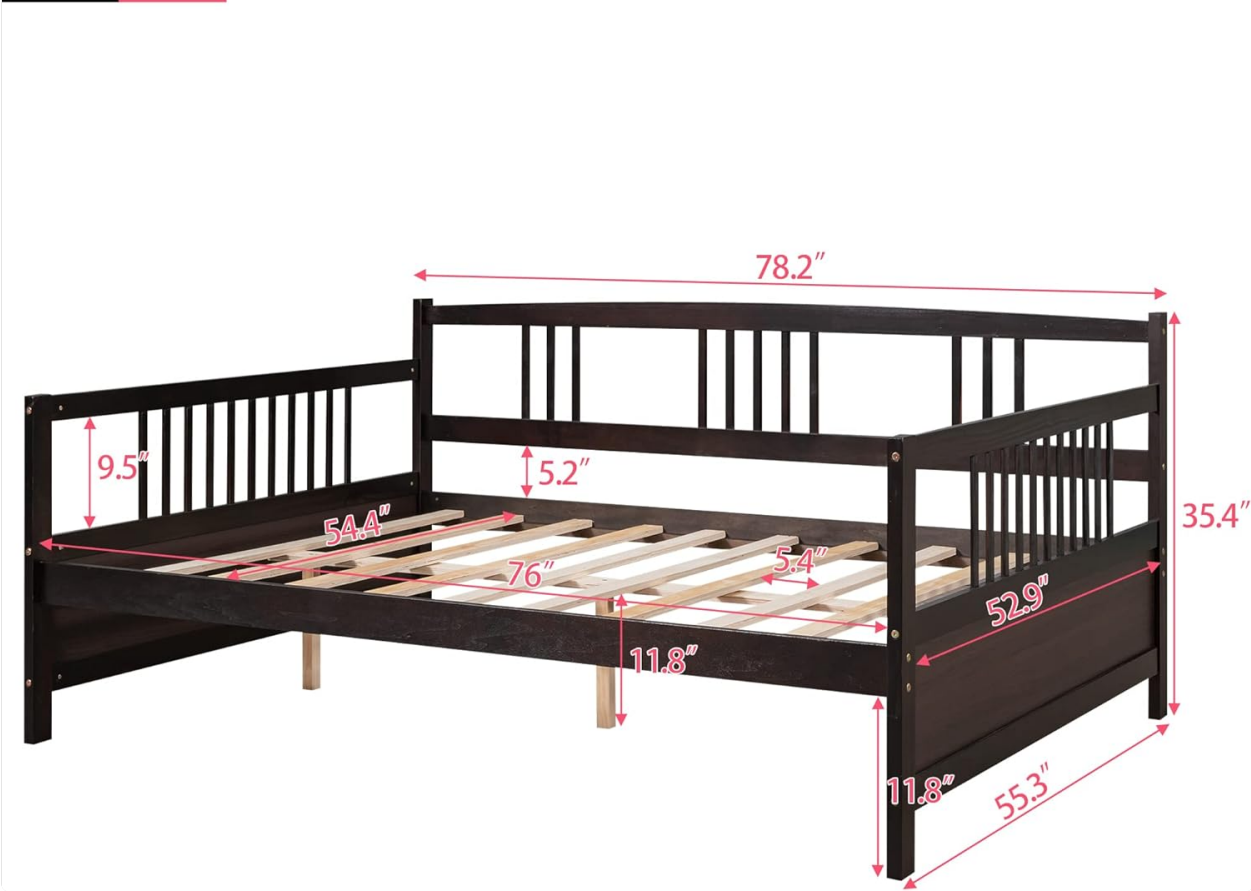
Figure 8.1: Daybed Dimensions.