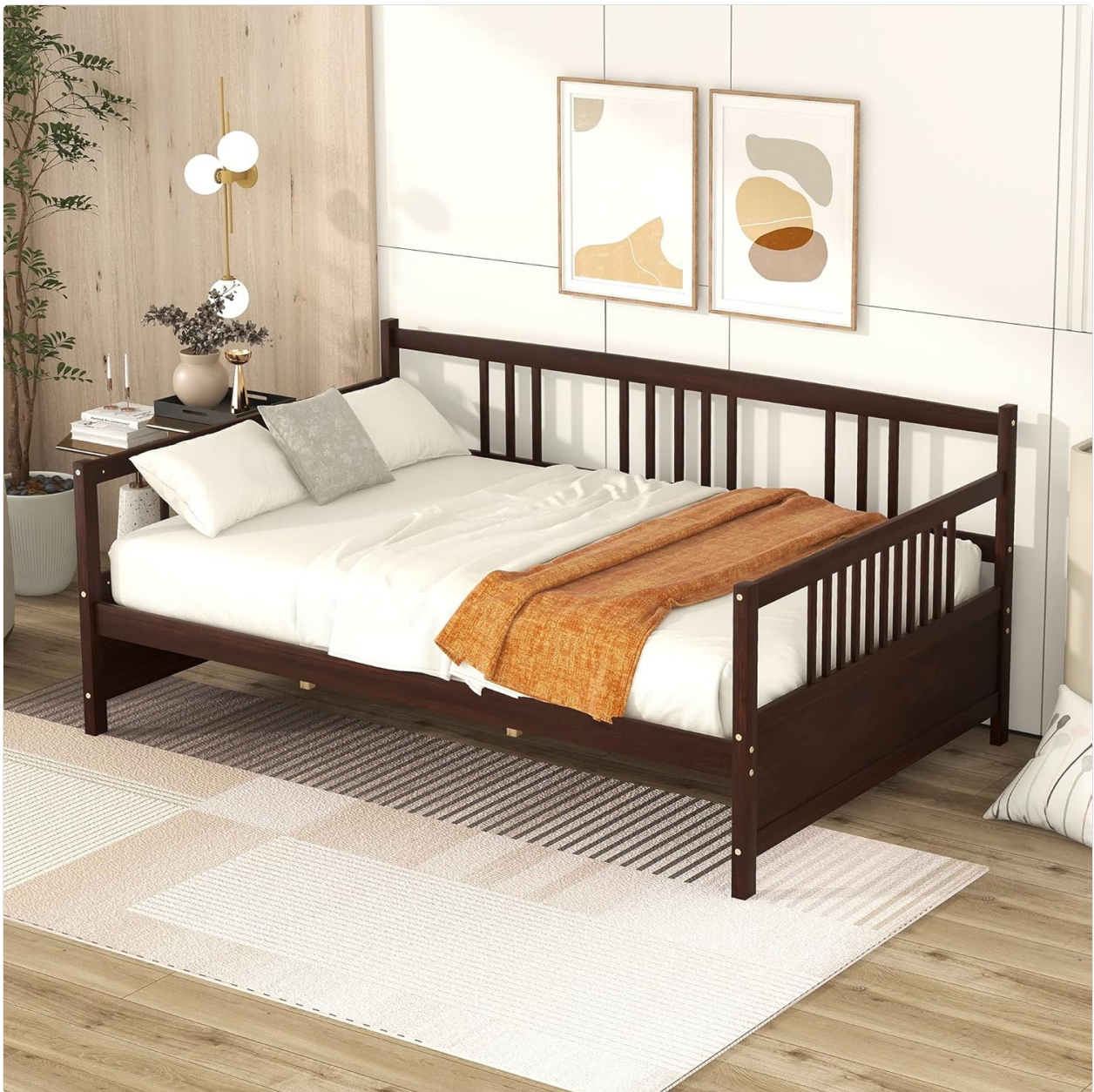
Figure 1.1: Assembled Merax Full Size Daybed, Espresso.