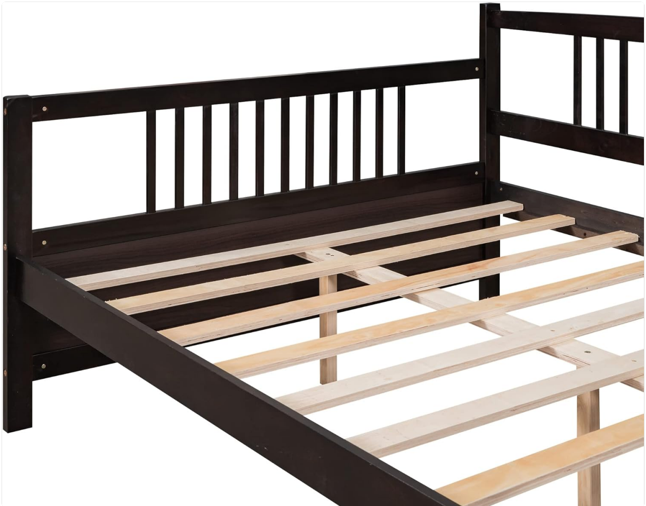
Figure 4.3: Close-up of slats and frame.

Once all components are assembled, ensure all bolts and screws are fully tightened for stability.