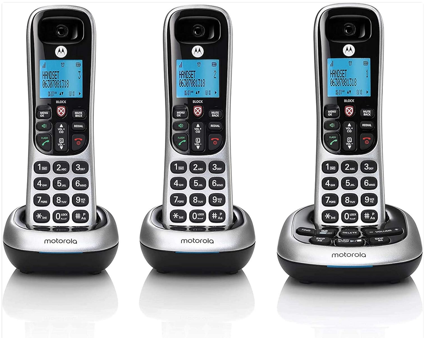
Image: The Motorola CD4013 DECT 6.0 Cordless Phone System with three handsets and their respective charging bases.