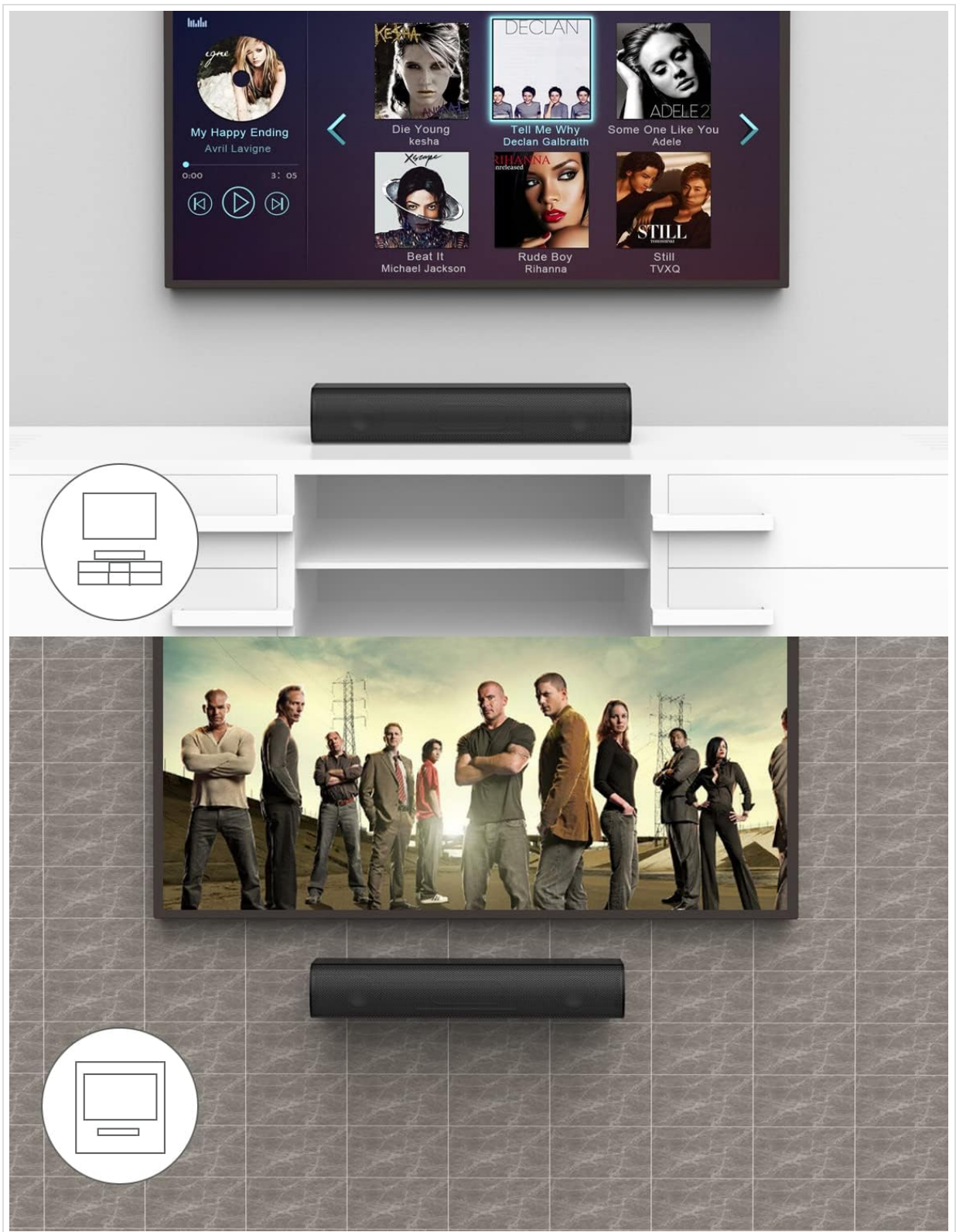
Image: Diagram illustrating soundbar placement options: flat on a surface or wall-mounted below a TV.