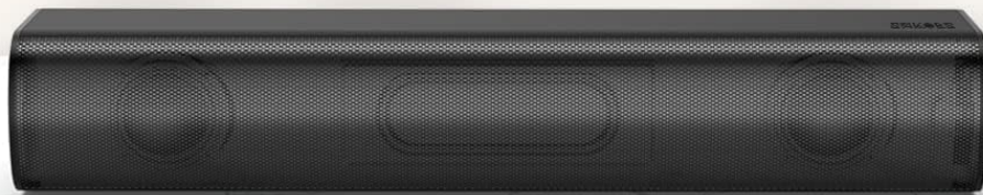
Image: Rear view of the SAKOBS SB925D-01 Soundbar, highlighting the AUX and Optical input ports.