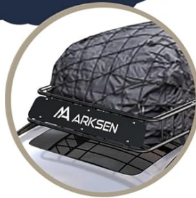
Tie down gear