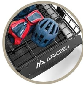
Keep dirty gear outside