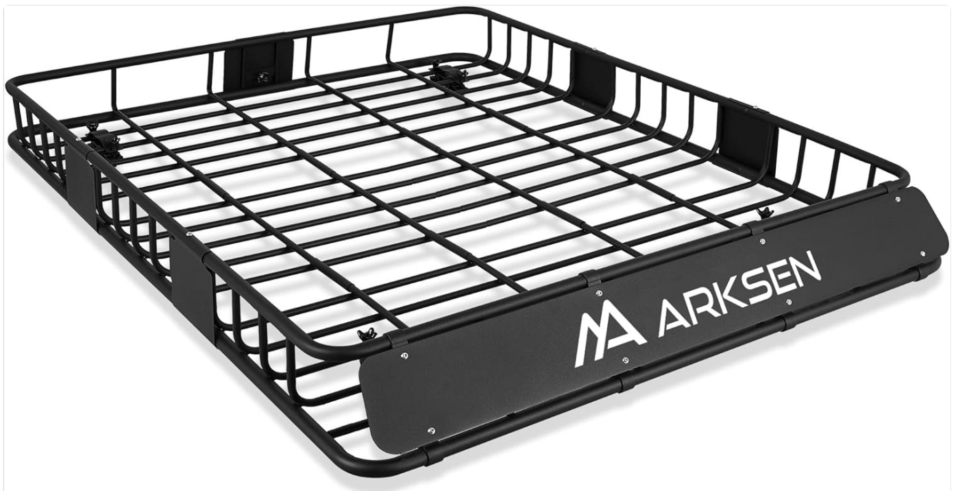
Figure 1.1: ARKSEN Universal Roof Rack Cargo Basket, showcasing its robust design and spacious structure.

The ARKSEN Universal Heavy Duty Roof Rack Cargo Basket is designed to provide additional storage capacity for your vehicle. Constructed from heavy-duty steel with a black powder coating, it offers durability and resistance to weather elements. This versatile cargo basket is suitable for carrying a wide range of items, including camping supplies, firewood, luggage, and various outdoor gear, freeing up valuable interior space in your SUV, truck, or car.