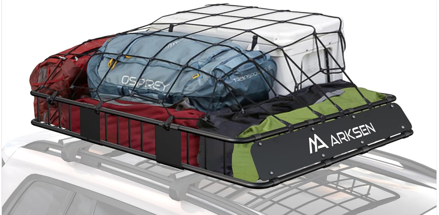
Figure 4.1: Example of a loaded roof basket, demonstrating how various items can be secured using a cargo net for safe transport.