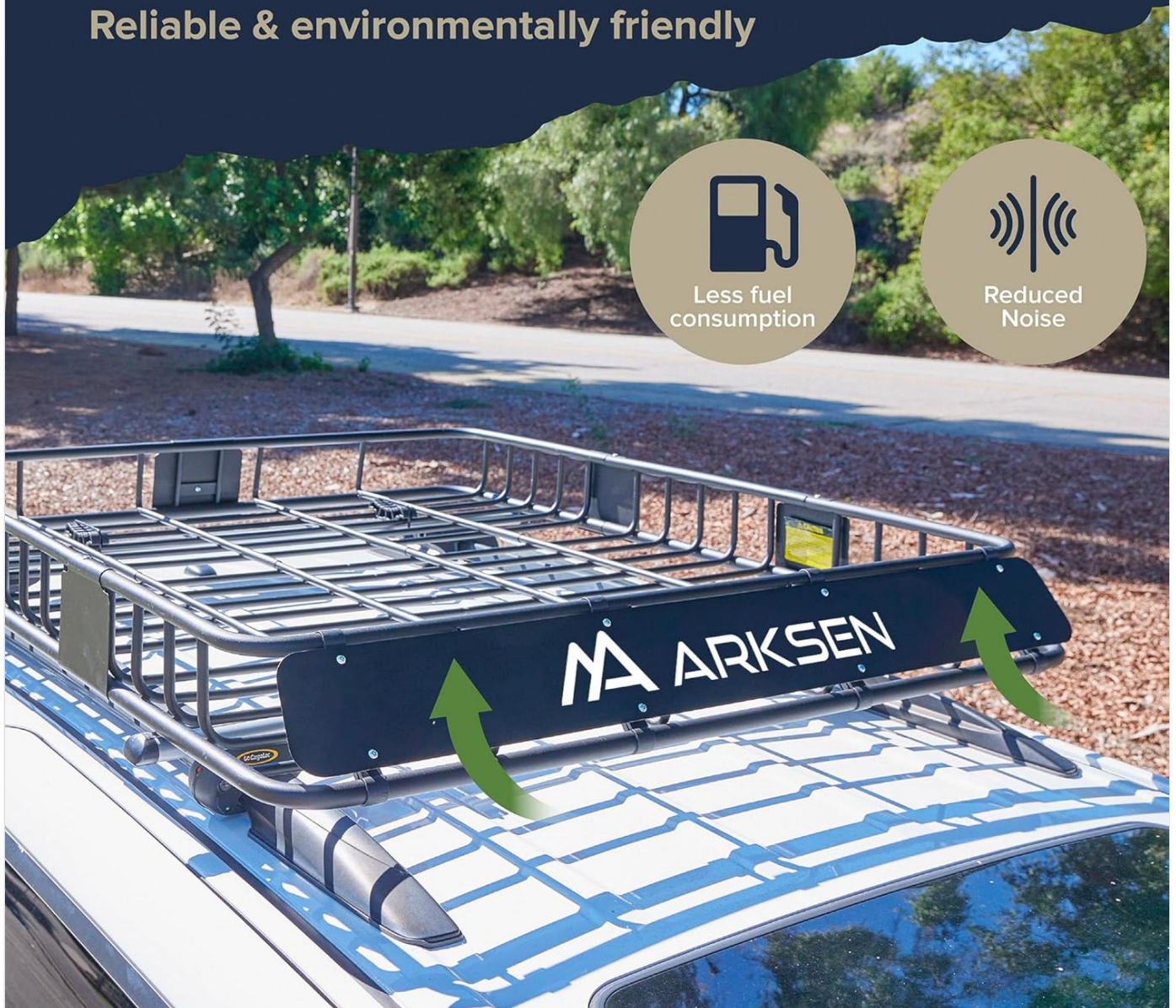
Figure 3.1: Detail of the U-bolt mounting system, showing how the rack attaches to vehicle crossbars. Note that crossbars are required and not included.

For detailed visual instructions, please refer to the official User Manual PDF available for download via the product listing or manufacturer's website.