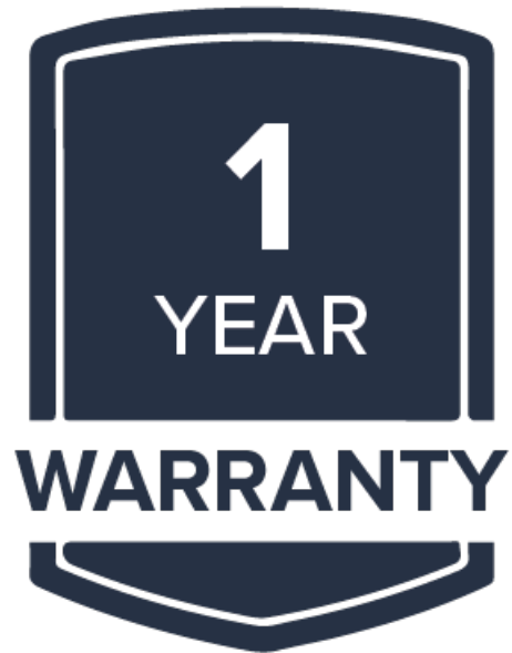
Figure 8.1: ARKSEN 1-Year Warranty Badge.