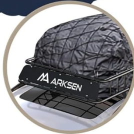
Tie down gear