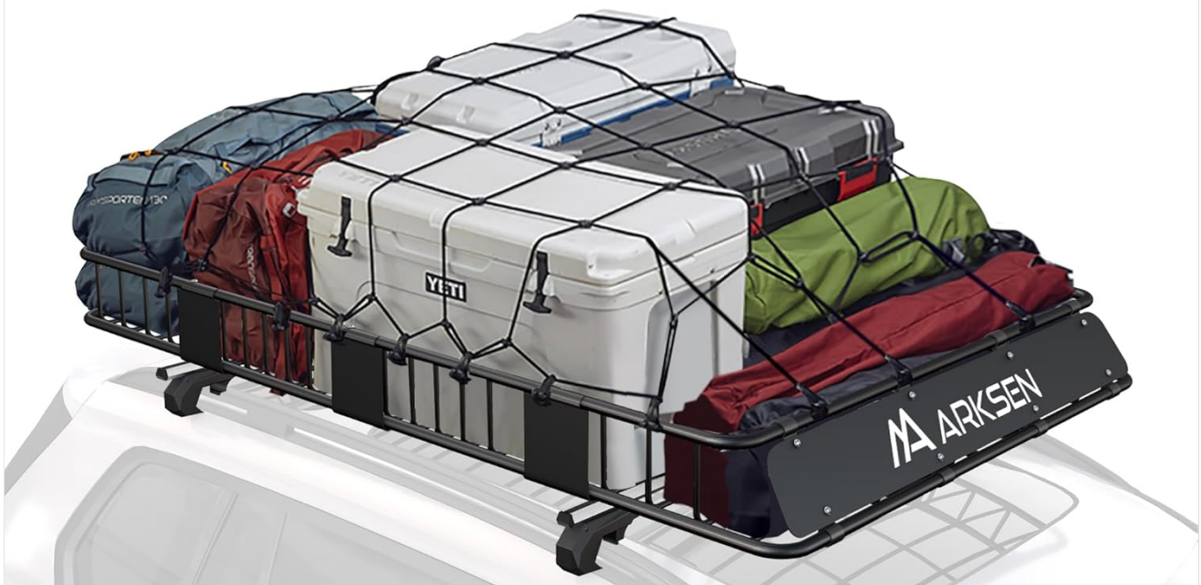
Image: The ARKSEN roof rack shown with various types of cargo, such as bags and coolers, secured with a cargo net, demonstrating its versatility for different gear.