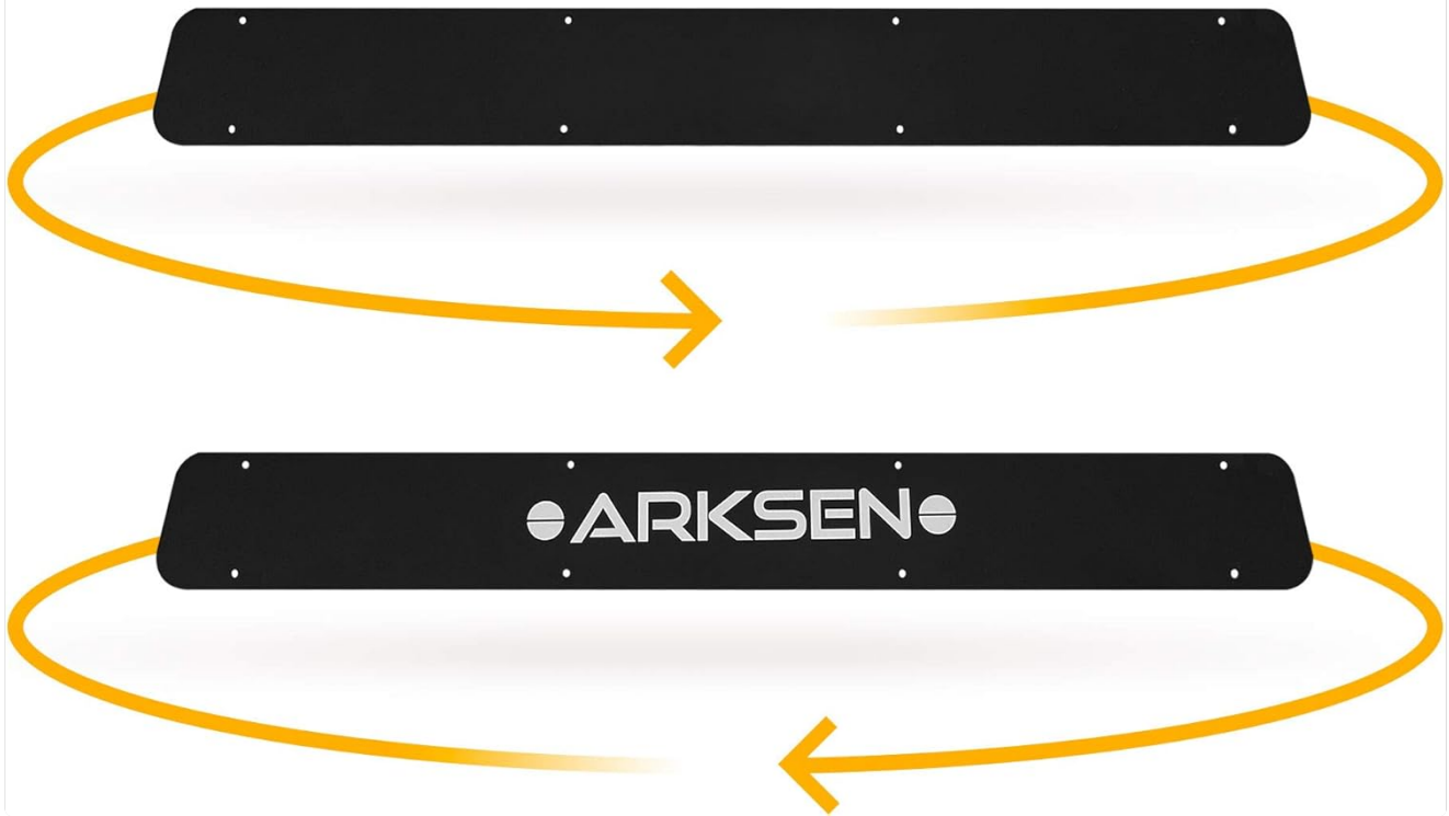
Image: A close-up of the ARKSEN roof rack's wind fairing, showing its design and how it integrates with the front of the basket to improve aerodynamics.

Choose between a branded or stealthy appearance