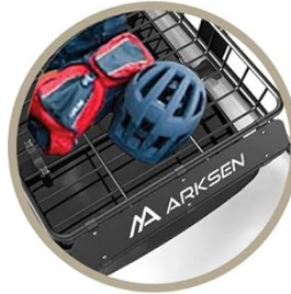
Keep dirty gear outside