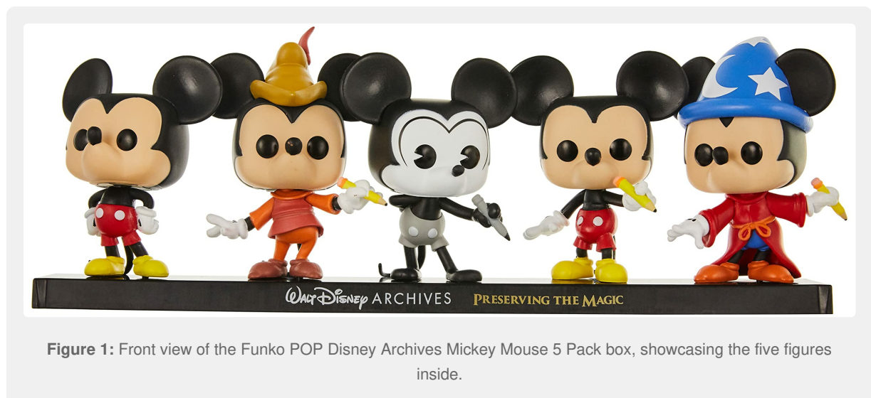
Figure 1: Front view of the Funko POP Disney Archives Mickey Mouse 5 Pack box, showcasing the five figures inside.