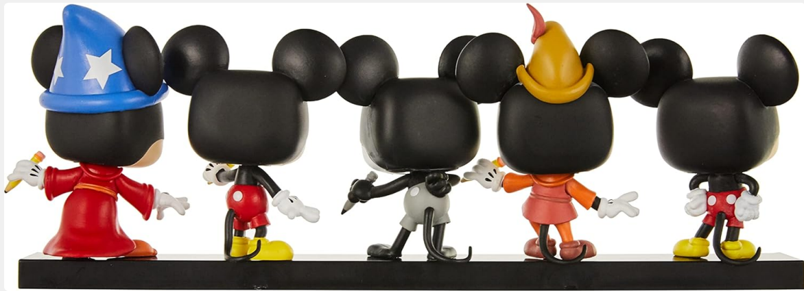
Figure 2: Rear view of the five Mickey Mouse figures on their commemorative display base, highlighting their different outfits and the base design.