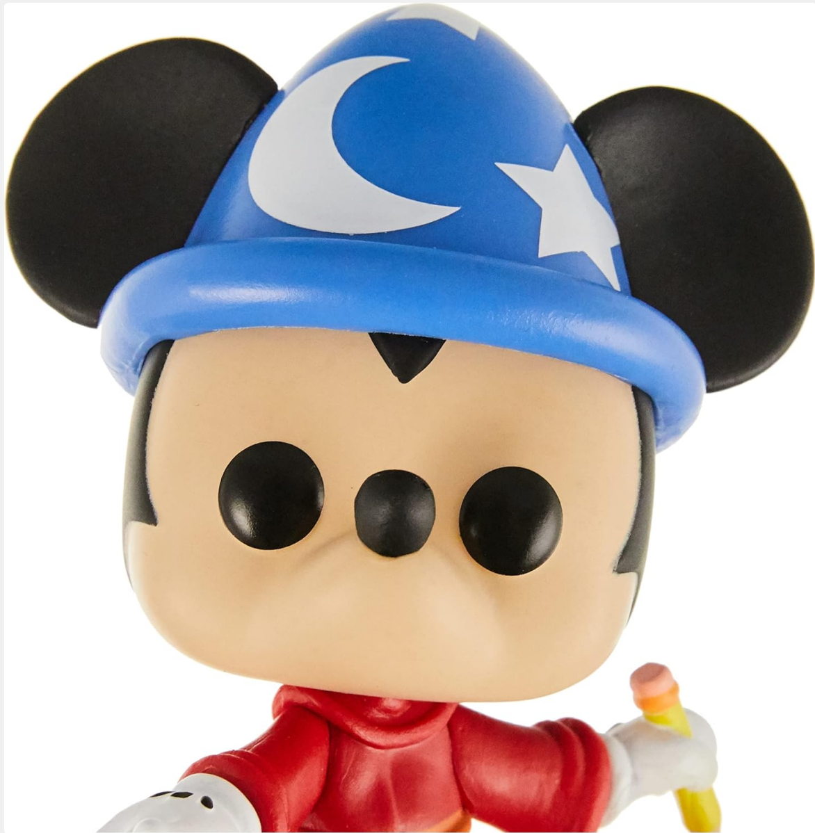
Figure 3: Close-up of the Sorcerer Mickey Mouse figure, showing detail on the hat and robe.