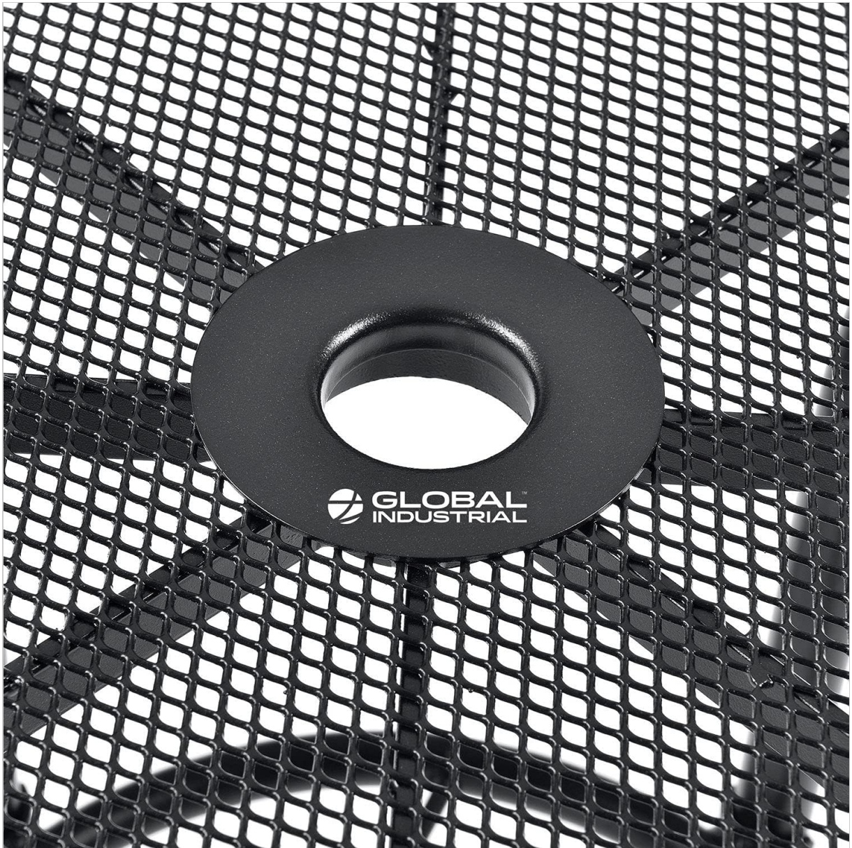
Image: Close-up view of the central umbrella hole on the table's mesh surface. The hole is designed to fit standard patio umbrellas.