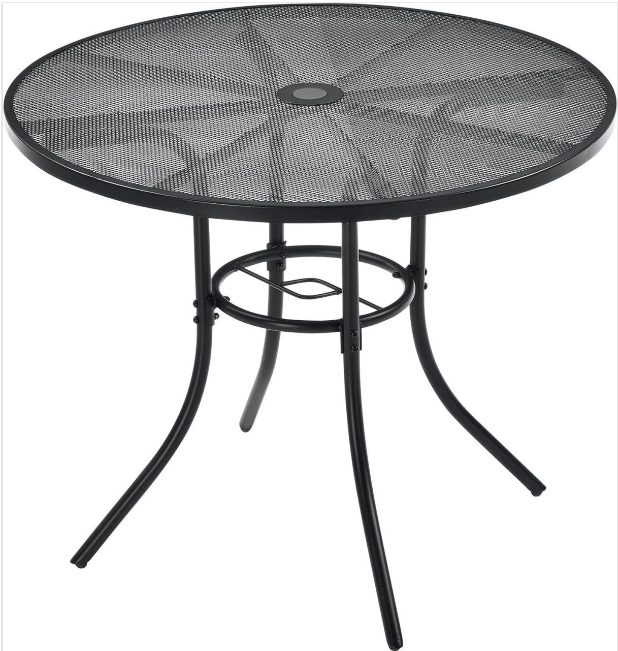
Image: Front view of the Global Industrial 36-inch Round Steel Mesh Outdoor Cafe Table. The table features a black, round, steel mesh tabletop and four curved legs, with a central umbrella hole.