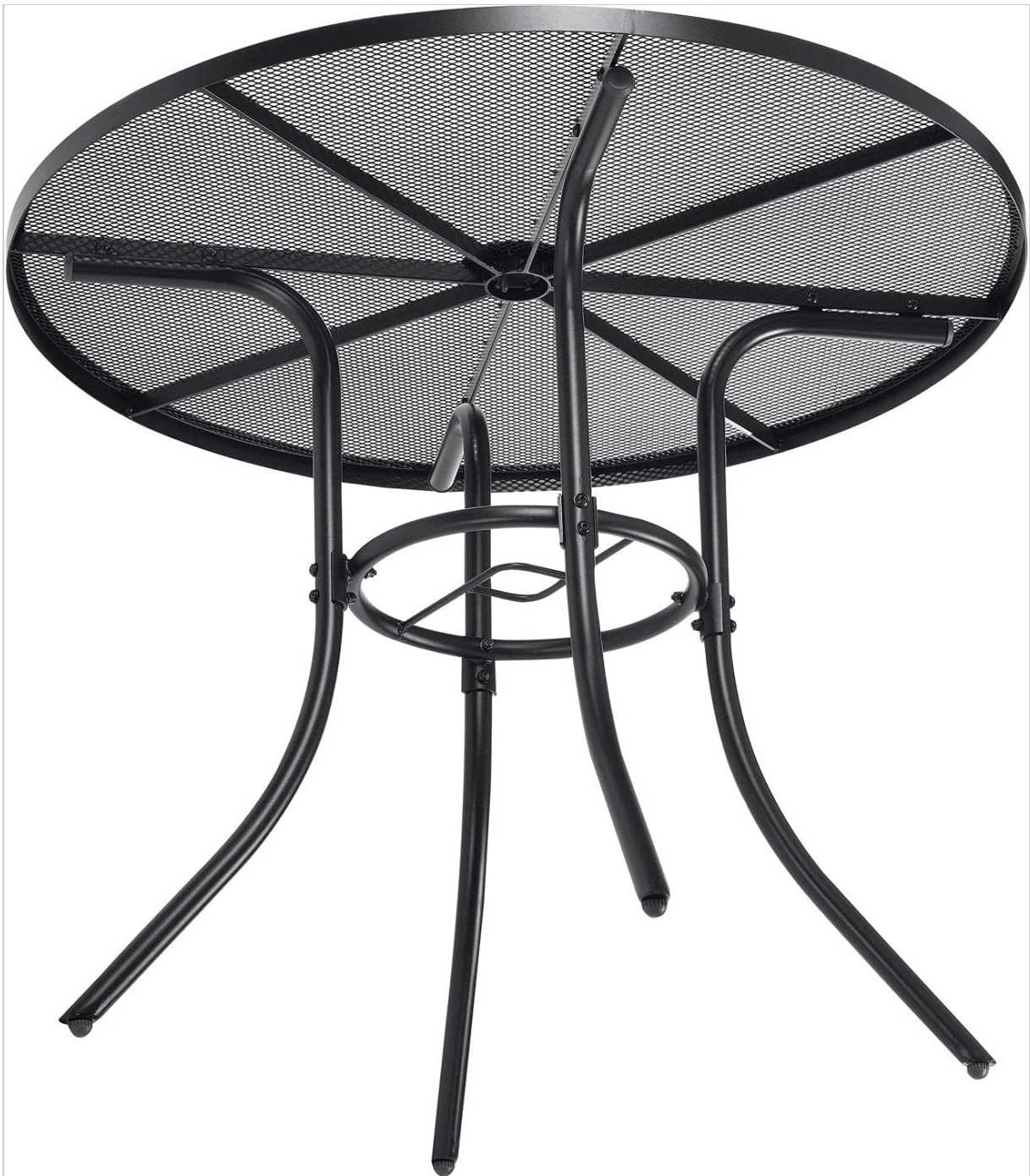
Image: Underside view of the table, illustrating the attachment points for the legs and the circular support ring. This view helps in understanding the assembly process.