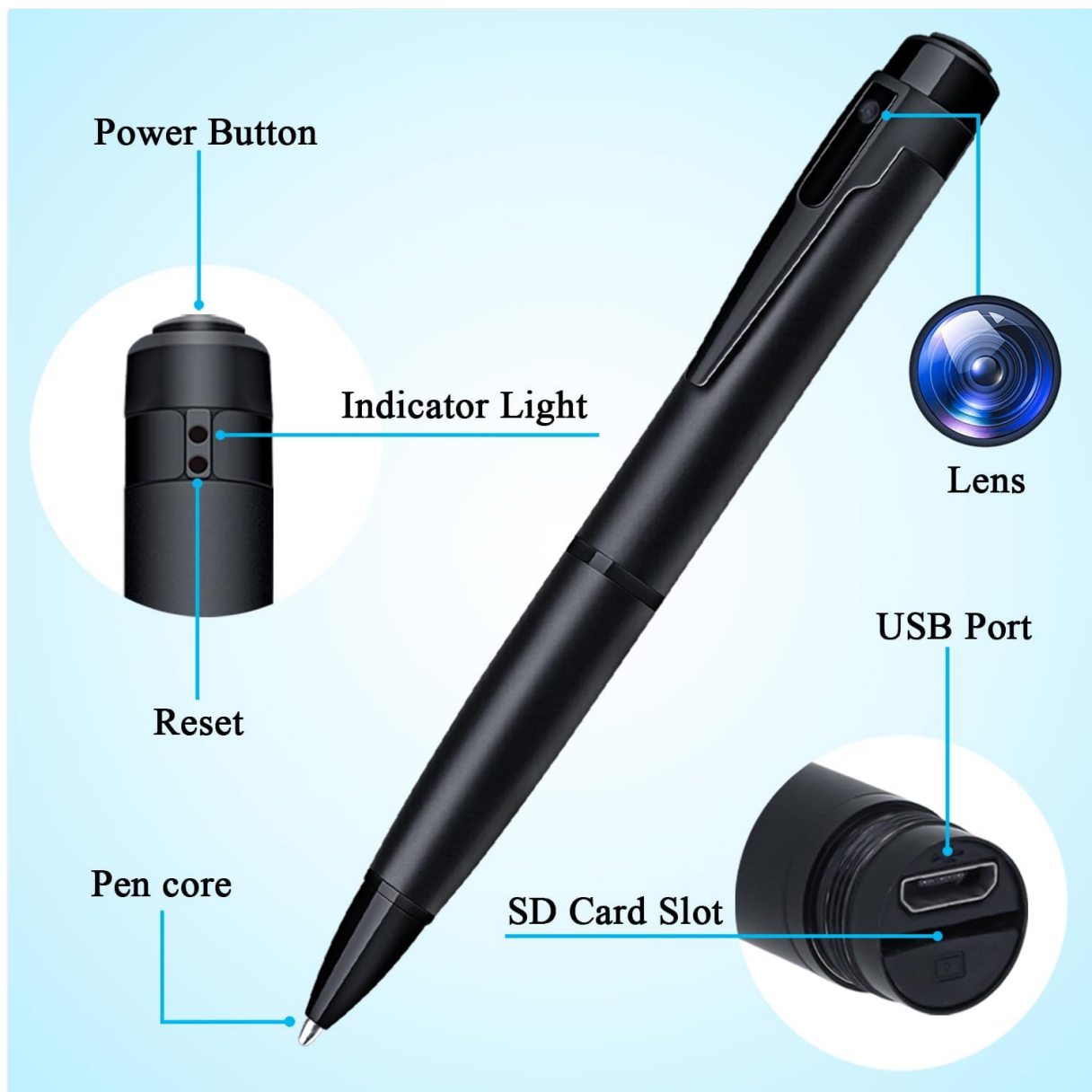
Image: Labeled diagram of the pen camera's parts.