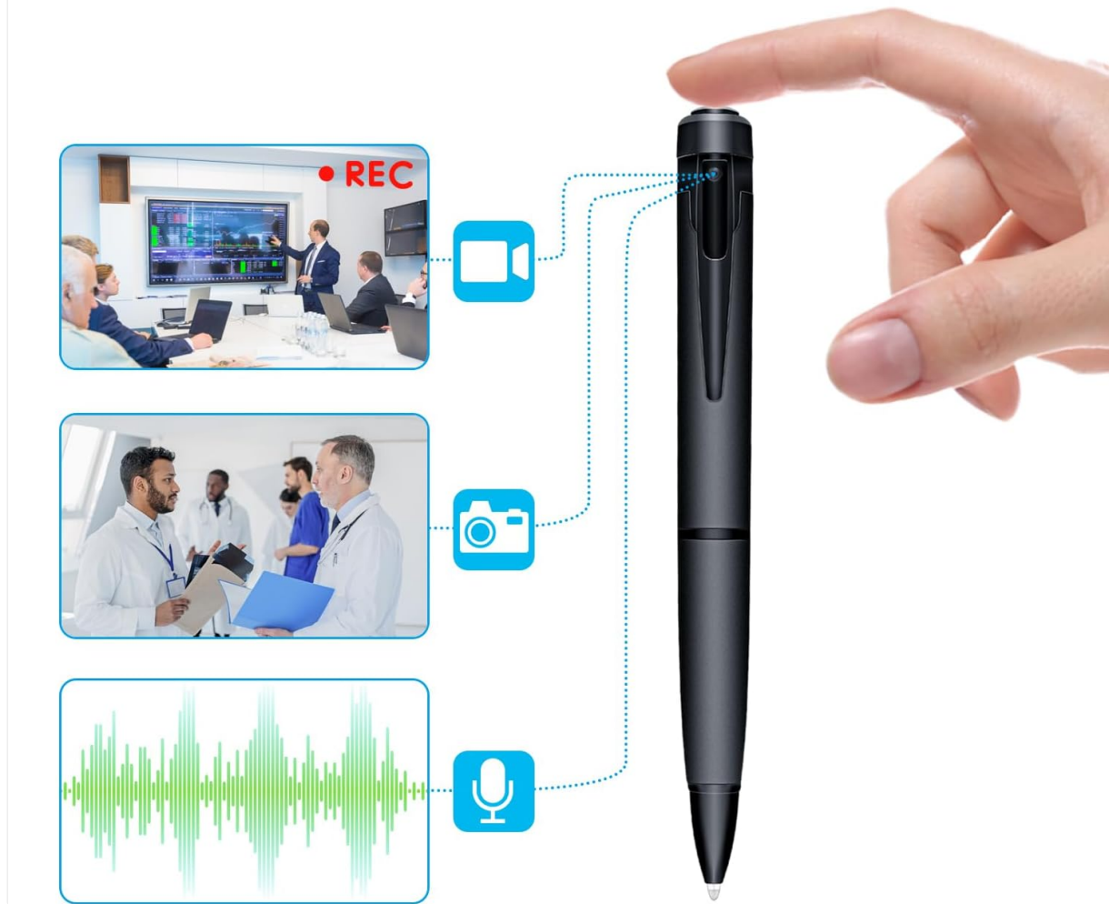
Image: Single button operation for various functions.

Only one button controls video recording, photo taking, and audio recording.