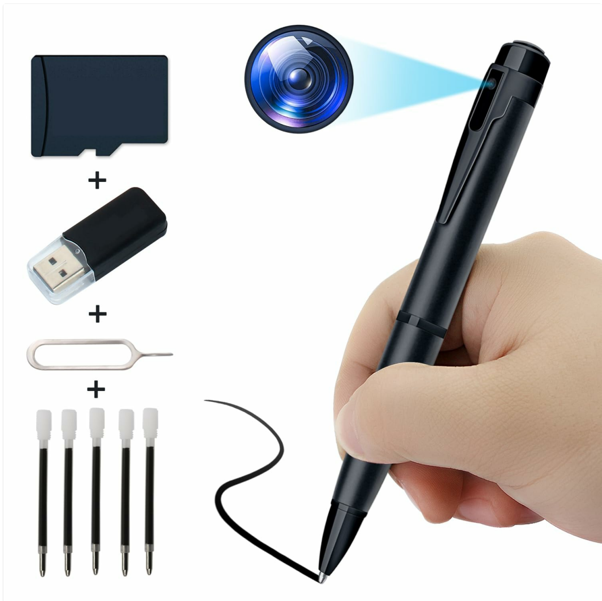
Image: The Igzyz 1080P Pen Camera, a discreet recording device.