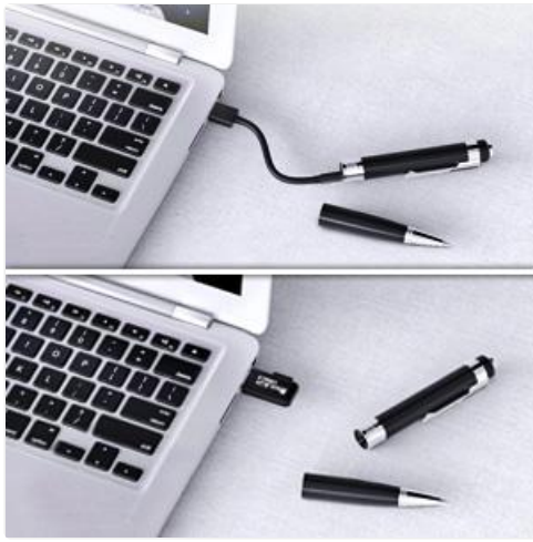
Image: Proper insertion of the Micro SD card.