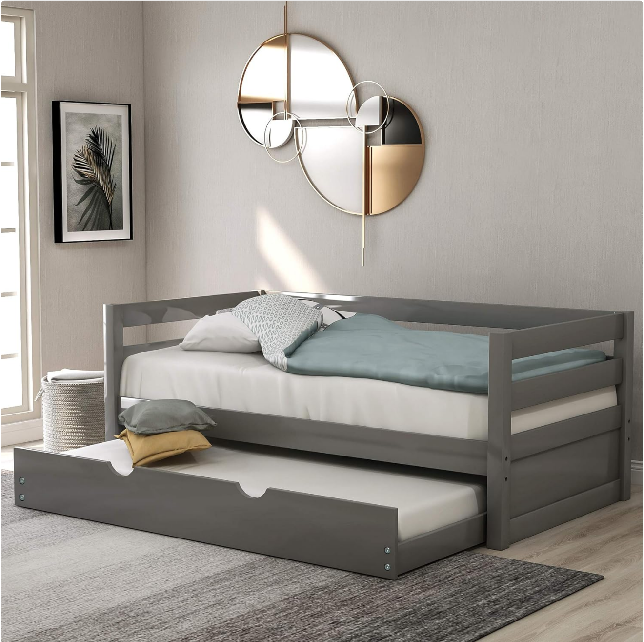
Image: The fully assembled Flieks Twin Daybed in grey, with the trundle neatly tucked underneath. This image illustrates the overall appearance and compact design of the daybed.