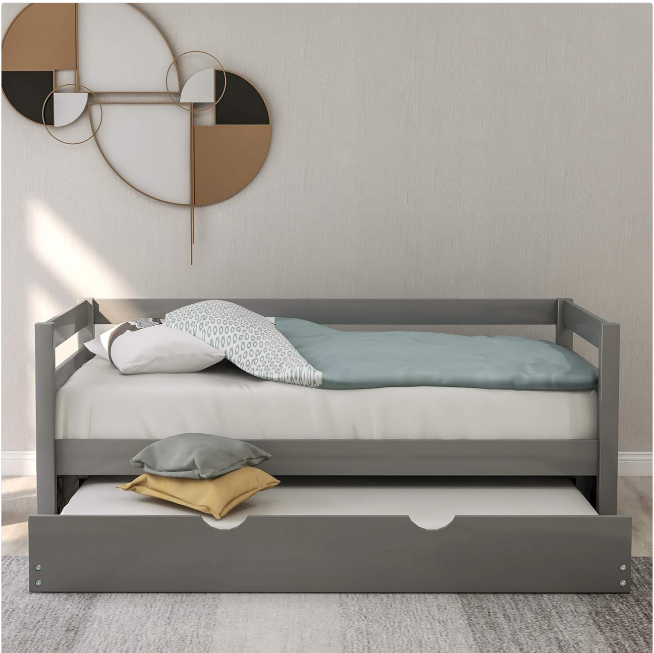
Image: The Flieks Twin Daybed with the trundle neatly tucked away, demonstrating its compact form factor when not in use, ideal for saving space.