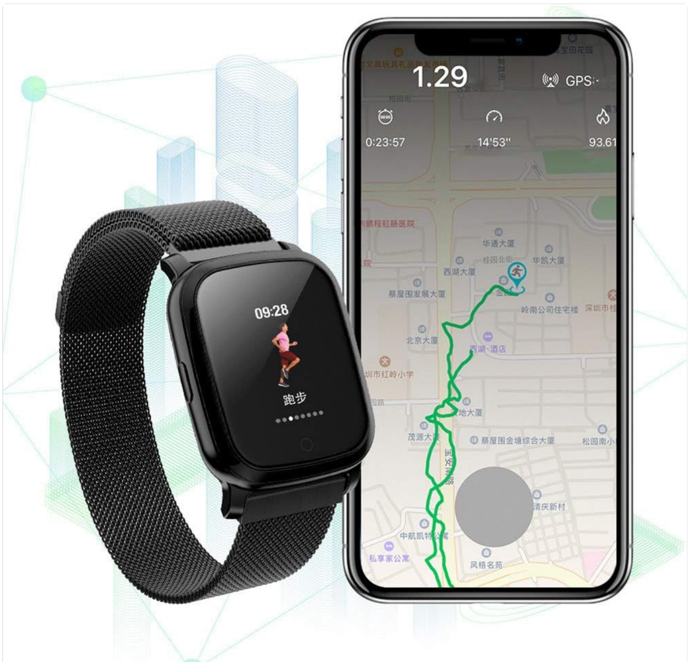
Image: The Shiyu Y7 Smart Watch displaying a running activity, positioned next to a smartphone showing a GPS map with a recorded track.