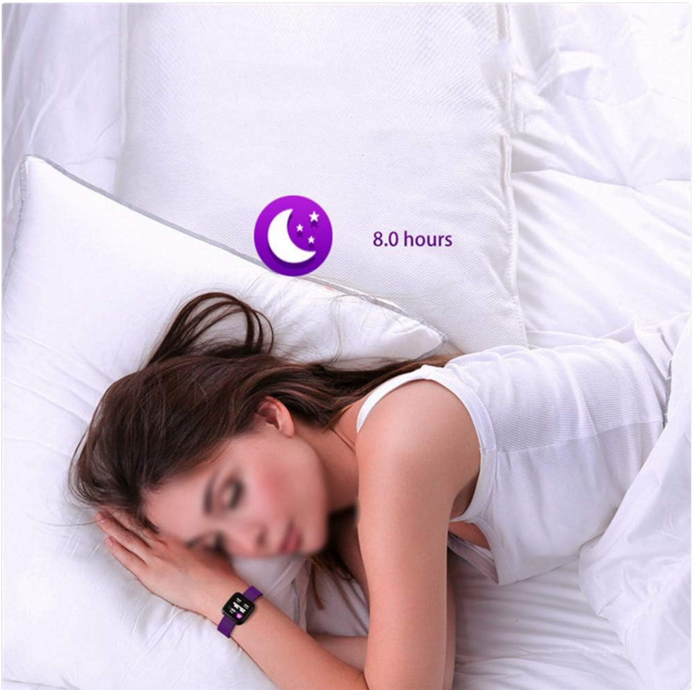
Image: A person sleeping with the Shiyu Y7 Smart Watch on their wrist, showing a sleep tracking icon and "8.0 hours" indicating sleep duration.