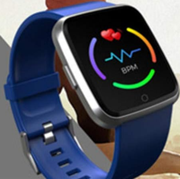
Image: A close-up of the Shiyu Y7 Smart Watch displaying heart rate data (BPM) and a graph, indicating 24-hour heart rate monitoring.