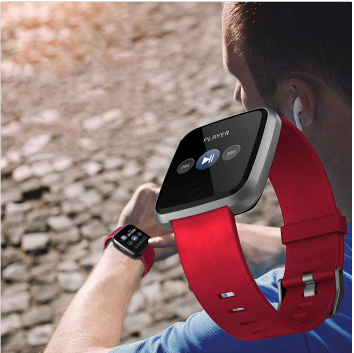
Image: A person wearing the Shiyu Y7 Smart Watch, which displays music player controls (play/pause, skip), indicating its music control feature.