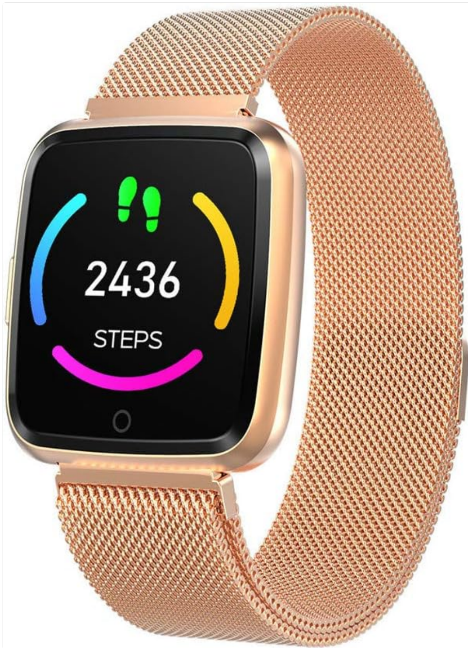
Image: The Shiyu Y7 Smart Watch in beige with a mesh strap, displaying a vibrant interface showing 2436 steps.