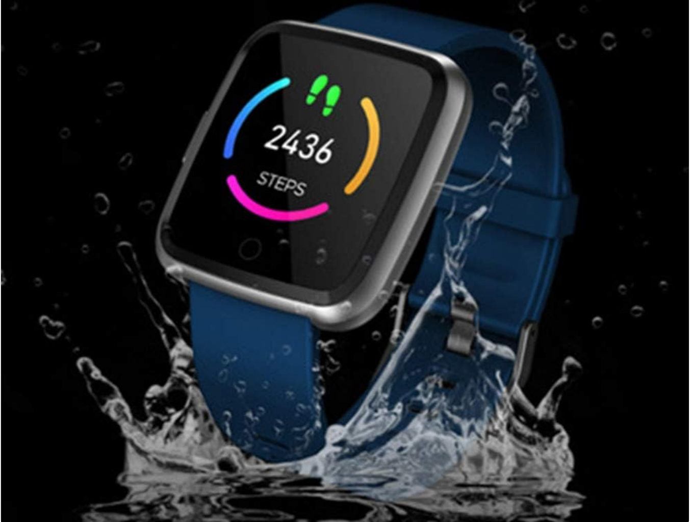
Image: The Shiyu Y7 Smart Watch being splashed with water, illustrating its IP67 waterproof capability, with the screen still showing step count.

IP67 class waterproof and dustproof, not only can protect the daily life of particulate dust, sweat, etc. It can also be rinsed directly with water.