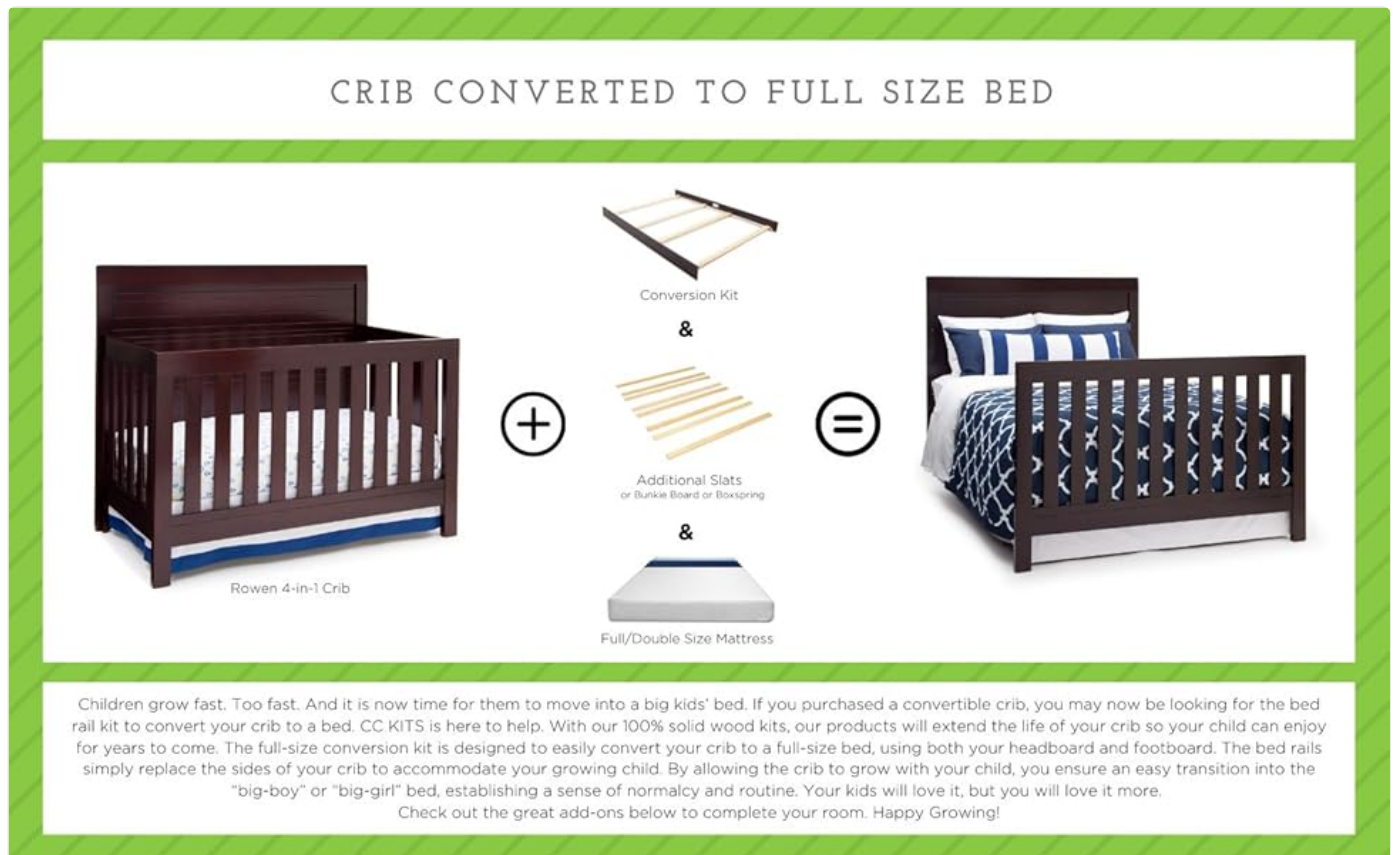
Image: Diagram illustrating the conversion of a crib to a full-size bed using the conversion kit, additional slats, and a full/double size mattress.

This conversion kit allows you to transform your compatible Rowen Convertible Crib by Simmon Kids or Delta Children into a full-size bed. It includes the necessary bed rails, slats, and hardware for assembly. This kit is designed to provide a safe and stable sleeping solution for your growing child.