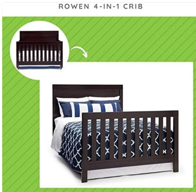
Image: The Rowen 4-in-1 crib shown alongside its converted full-size bed configuration.