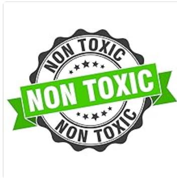
Image: Badge indicating the product is made with non-toxic materials.