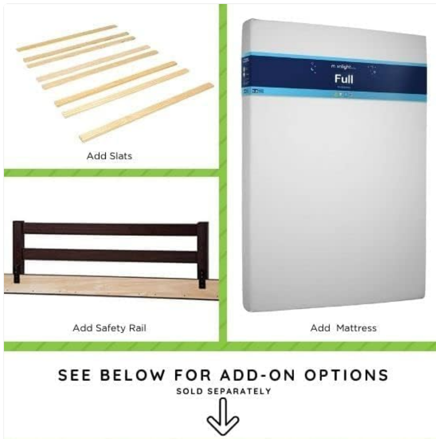
Image: Visual representation of optional add-ons for the conversion kit, including additional slats, a safety rail, and a full-size mattress.

Note: Additional slats and a full-size mattress are required and sold separately to complete the full-size bed conversion. A box spring can be used instead of additional slats, but this will result in a higher bed.