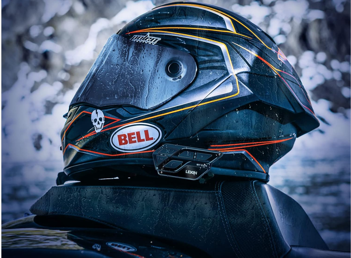
Image: The LEXIN ET-COM unit shown in a wet environment, highlighting its IP67 waterproof rating, suitable for use in rain.