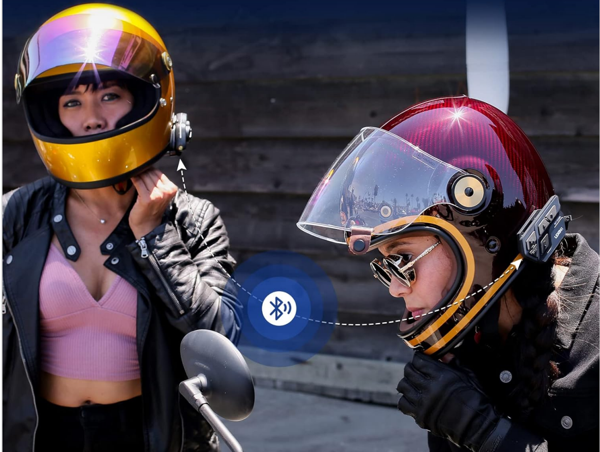
Image: Visual representation of the LEXIN ET-COM's universal pairing feature, showing connection to another brand's headset.