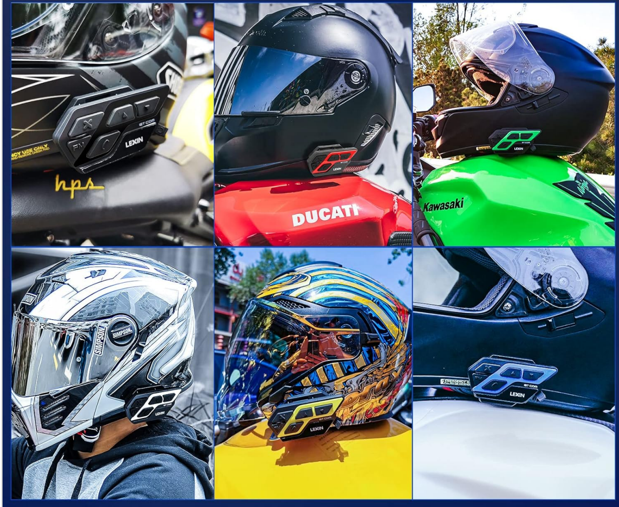
Image: Display of the LEXIN ET-COM unit with various interchangeable 6-color face plates, allowing customization to match different helmets or preferences.

Match different colors of helmets and vehicles