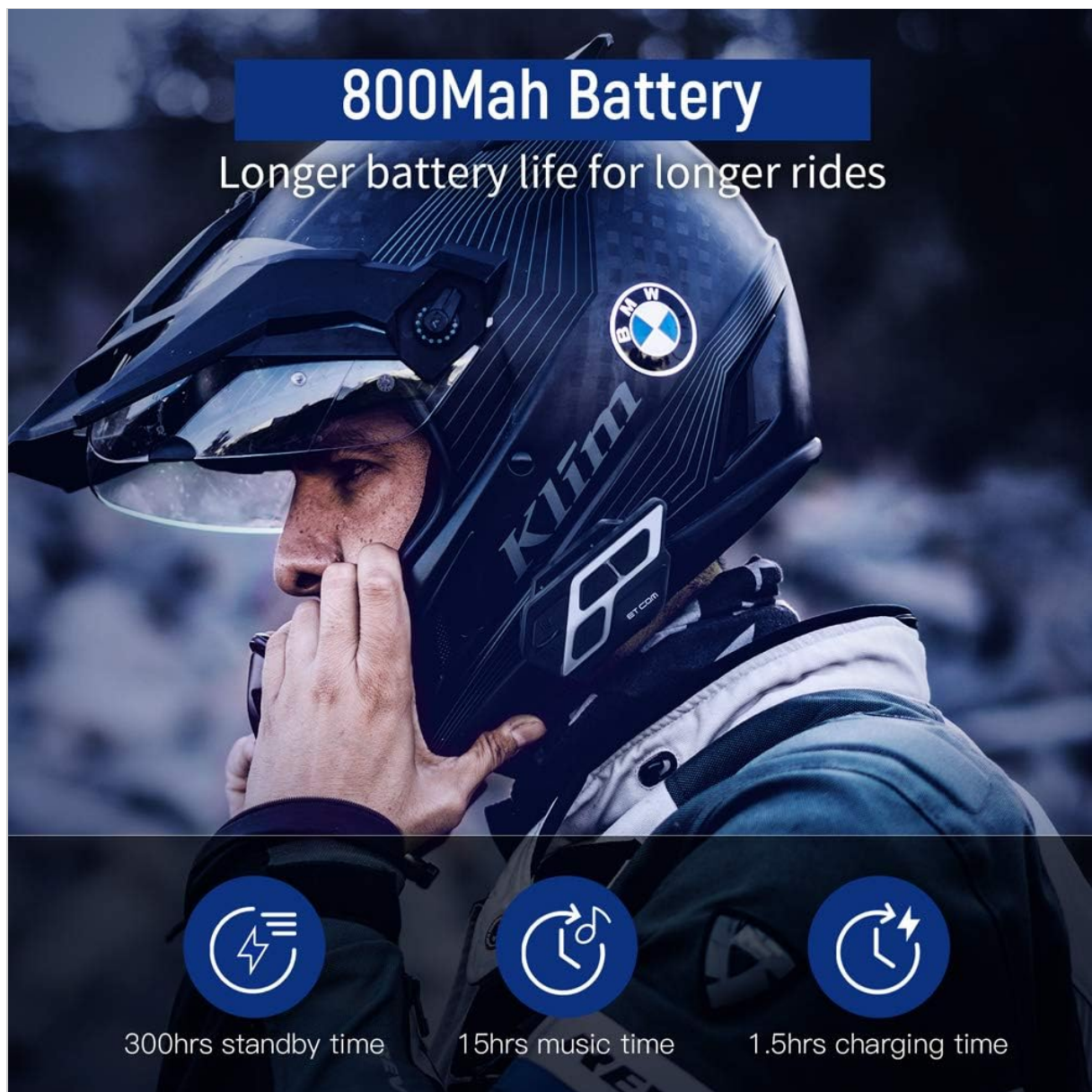
Image: Visual representation of the LEXIN ET-COM's 800mAh battery, indicating 300 hours standby time, 15 hours music time, and 1.5 hours charging time.