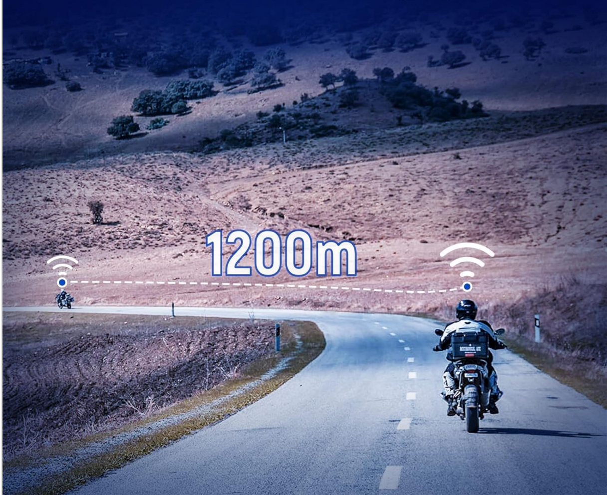
Image: Illustration showing two riders communicating via LEXIN ET-COM intercom over a distance of up to 1200 meters (0.8 miles).

Fast talk between 2 riders with range up to 1200m