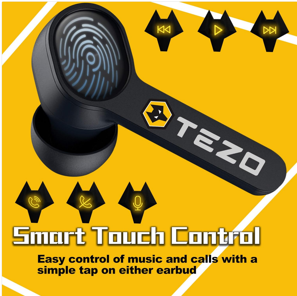
Image: TEZO TT06B Earbud Touch Control Functions

The TEZO TT06B earbuds feature high-precision touch sensors for easy control of music and calls.