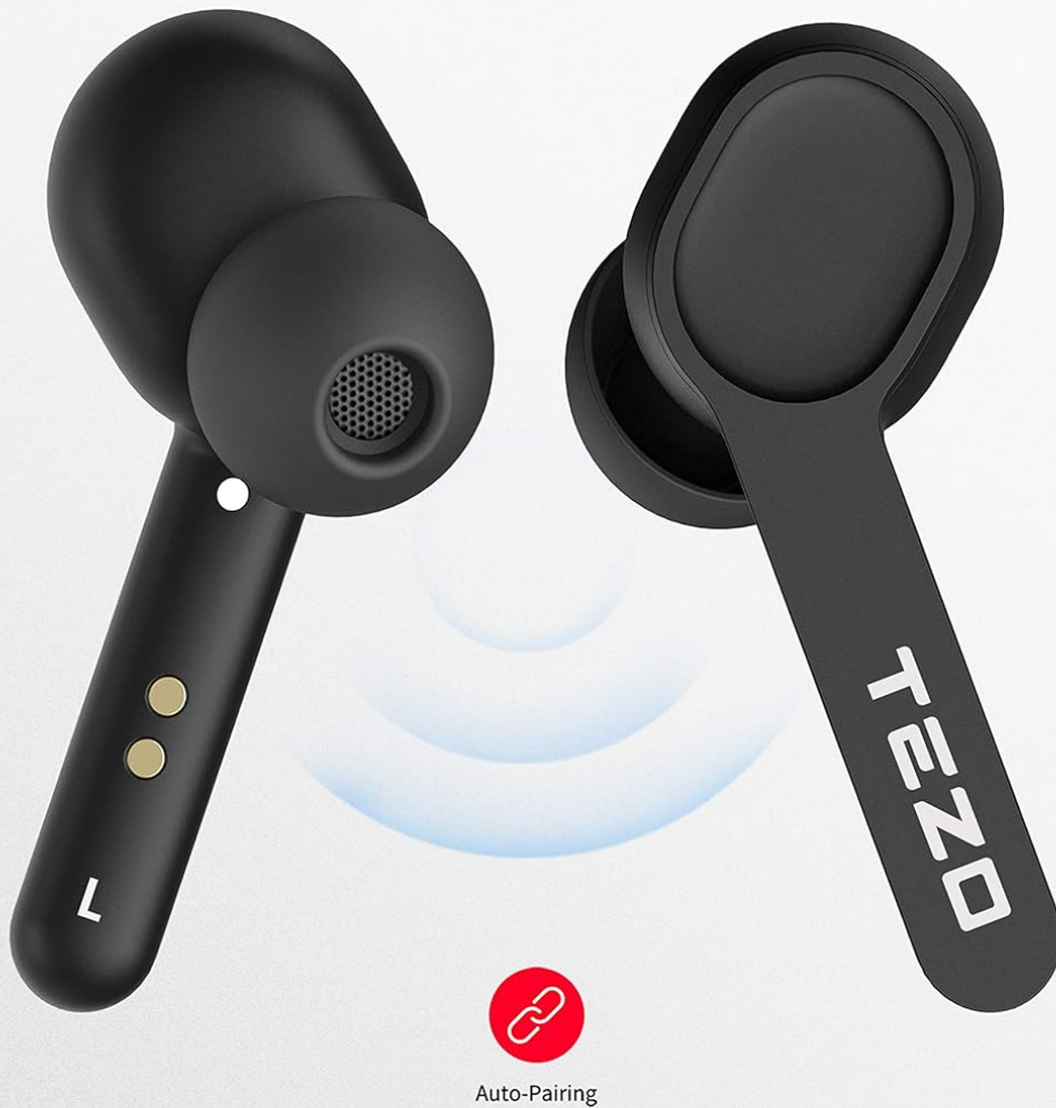
Image: Automatic Pairing of Left and Right Earbuds

The image shows the left and right TEZO TT06B earbuds, indicating their individual 'L' and 'R' markings. A subtle graphic suggests an automatic connection between the two earbuds, emphasizing the auto-pairing feature once they are removed from the case.