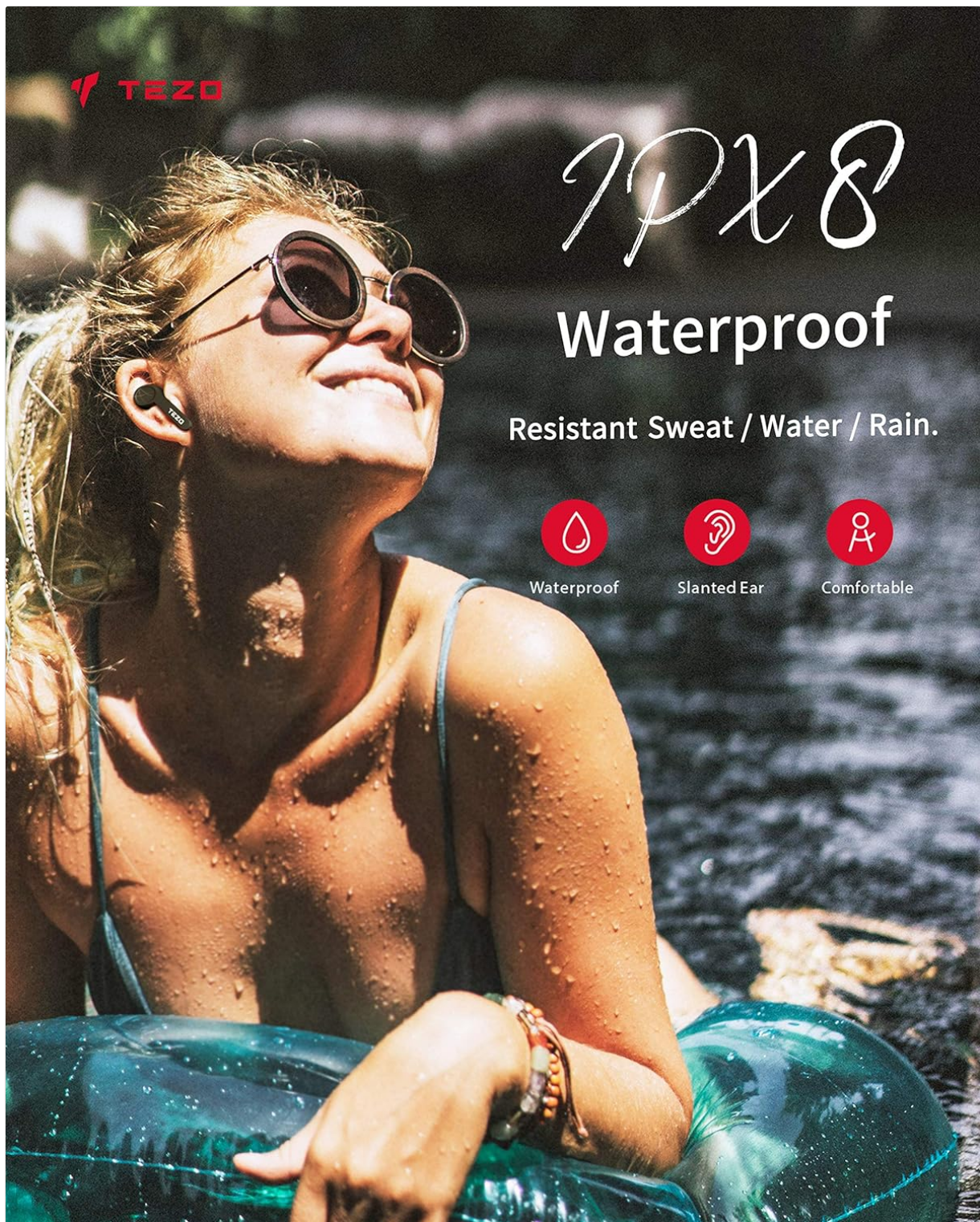
Image: TEZO TT06B Earbuds IPX8 Water Resistance

This image depicts a person enjoying water activities while wearing the TEZO TT06B earbuds, visually confirming their IPX8 waterproof rating. The text on the image highlights resistance to sweat, water, and rain, reinforcing the product's durability for active use.