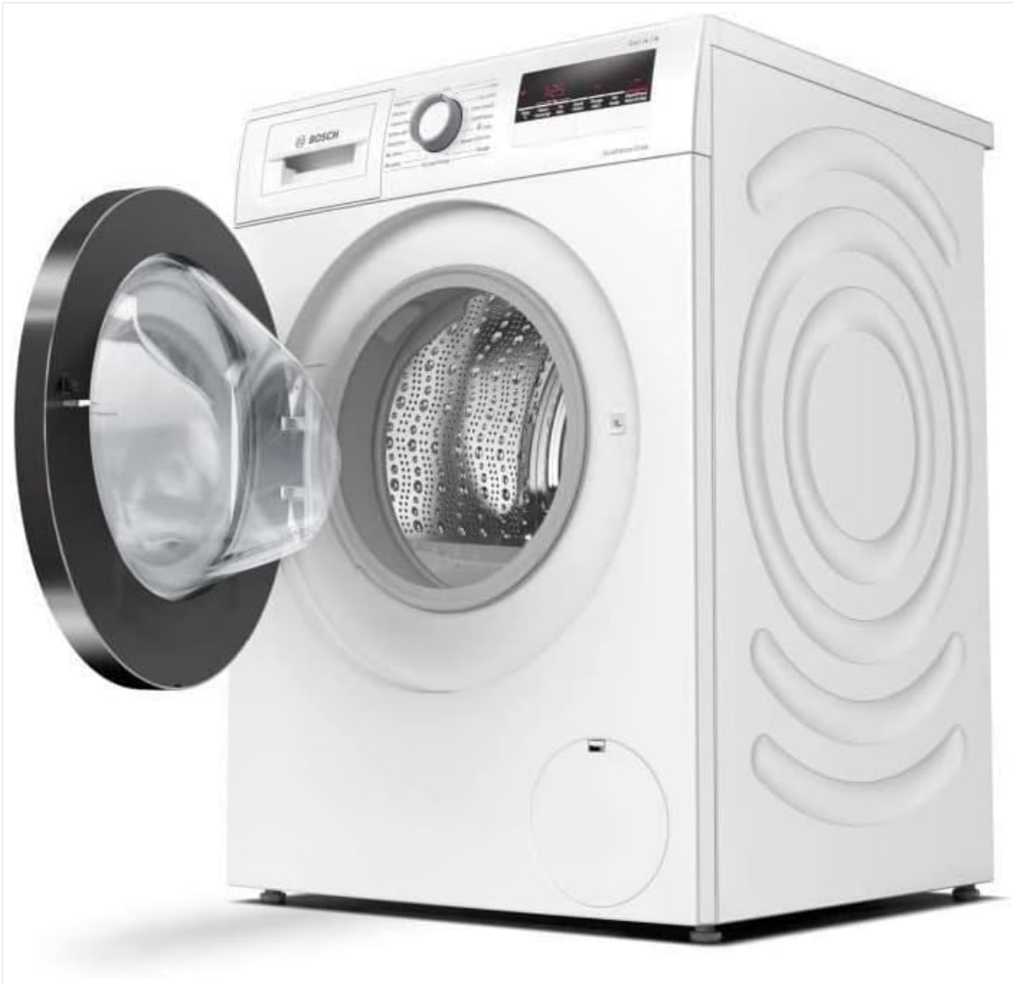
Figure 1: Bosch WAN 28209 FF washing machine, illustrating its front-load design and drum interior.