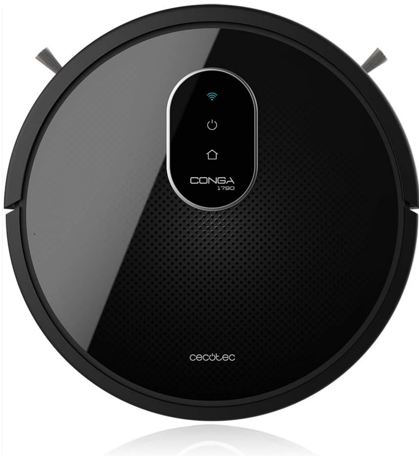
Image: Top view of the Conga 1790 Vital robot vacuum cleaner, highlighting its compact and modern design.