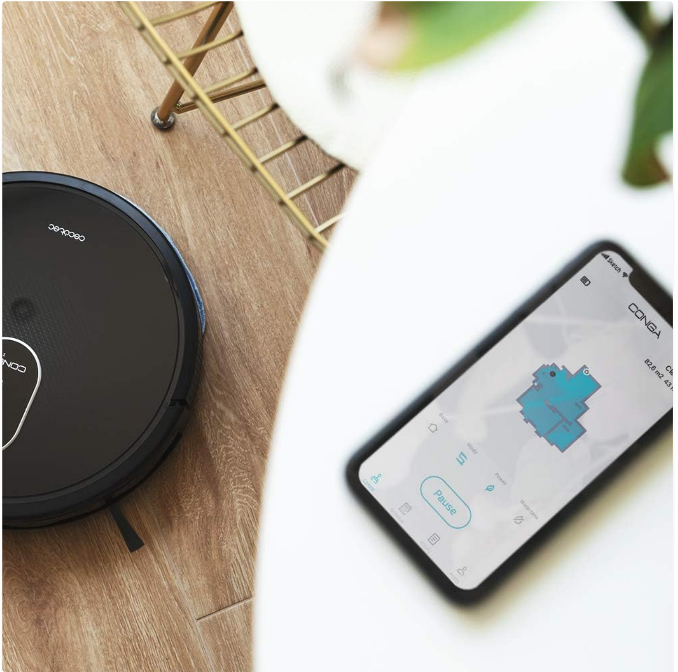
Image: The robot positioned near a smartphone, showcasing the detailed mapping feature within the Conga app.

You can schedule cleaning times, select specific cleaning modes, and adjust suction power (up to 2100 Pa with ForceClean system) and water flow for mopping.