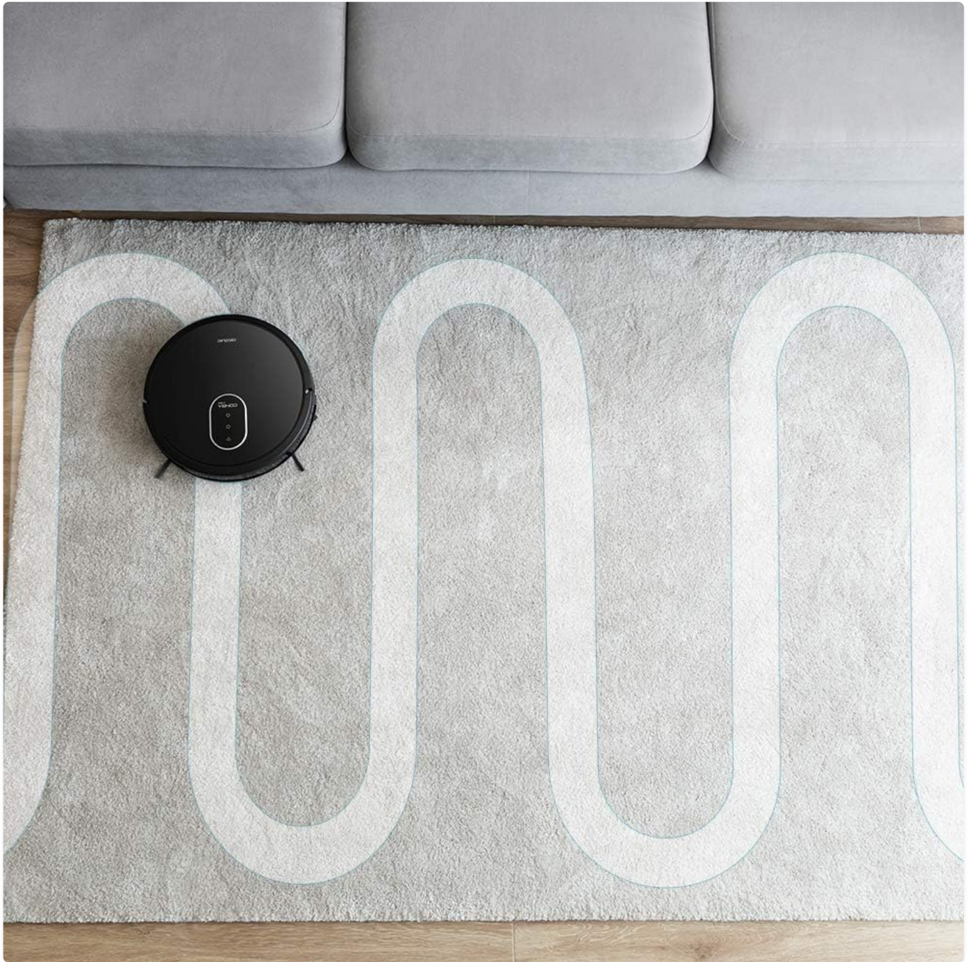
Image: The robot cleaning a rug, illustrating its methodical cleaning pattern.

The robot utilizes SmartGyro 3.0 technology for systematic and efficient cleaning. It maps your home as it cleans, ensuring it covers all accessible areas. Its gyroscopic, proximity, anti-shock, and anti-fall sensors help it navigate around obstacles and avoid stairs.