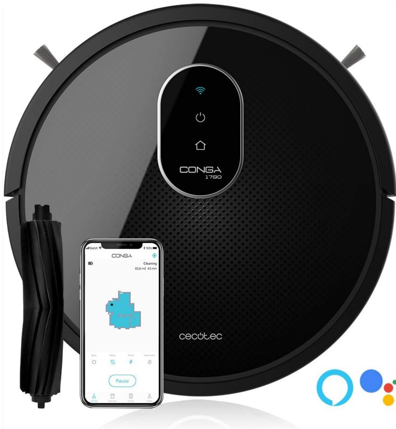
Image: The robot vacuum cleaner alongside a smartphone showing the Conga app interface with a mapped cleaning area.

Download the official Cecotec Conga app from your smartphone's app store. Create an account and follow the in-app instructions to connect your robot. Important: The robot requires a 2.4 GHz Wi-Fi network for connection. If you have a dual-band router, ensure your phone is connected to the 2.4 GHz network during the setup process. The app allows you to control cleaning modes, schedule cleaning, adjust suction and scrubbing levels, and view cleaning history and the virtual map of your home.