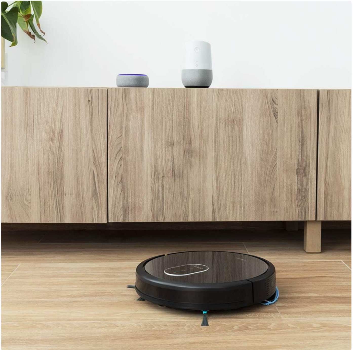
Image: The robot vacuum cleaner in a home setting, demonstrating its compatibility with popular voice assistant devices.