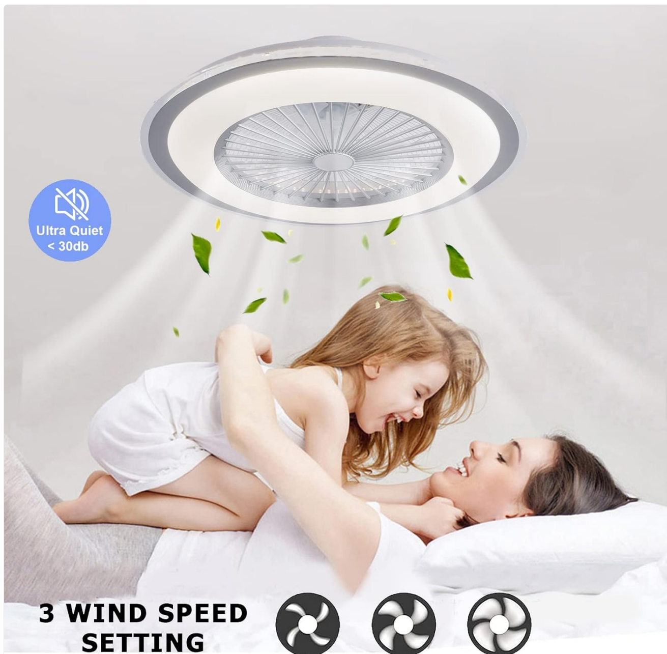
Image: Ultra-quiet operation and 3 wind speed settings.