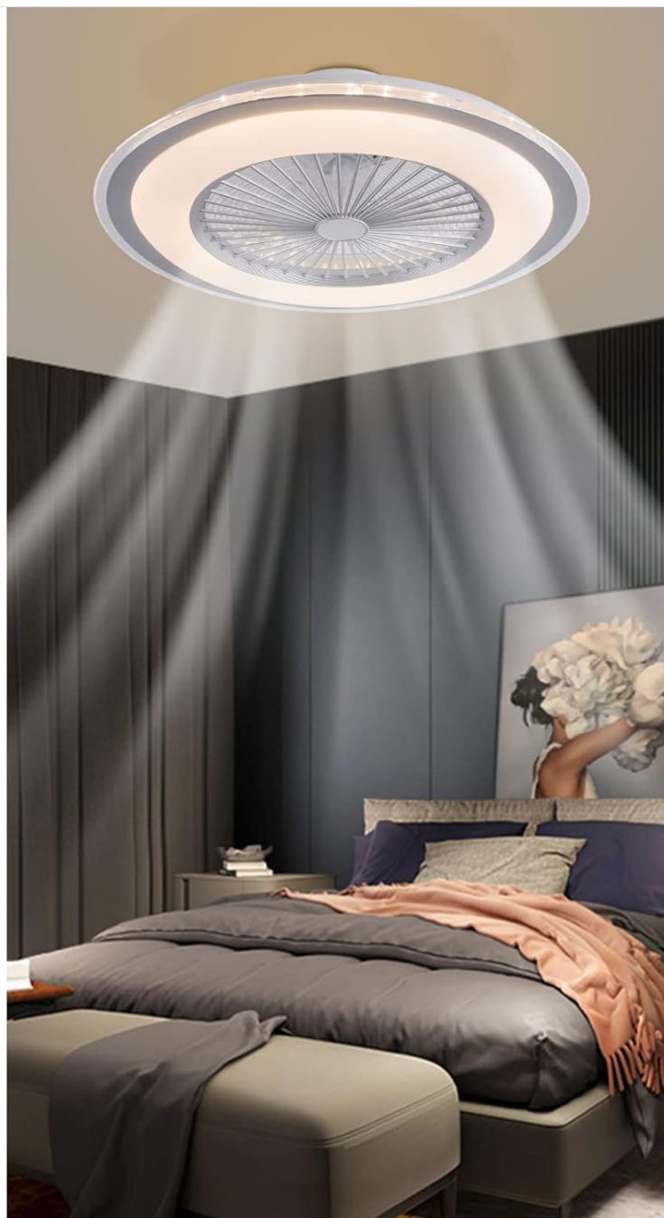
Image: Three-speed wind settings.