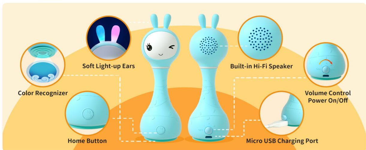
Image 9.1: Contents included in the alilo Smarty Bunny Rattle package.

For additional information and product registration, please visit the official alilo store alilo Store on Amazon .