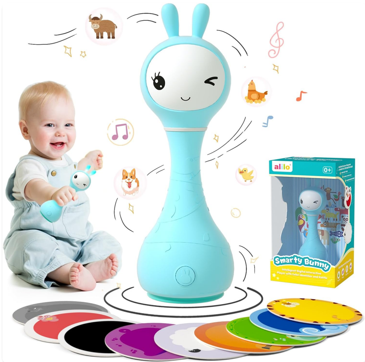
Image 1.1: The alilo Smarty Bunny Rattle, showcasing its design and accompanying color cards.