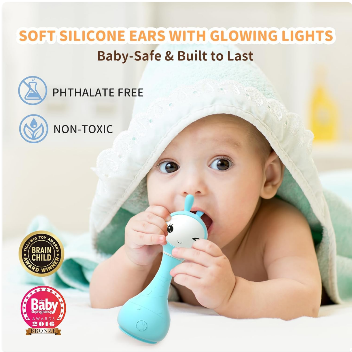
Image 6.1: Demonstrating the safe, soft silicone ears of the Smarty Bunny Rattle, suitable for teething.