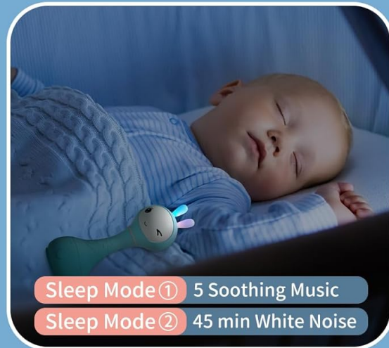
Image 4.1: Visual representation of the five operational modes of the Smarty Bunny Rattle.