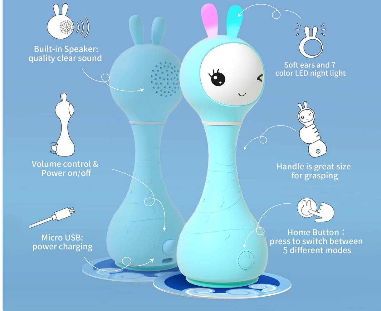
Image 2.1: Detailed diagram illustrating the various features and components of the Smarty Bunny Rattle.