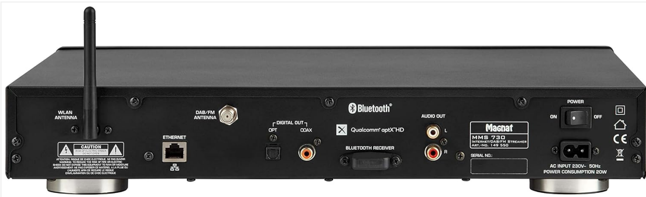
Figure 4.3: Rear panel showing various input and output connections.