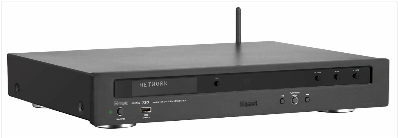
Figure 4.1: Front view of the Magnat MMS 730 network streamer.

The front panel features the main display, control buttons, and a USB input for local media playback.