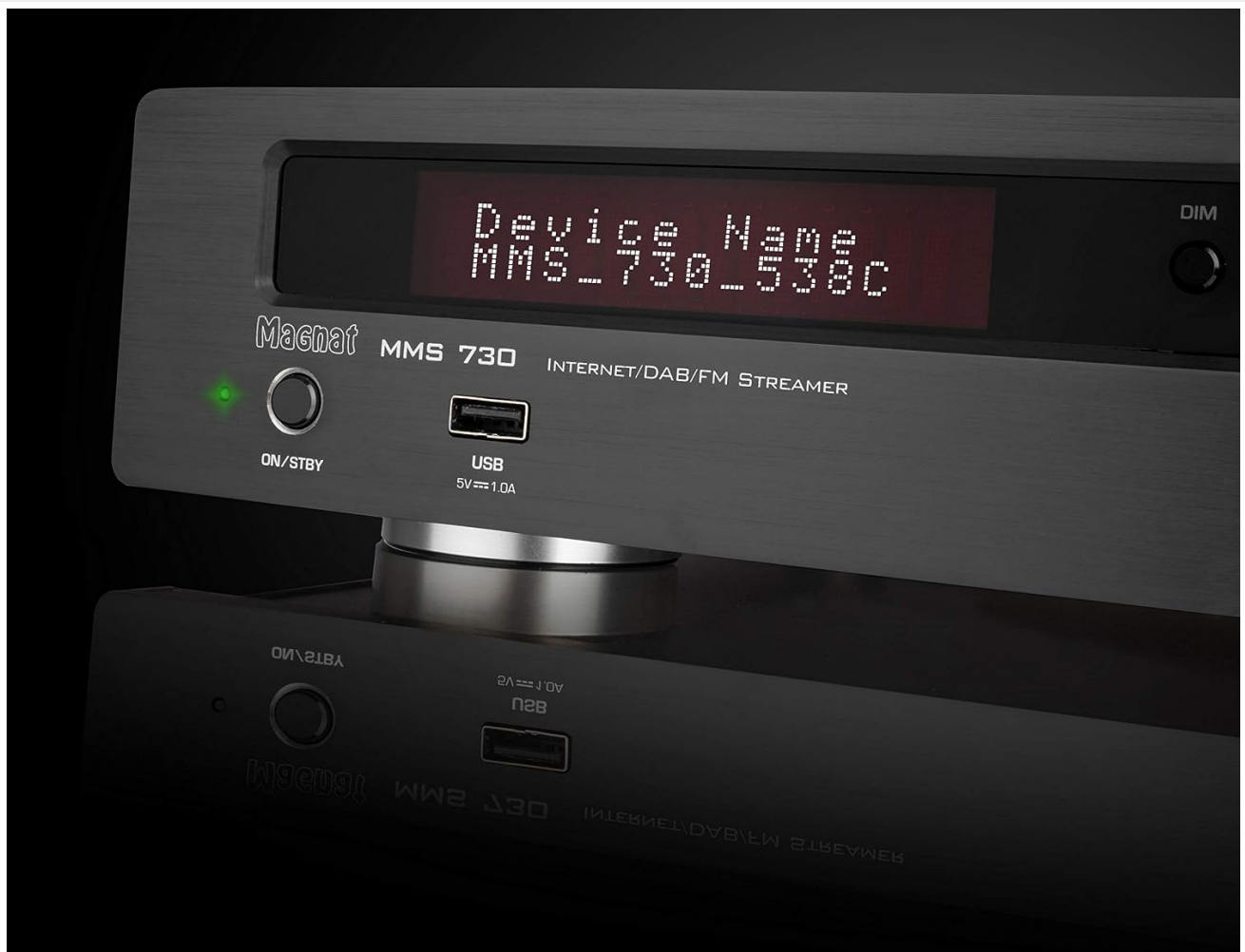
Figure 4.2: Close-up of the front panel showing the display and USB port. The display shows "Device Name: MMS_730_538c".