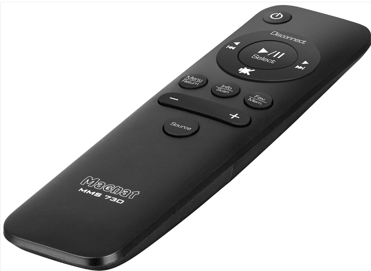
Figure 4.4: The remote control for the Magnat MMS 730.

The included remote control provides convenient access to all functions of the MMS 730.