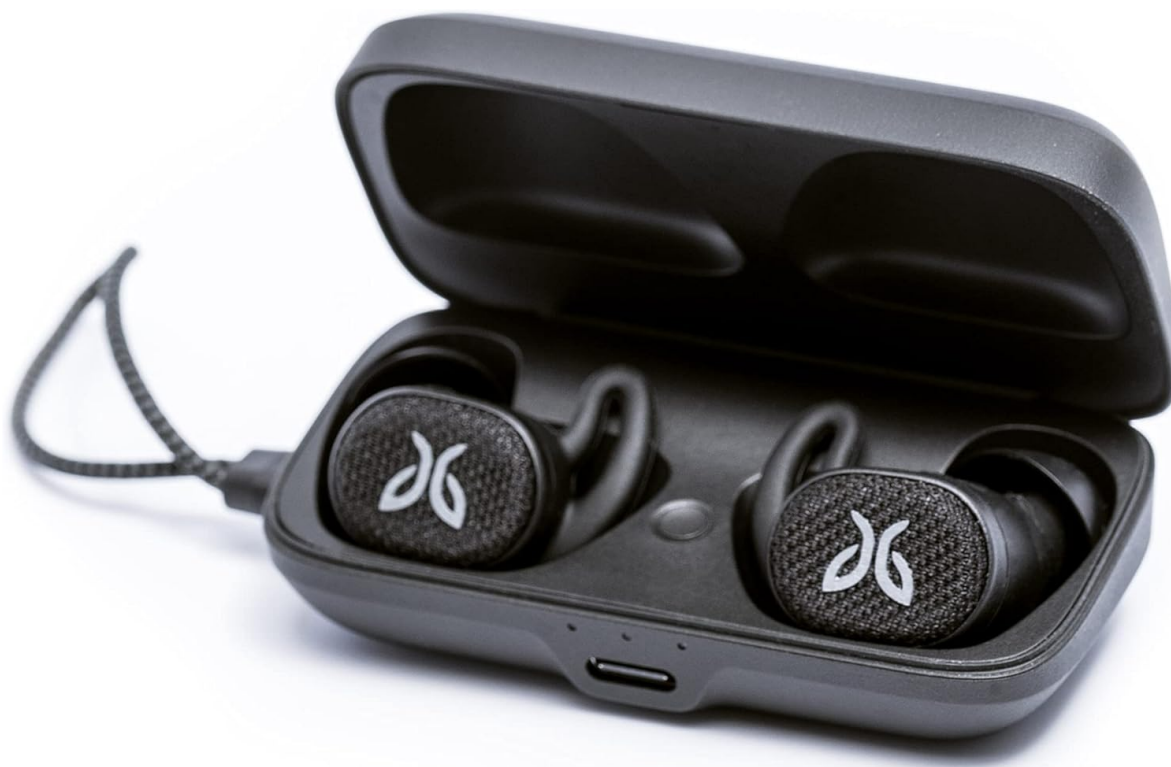
Image: Jaybird Vista 2 headphones resting in their open black charging case, showcasing their compact design.

The Jaybird Vista 2 True Wireless Bluetooth Headphones are designed for active lifestyles, offering premium sound, active noise cancellation, and robust durability. This manual provides essential information for setting up, operating, and maintaining your headphones.