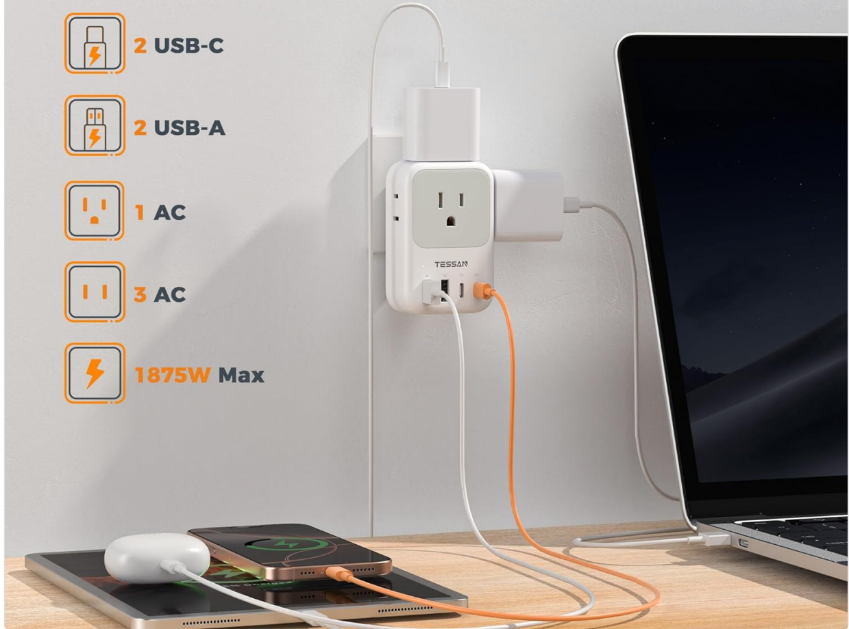
Figure 4: The foldable plug design ensures easy setup and portability.