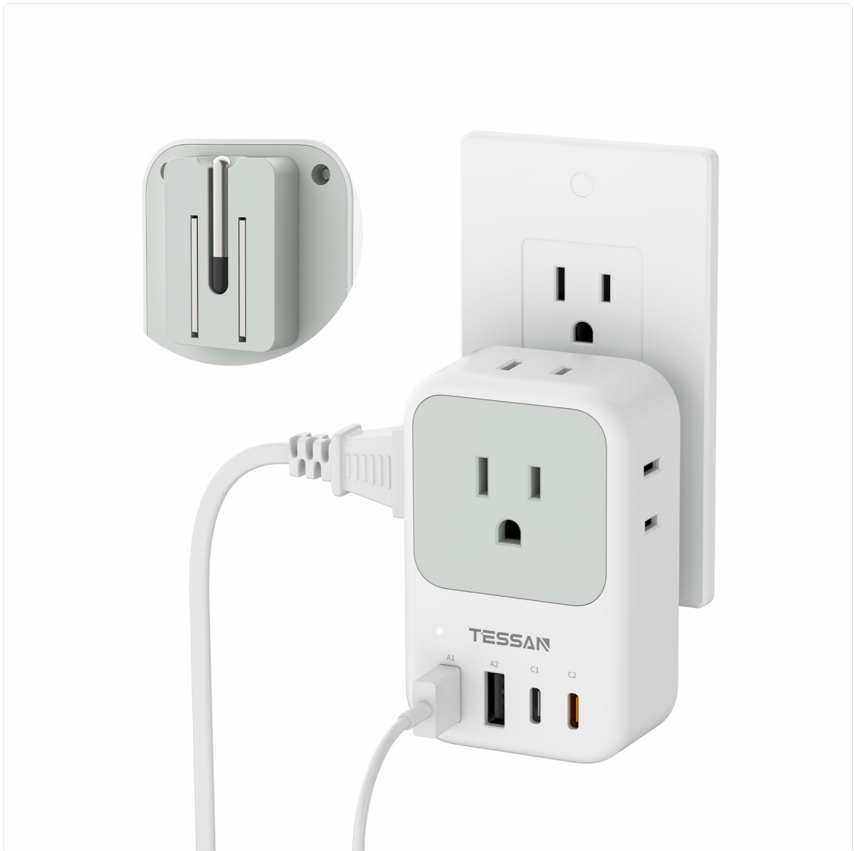
Figure 1: TESSAN TS-WS06US00 8-in-1 USB C Charger Block and Power Outlet Extender.