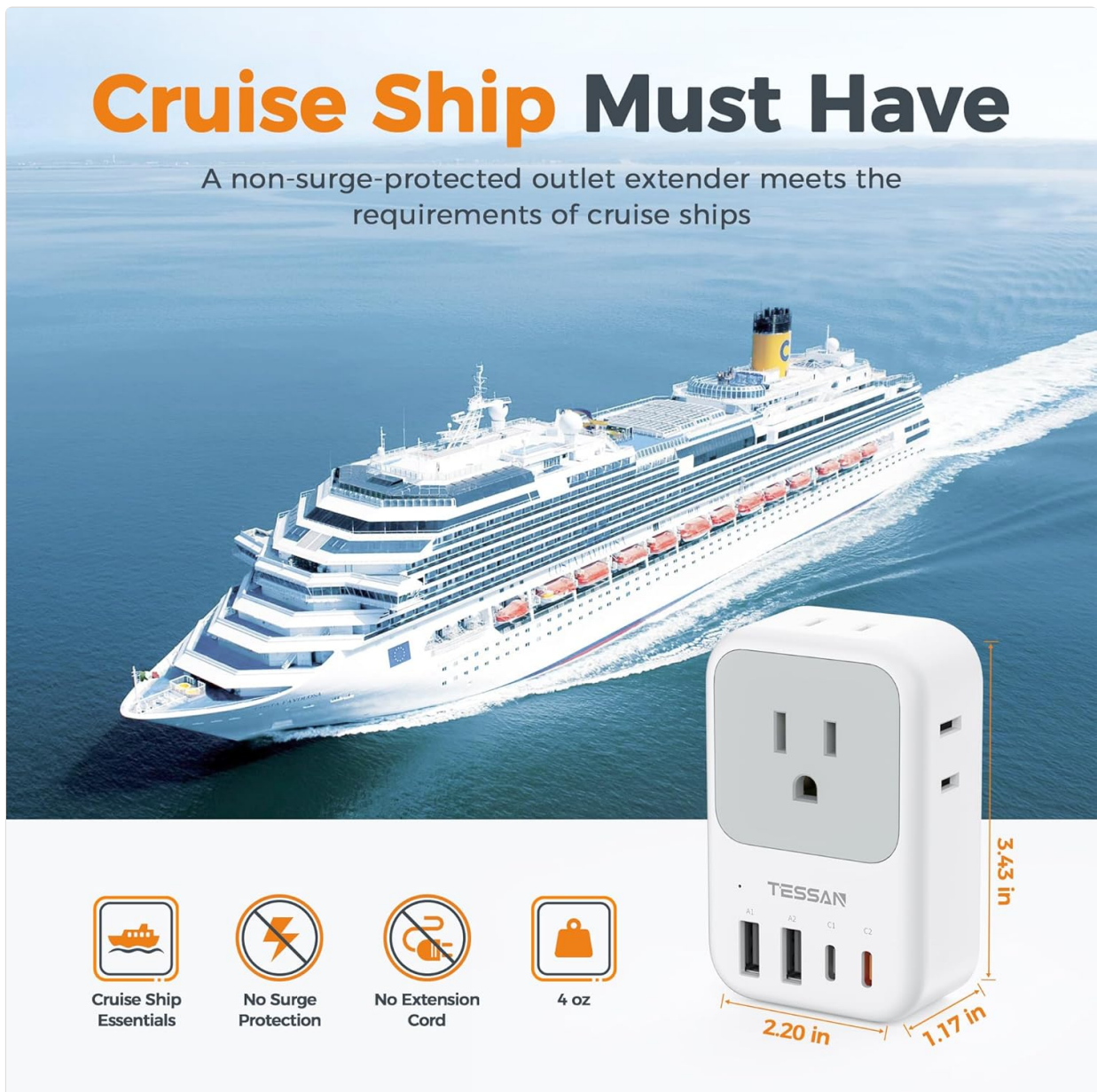
Figure 6: The TESSAN extender is a suitable travel companion, especially for cruises.