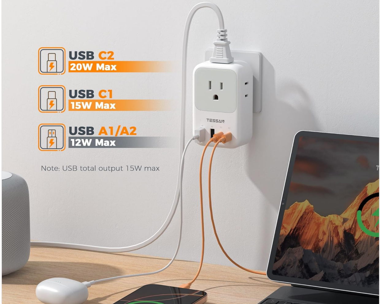
Figure 2: TESSAN 8-in-1 Extender illustrating PD 20W Fast Charging capabilities for USB-C and 12W for USB-A ports.