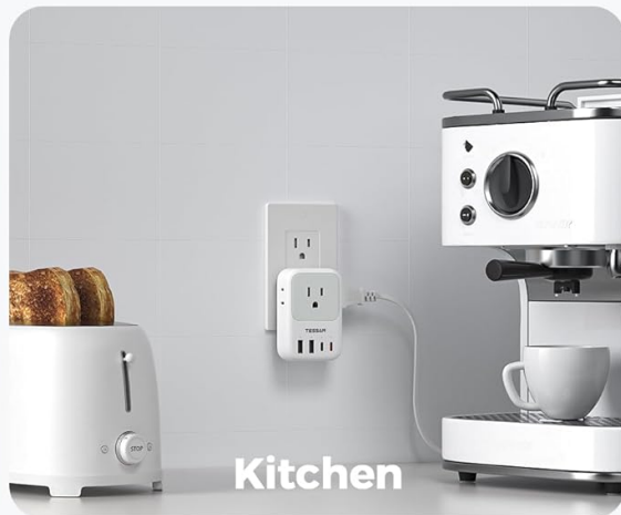
Figure 7: The TESSAN extender is versatile for use in various environments like bedrooms, offices, living rooms, and kitchens.