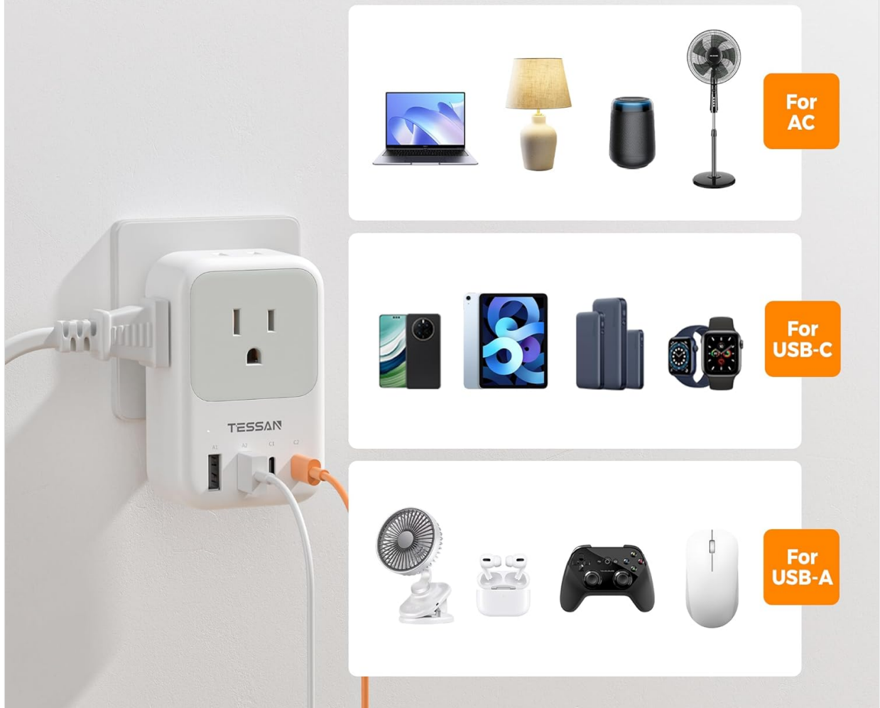
Figure 5: The 4-sided design allows multiple devices to be plugged in without interference.