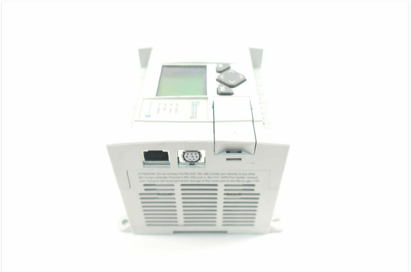
Figure 3.2: Rear view of the MicroLogix 1100 Controller Module, displaying the communication ports and a critical warning label regarding port connections.