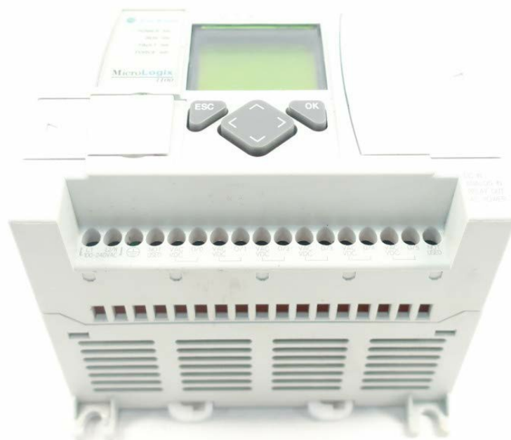
Figure 2.2: Top view of the MicroLogix 1100 Controller Module, highlighting the input and output terminal blocks for wiring connections.