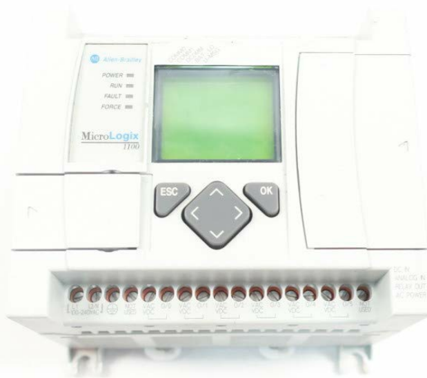
Figure 2.1: Front view of the MicroLogix 1100 Controller Module, showing the LCD display, navigation buttons, and terminal blocks.