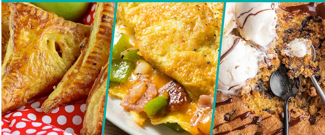
Figure 4: Examples of diverse meals that can be prepared with the unit.

MAKE MORE THAN SANDWICHES! COOK FRENCH TOAST, DESSERT PIES, OMELETS & EVEN COOKIES