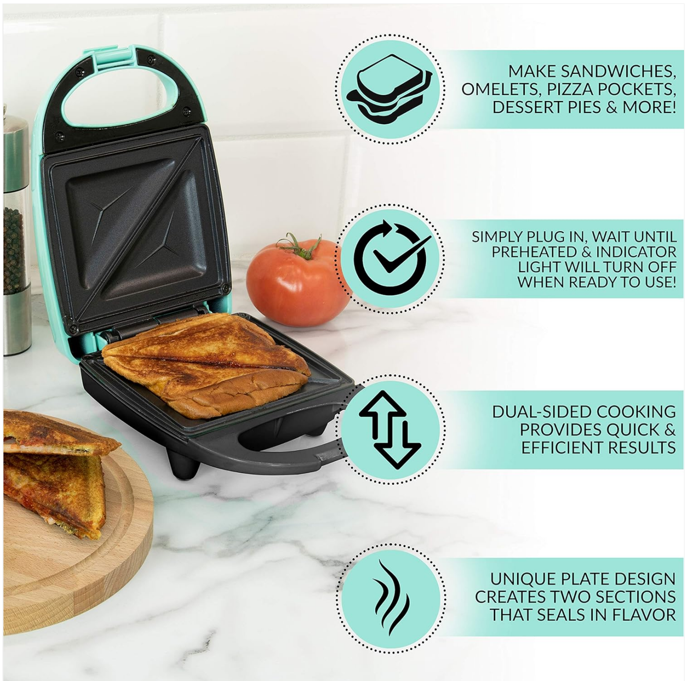
Figure 2: Key features of the sandwich maker, including dual-sided cooking and flavor sealing.