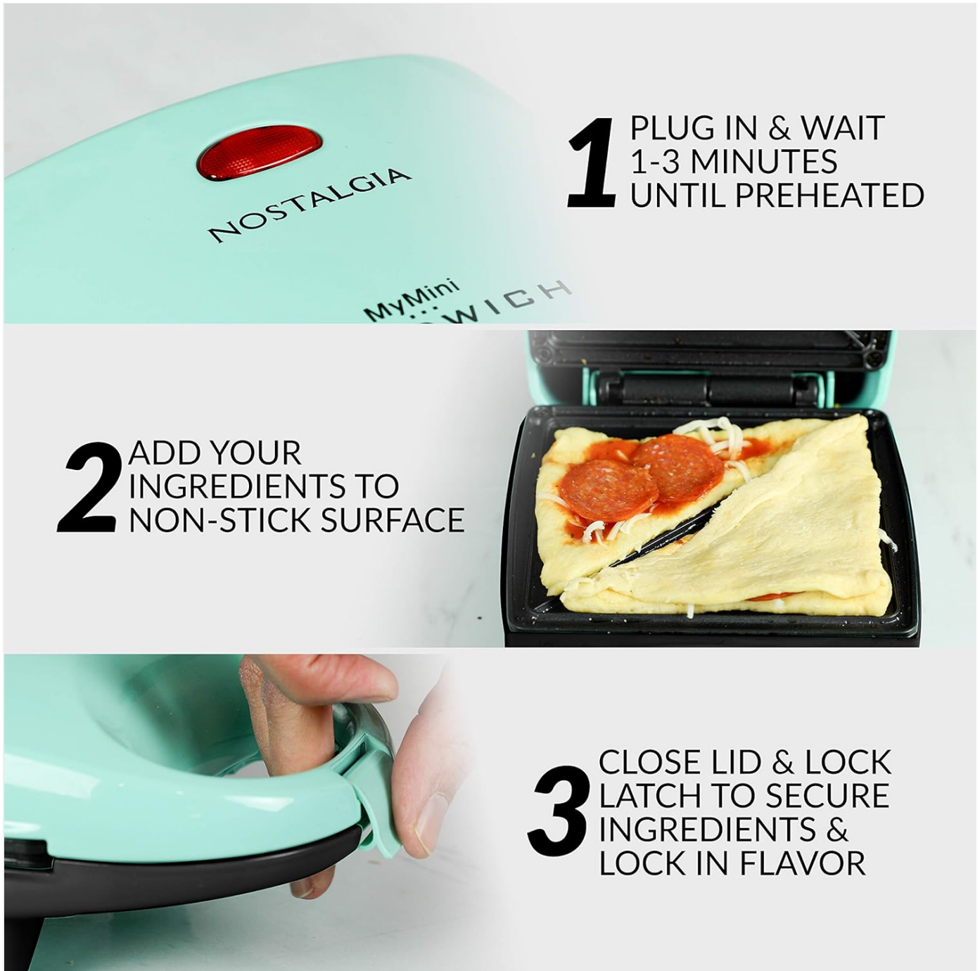
Figure 3: Simple 3-step process for cooking with the sandwich maker.