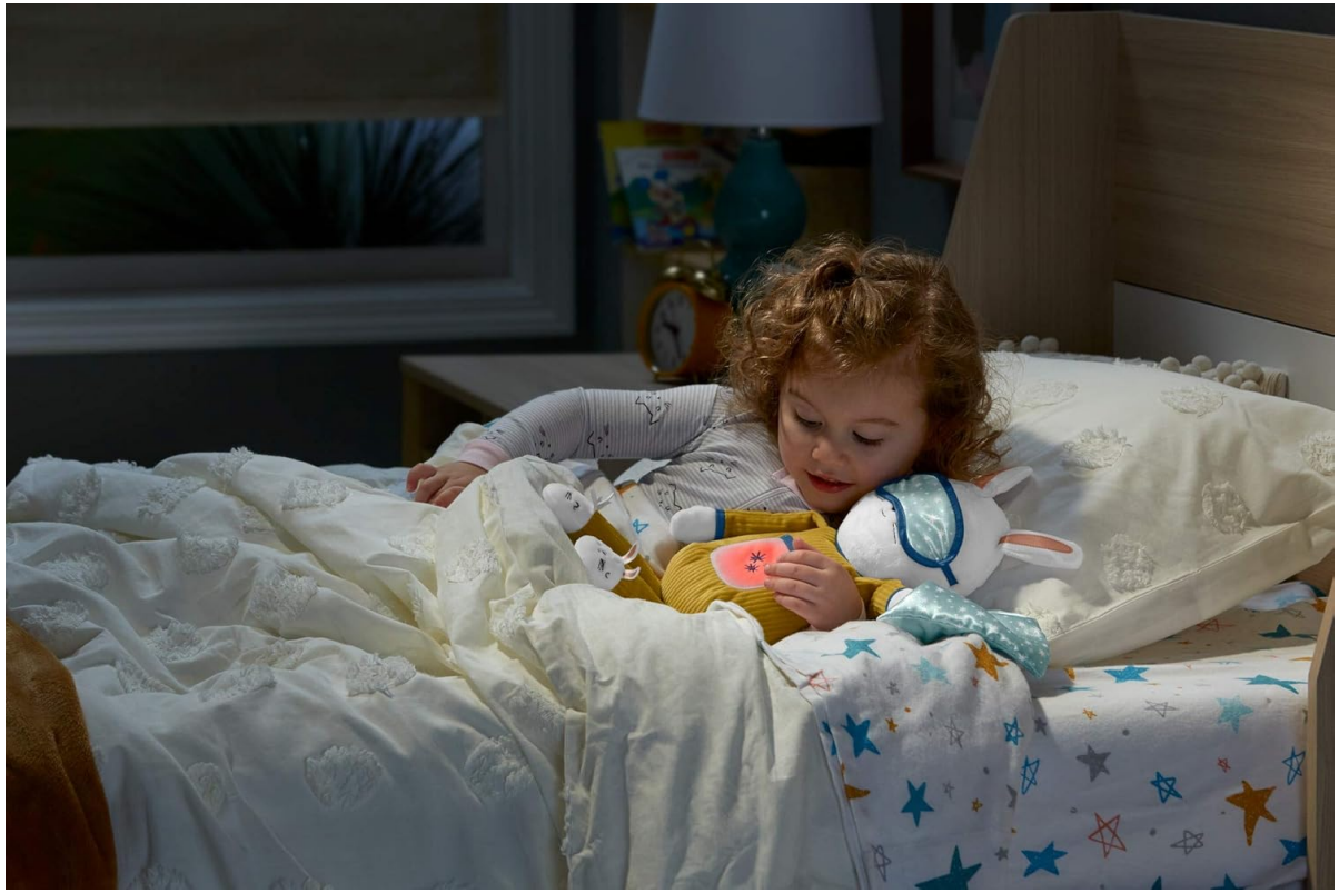
Figure 5.1: A toddler interacting with the Hoppy Dreams Soother in bed, demonstrating the light-up belly feature that aids in sleep training.