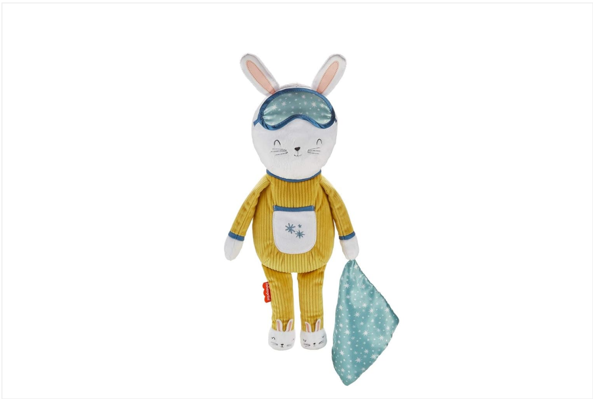
Figure 2.1: The Fisher-Price Hoppy Dreams Soother and Sleep Trainer plush bunny. This image displays the full product, a white bunny wearing a blue sleep mask and yellow pajamas, holding a small blue blanket with white stars.