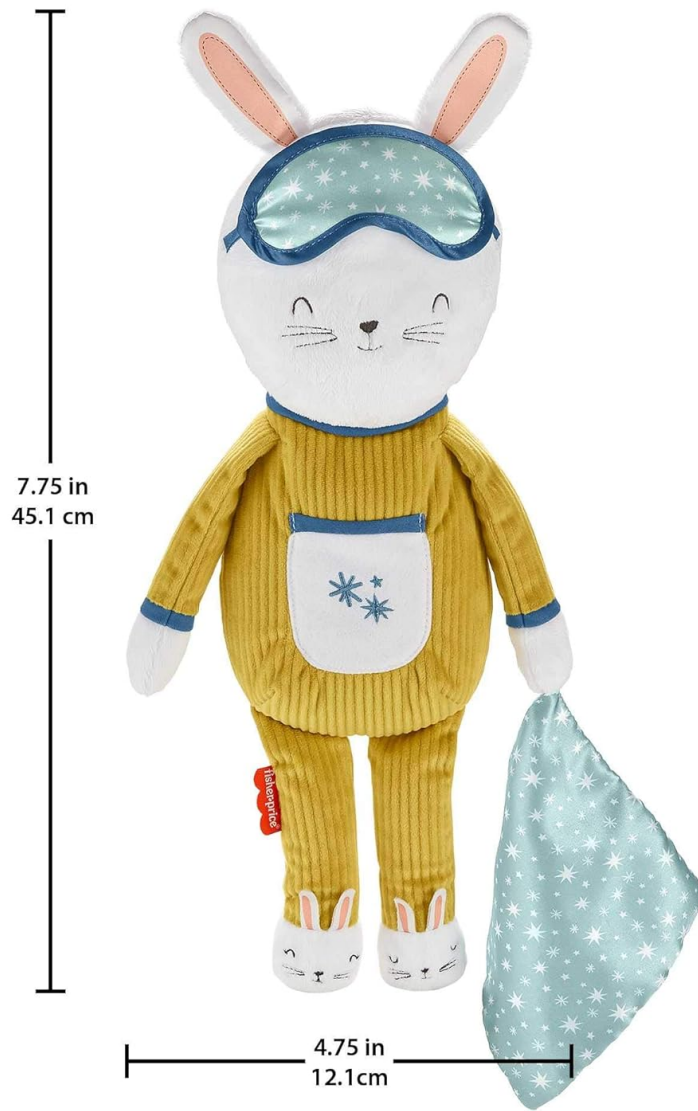
Figure 9.1: The Hoppy Dreams Soother with its approximate dimensions labeled for reference.