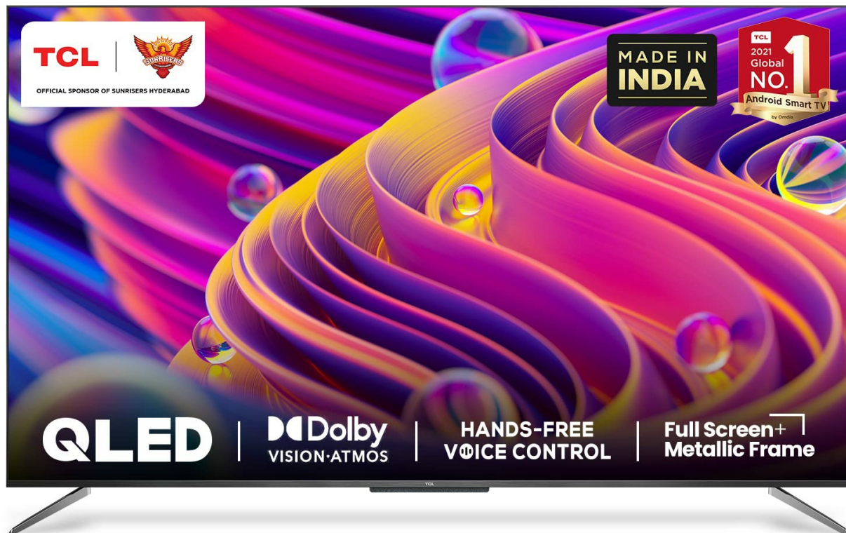
Image: The TCL 55C715 TV displaying the Android TV interface with apps like Netflix, YouTube, and Prime Video, highlighting its smart capabilities.

This manual provides essential information for setting up, operating, and maintaining your TCL 55C715 55-inch 4K Ultra HD Certified Android Smart QLED TV. Please read it thoroughly to ensure proper usage and to maximize your viewing experience. This television combines advanced QLED display technology with the versatility of Android TV, offering stunning visuals and smart features.