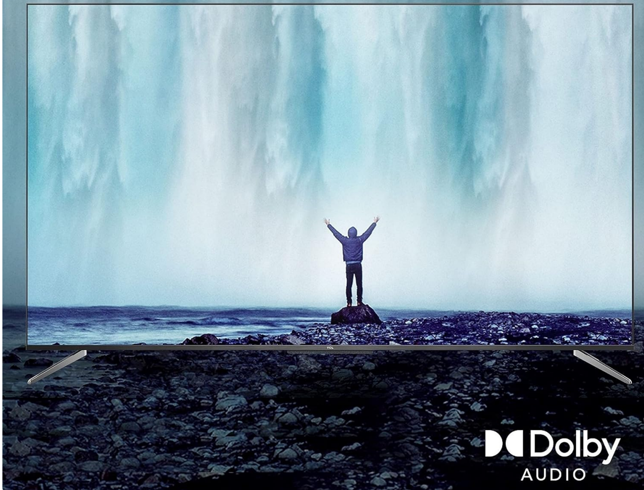
Image: A split-screen comparison on the TCL 55C715, illustrating the enhanced color saturation and vibrancy of QLED technology compared to conventional displays.

Text Description of Video: This video provides a performance review of the TCL C715 4K UHD Smart QLED TV. It demonstrates the TV's picture quality with various content, including 4K, HDR, and SDR. The video highlights support for Dolby Vision, HDR10, HDR10+, and HLG, showcasing vibrant colors and good contrast. It also touches upon gaming performance and sound quality.