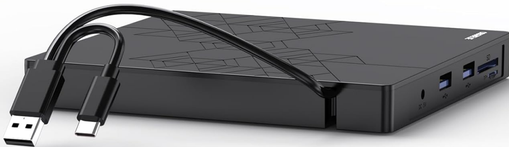
Figure 6: Wide compatibility across different operating systems.