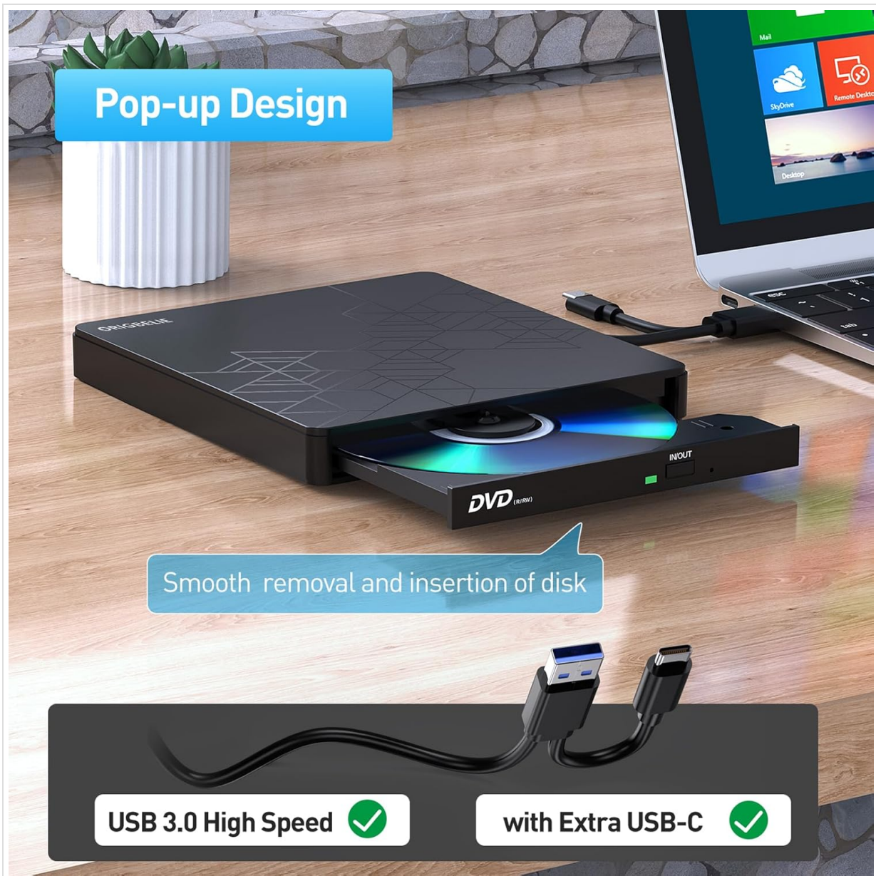
Figure 4: The pop-up disc tray design for smooth insertion and removal.