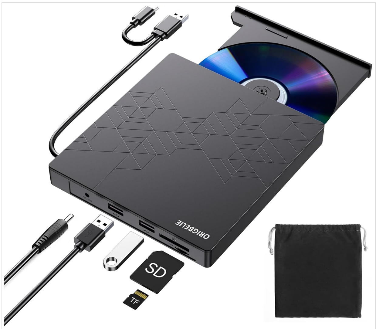
Figure 1: The ORIGBELIE External DVD Drive, showcasing its compact design and included accessories.