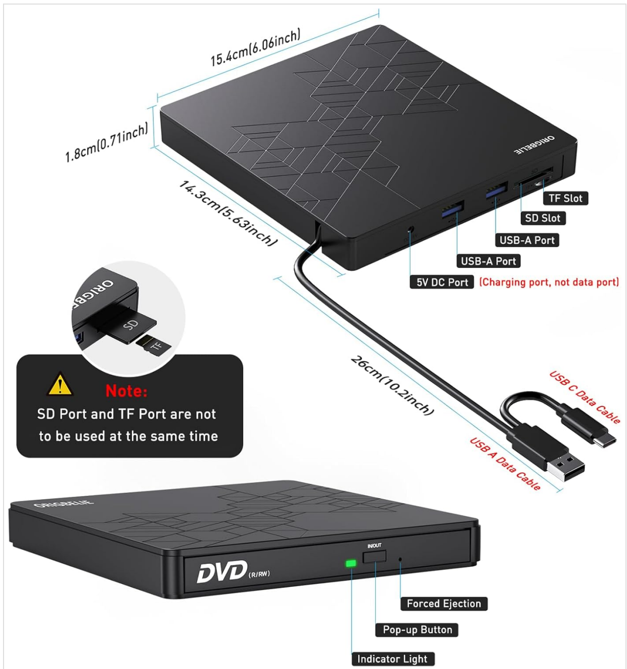
Figure 5: Detailed view of the multi-functional ports on the drive.