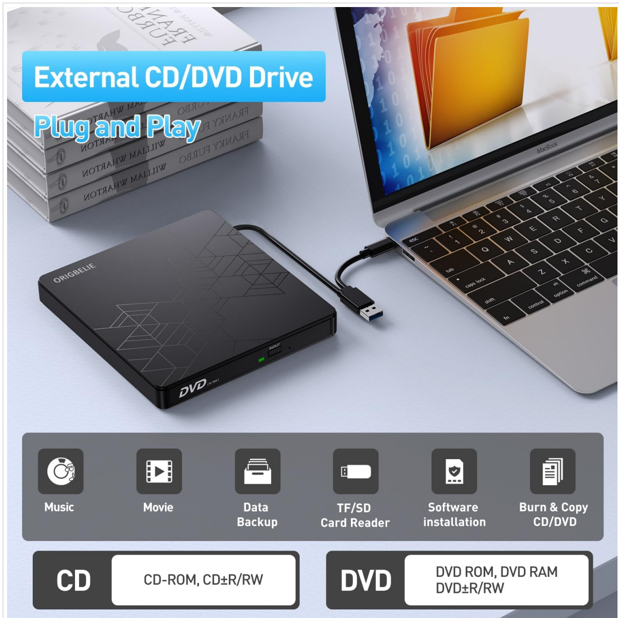
Figure 3: Connecting the external DVD drive to a laptop.