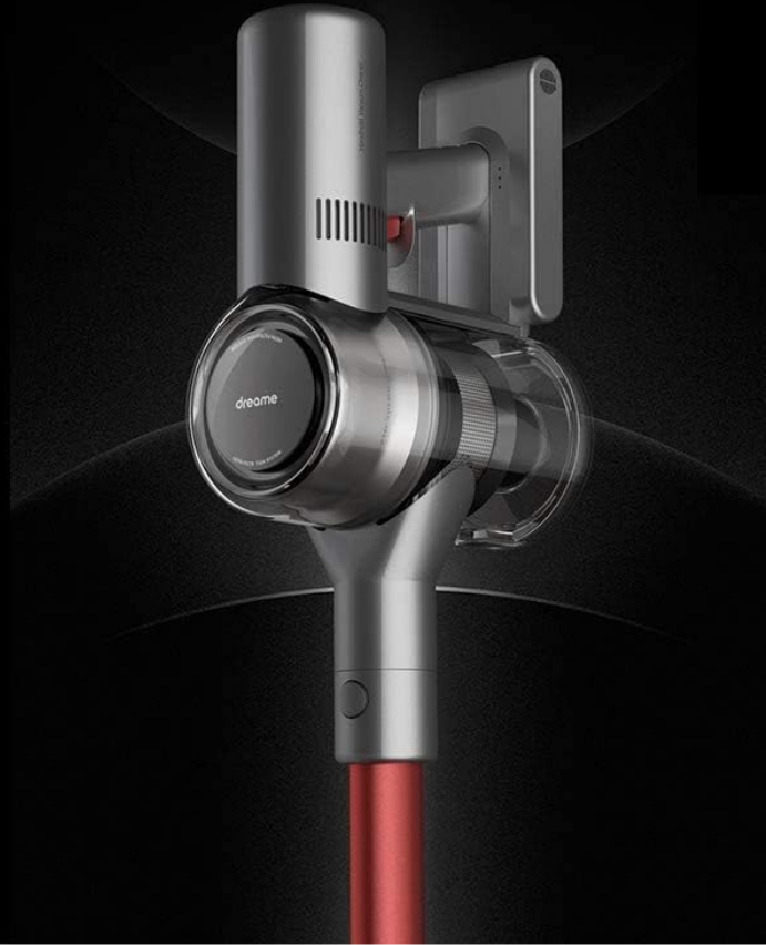
Figure 8.1: Motor and Design Specifications

Making 125,000rpm1 Affordable for Everyone