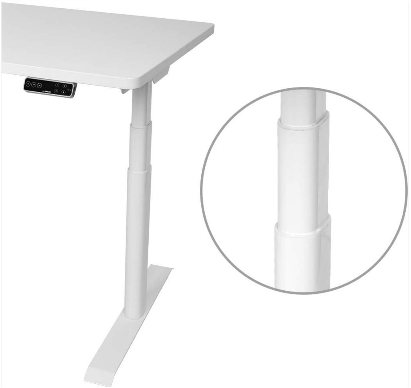
Image: The SANODESK E8W Electric Sit-Stand Desk fully assembled in a home office environment.