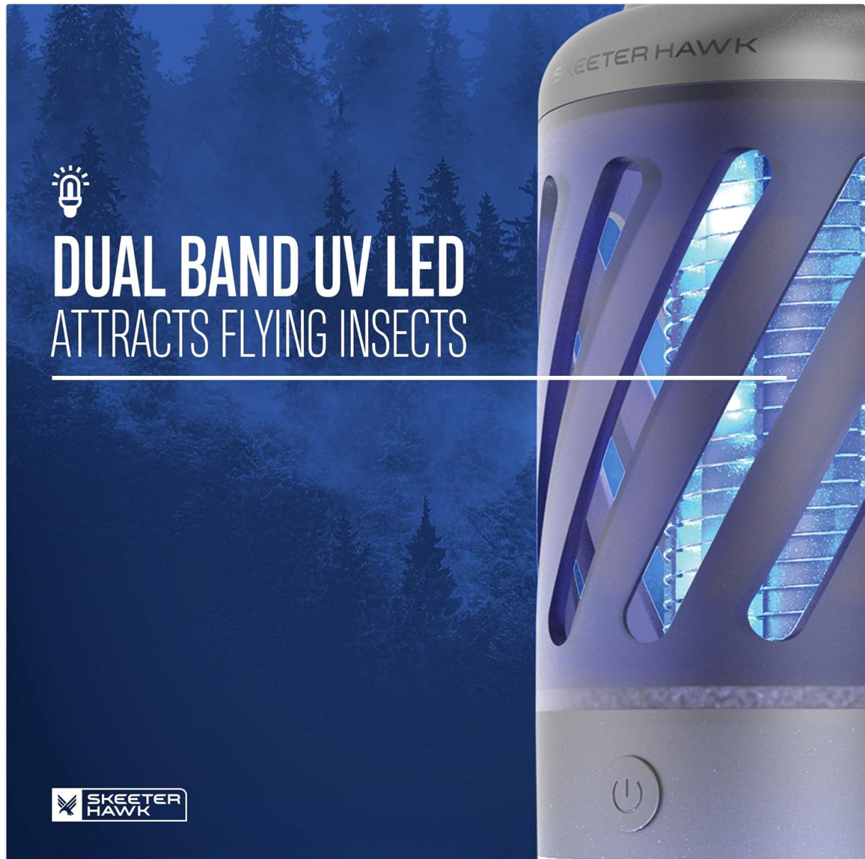
Image: Illustration of the Dual Band UV LED technology used in the SKEETER HAWK zapper to attract insects.