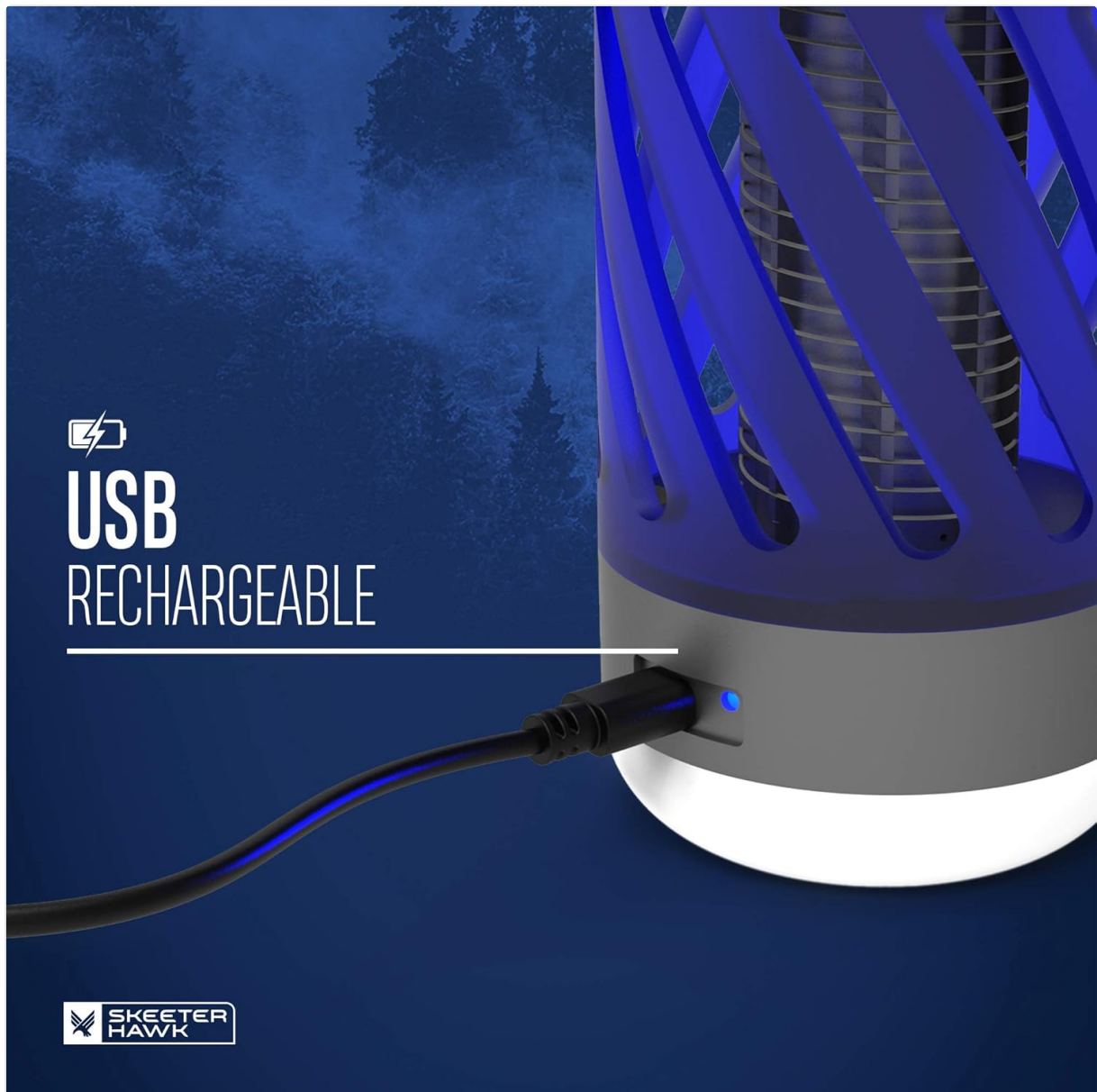
Image: The USB charging port of the SKEETER HAWK Personal Mosquito Zapper, indicating charging status with a blue light.