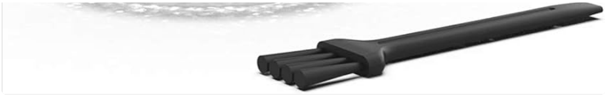
Image: The SKEETER HAWK Personal Mosquito Zapper and Lantern, shown with its included cleaning brush and USB charging cable.