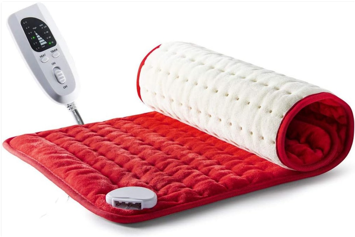
Image: The Medical King Electric Heating Pad, rolled up, with its detachable controller and power cord visible.