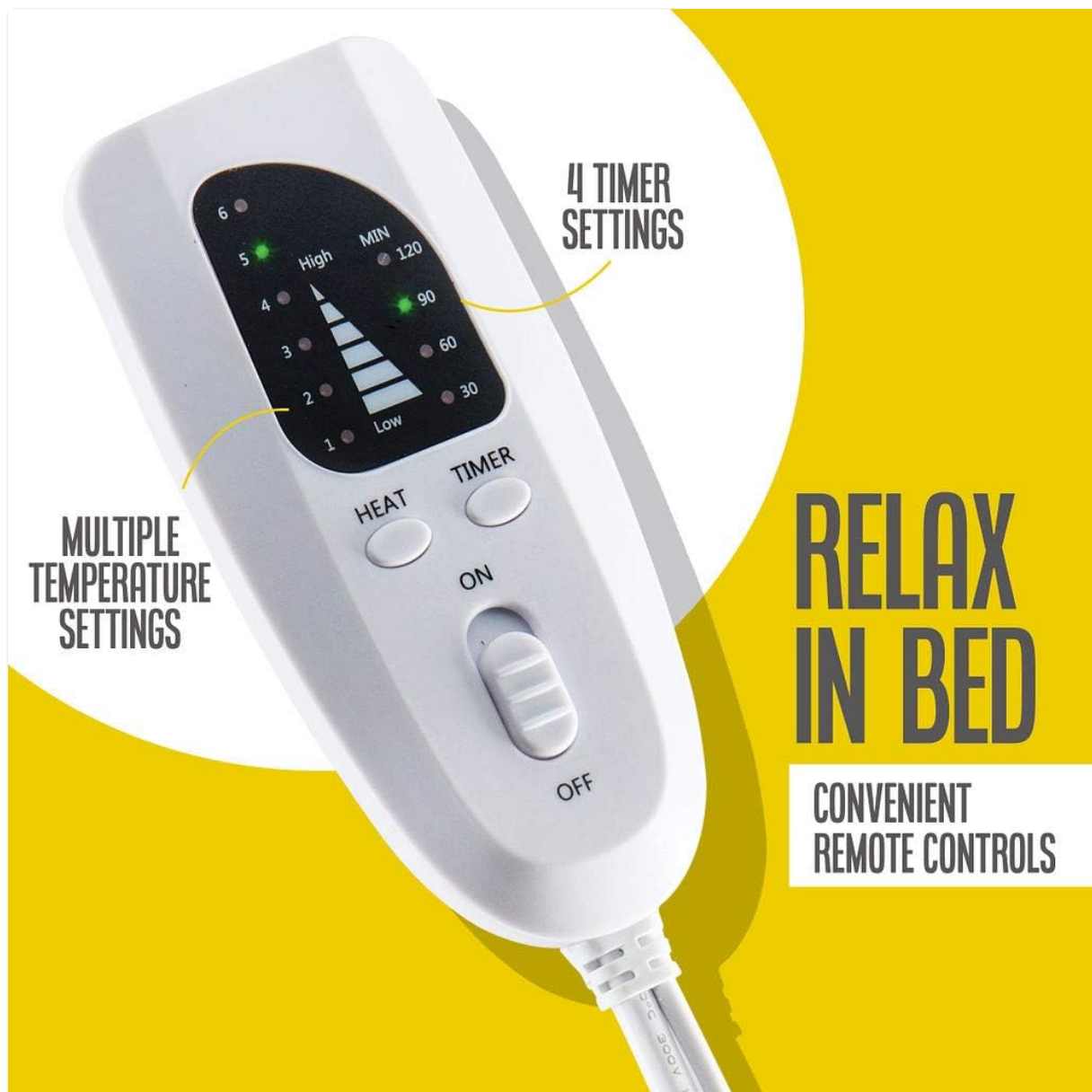
Image: Close-up of the heating pad's controller, highlighting the heat and timer buttons, and the display for 6 temperature settings and 4 timer options (30, 60, 90, 120 minutes).

Your browser does not support the video tag.