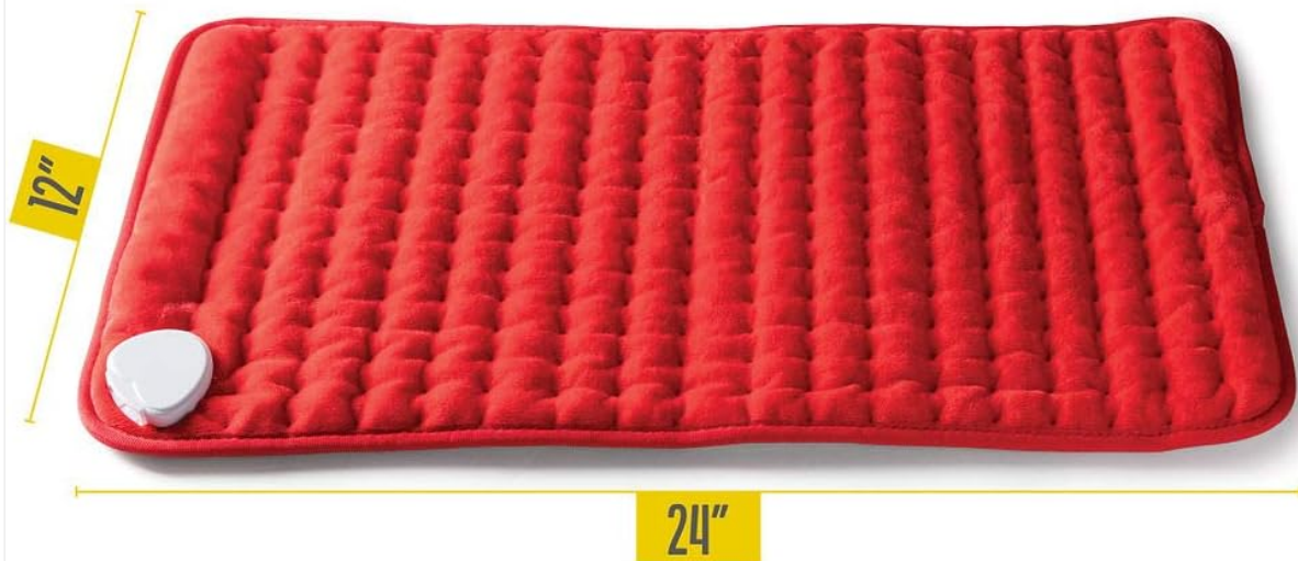
Image: The Medical King Electric Heating Pad displaying its dimensions of 24 inches in length and 12 inches in width.