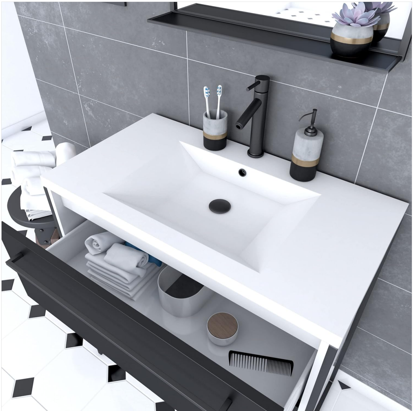
Image: The AURLANE PACM023 bathroom furniture fully assembled and installed, showcasing the white basin, matt black drawers, and mirror with a shelf. Accessories are shown for illustrative purposes.