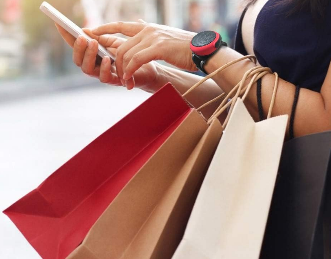
Image: The ANCwear TWS-BT208T speaker and its included accessories, such as the wristband, clip, and charging cable.