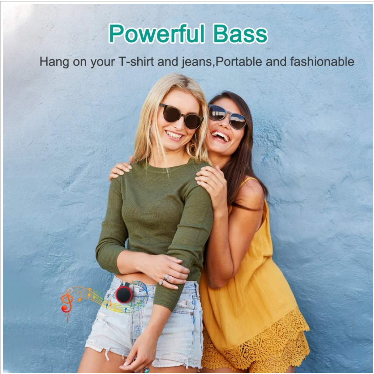
Image: The ANCwear TWS-BT208T speaker clipped to clothing, offering hands-free audio.

Hang on your T-shirt and jeans, Portable and fashionable