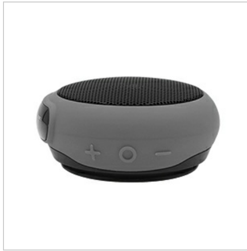
Image: The Type-C charging port on the side of the ANCwear TWS-BT208T speaker.