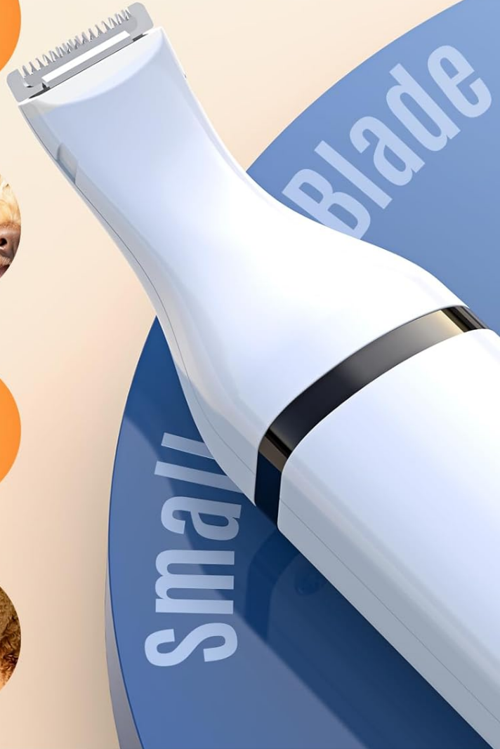
Image: The trimmer is perfect for small areas like face, ears, paws, and rump.