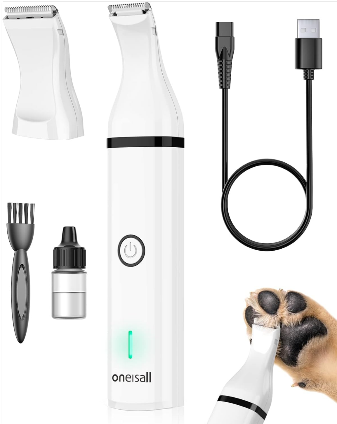
Image: The trimmer and its two distinct blade attachments.