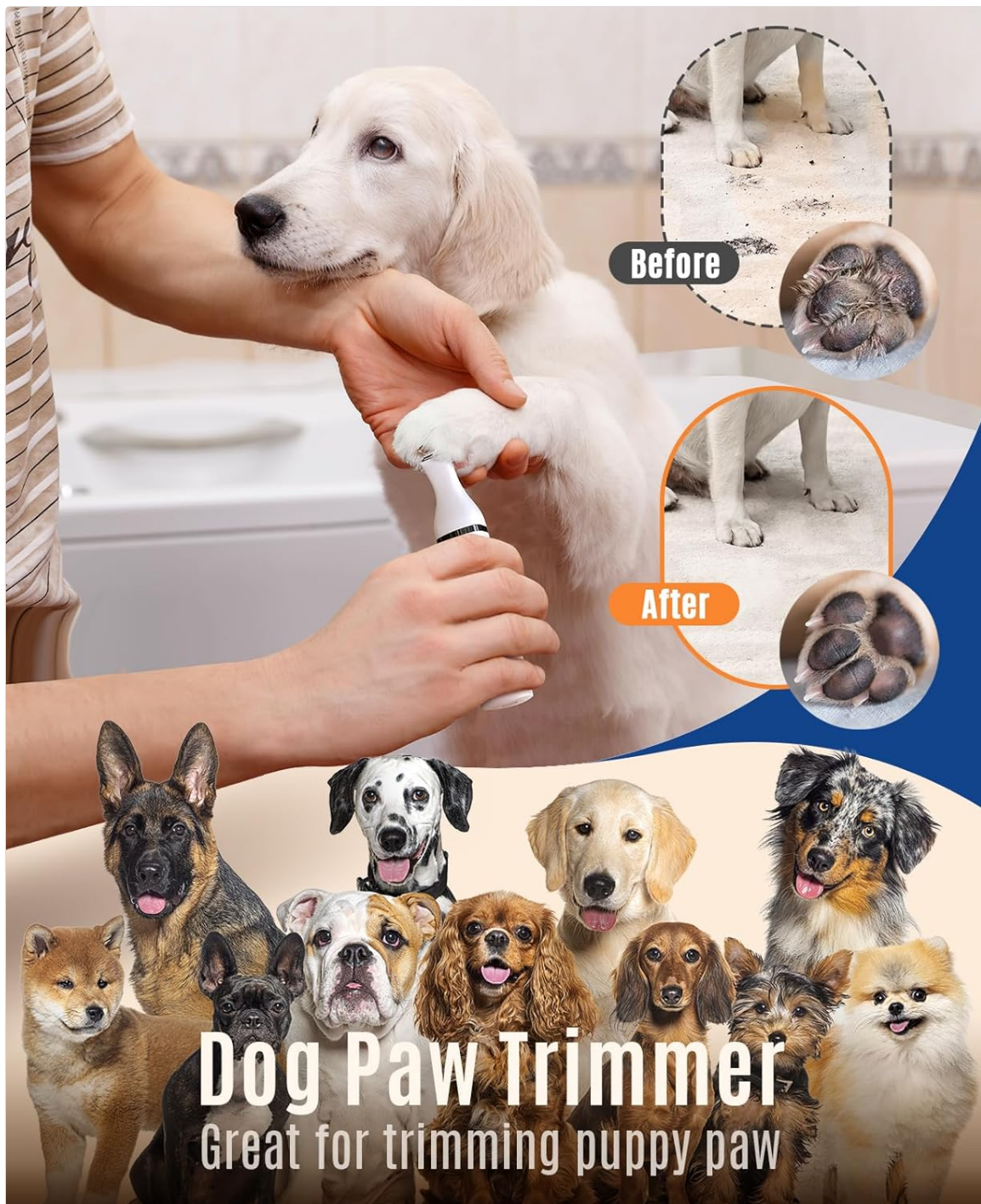
Image: The oneisall trimmer is great for trimming puppy paws, suitable for all dog breeds.