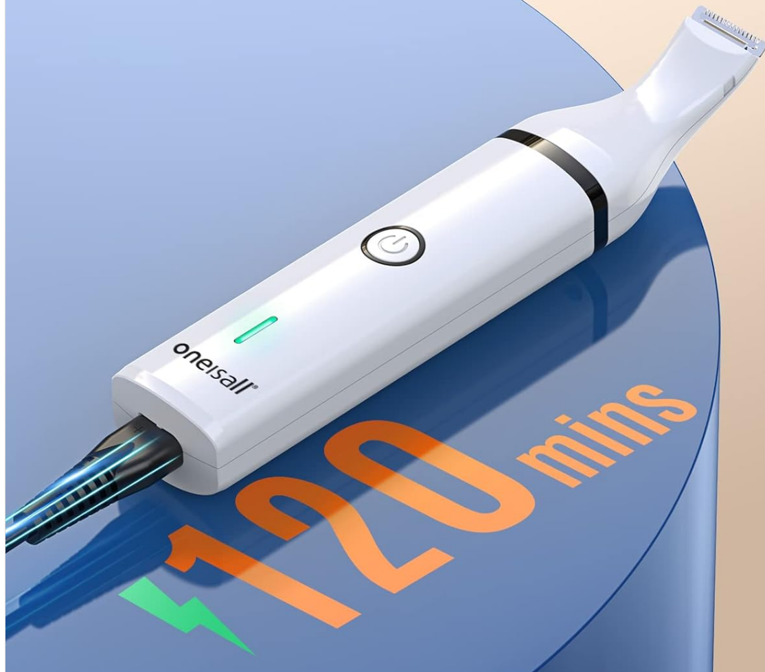
Image: The trimmer being charged via USB, illustrating its 120-minute run time and charging time.