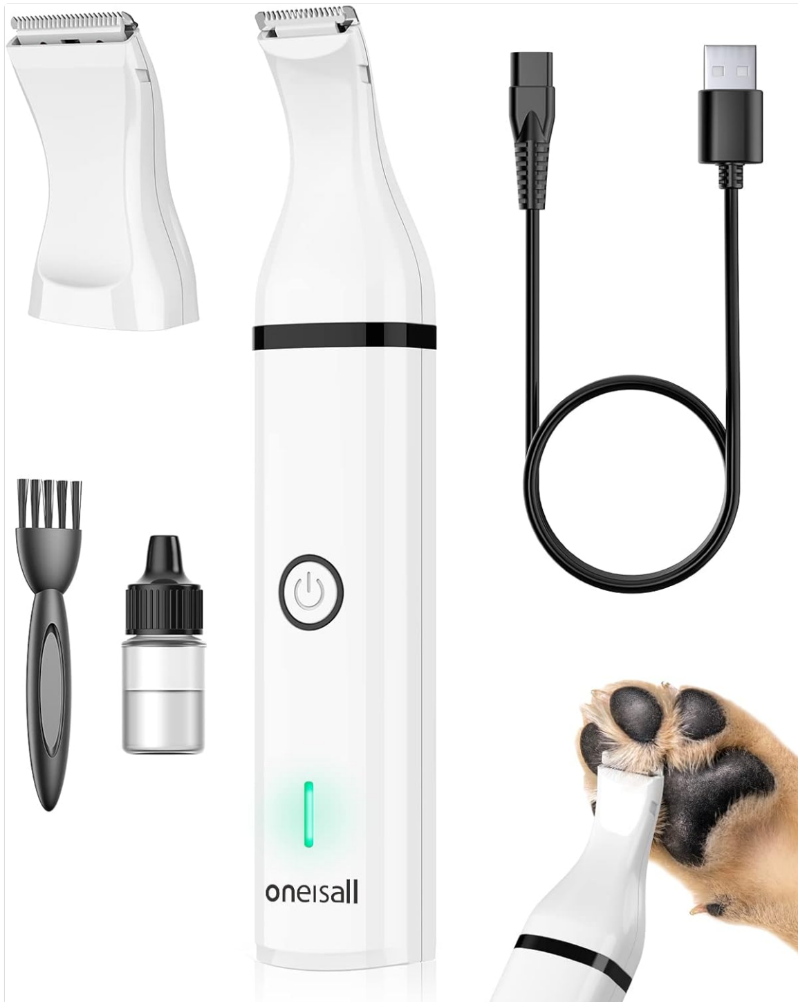
Image: The complete onesall Pet Paw Trimmer kit with all included accessories.