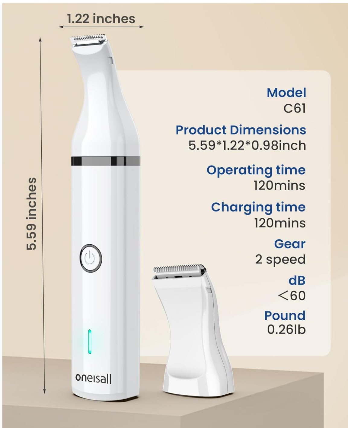
Image: The quiet paw clippers won't scare your dog, operating at less than 60dB.