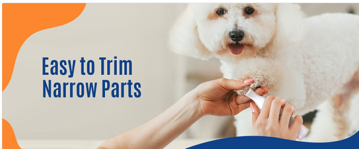
Image: Demonstrating the two-speed adjustable motor of the trimmer.

Press the power button to turn the trimmer on. The trimmer offers two adjustable speeds (5000 rpm and 5700 rpm) for different hair types and grooming needs. Press the power button again to cycle through speeds or turn off.