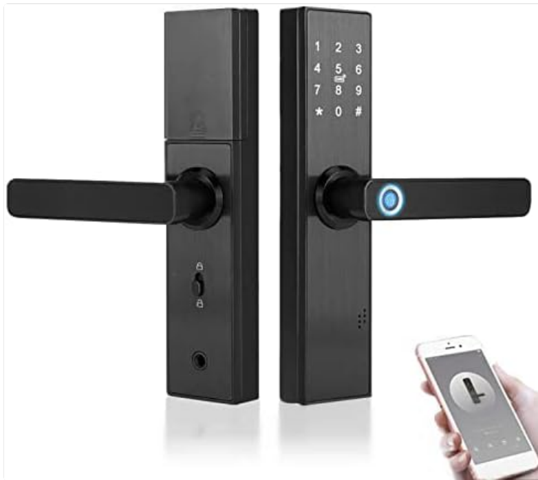
Image: The Dioche DW80 Smart Lock, showcasing its sleek black design with a keypad on the front panel and a fingerprint sensor integrated into the handle.