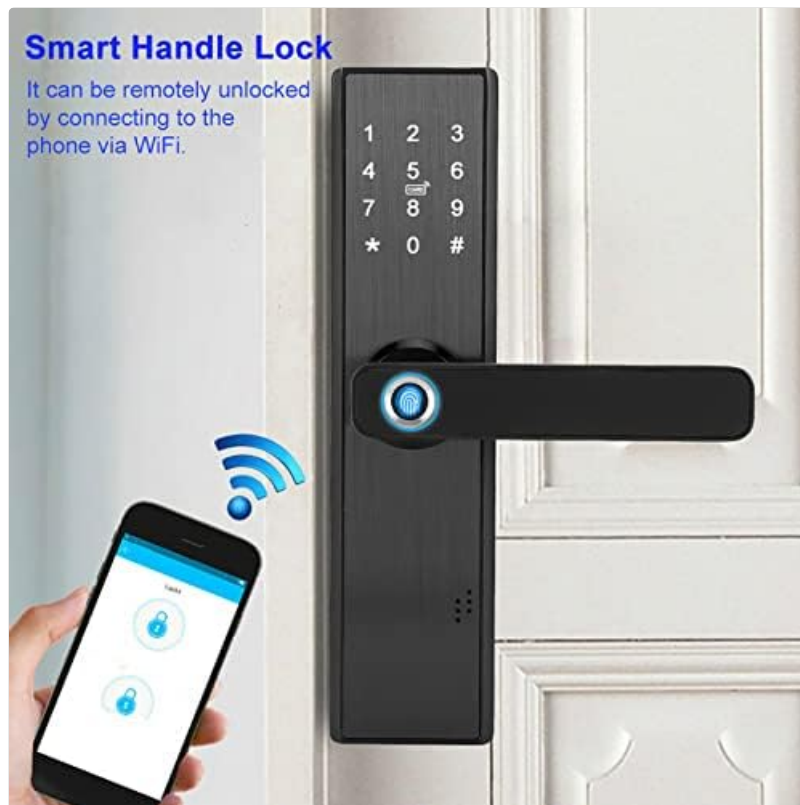
Image: A smartphone screen showing the Tuya Smart app, indicating a successful remote unlock command sent to the smart handle lock via Wi-Fi.