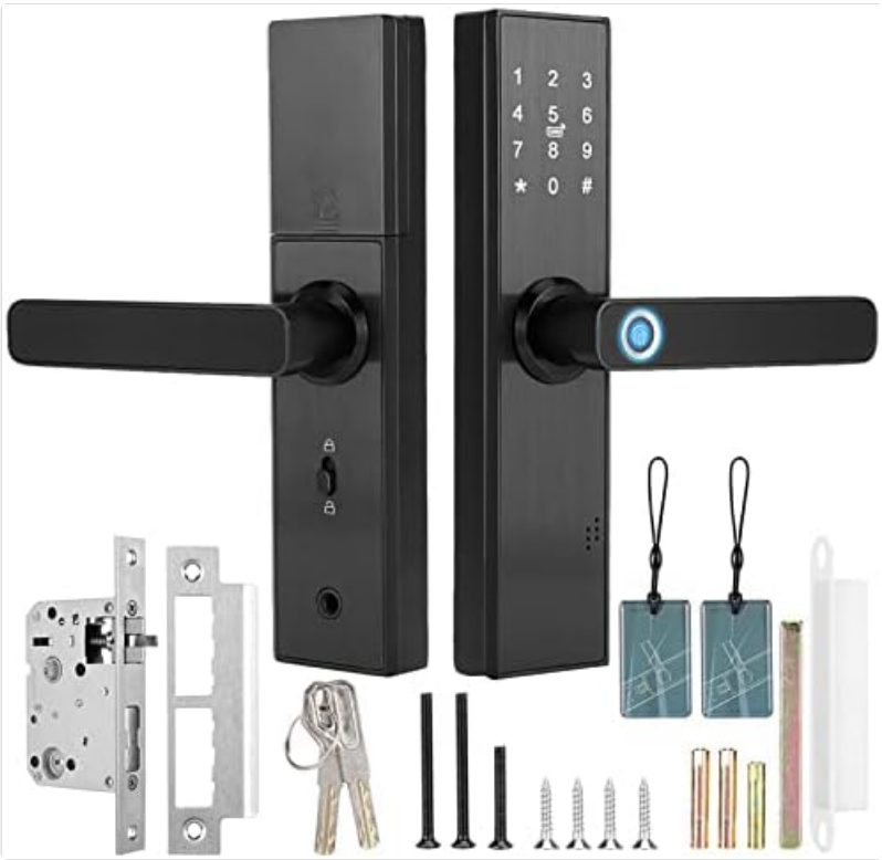
Image: Dioche DW80 Smart Lock package contents. Includes the main lock unit (front and rear panels), mortise, two mechanical keys, two IC cards, and various screws and pins for installation.