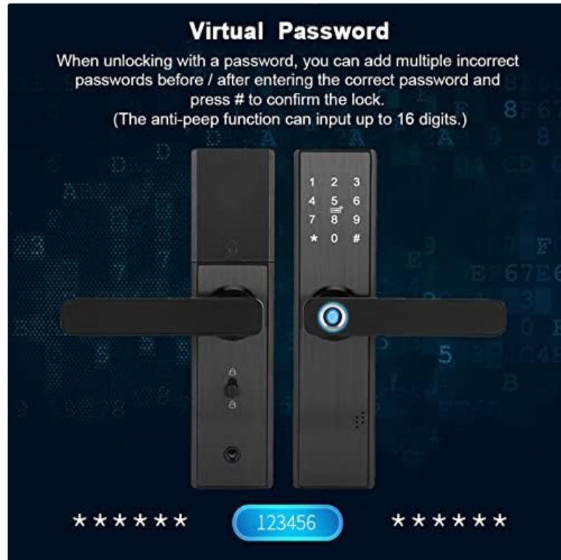
Image: Demonstration of the virtual password feature, where a correct 6-digit password is embedded within a longer sequence of random numbers to deter observation.