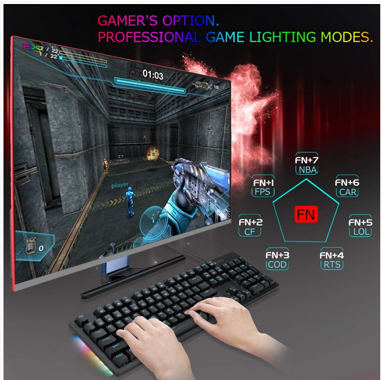
Image: The E-YOOSO K610 keyboard displaying various professional game lighting modes, activated by FN key combinations, with a gaming scene on a monitor in the background.