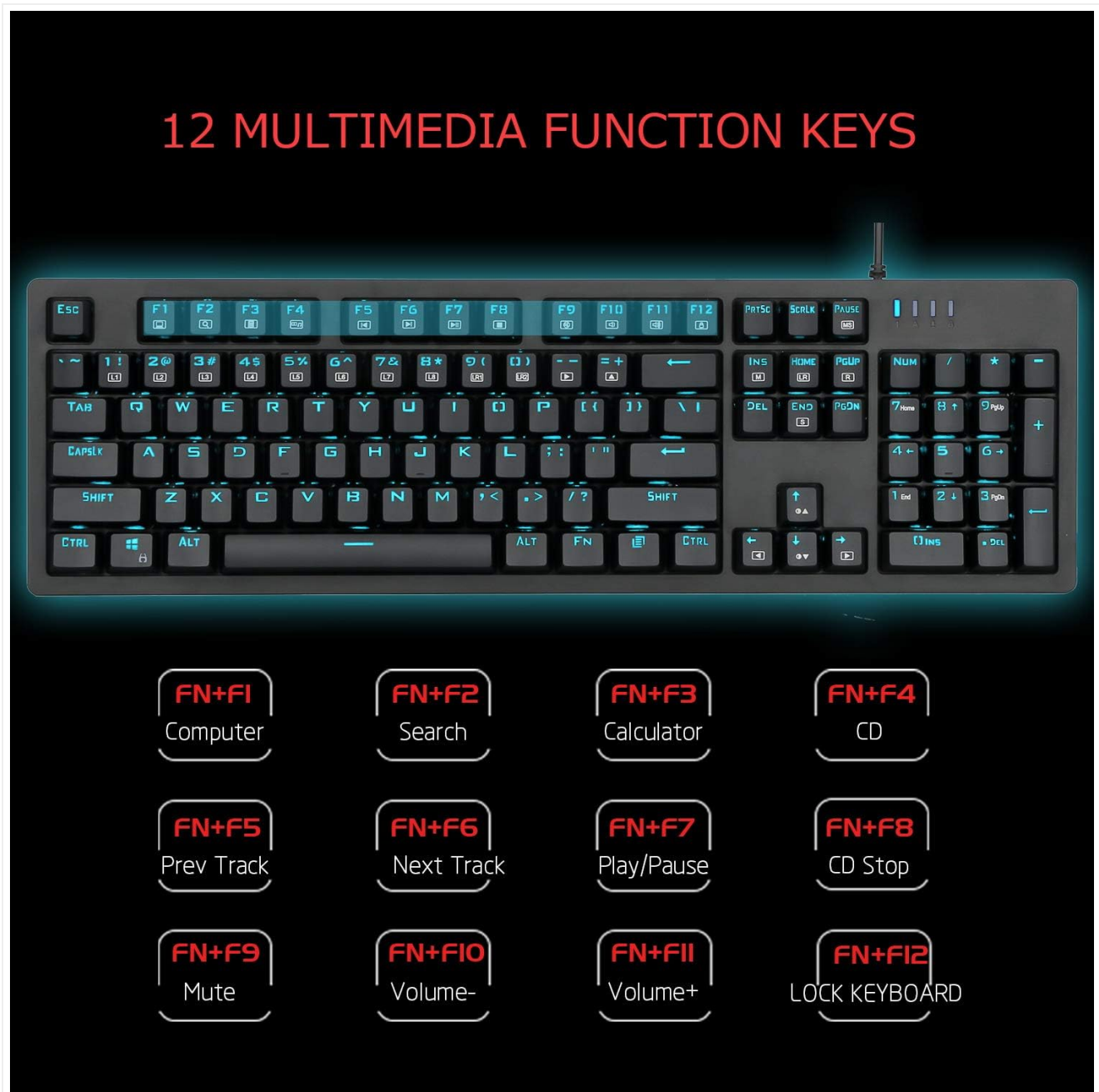
Image: The E-YOOSO K610 keyboard highlighting the 12 multimedia function keys (FN+F1 through FN+F12) and their respective icons for quick access to various controls.