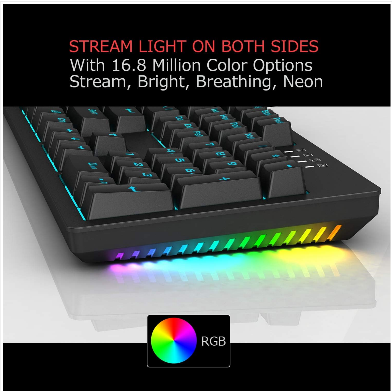
Image: A close-up view of the E-YOOSO K610 keyboard's side, illustrating the customizable RGB stream lighting with 16.8 million color options and various modes.