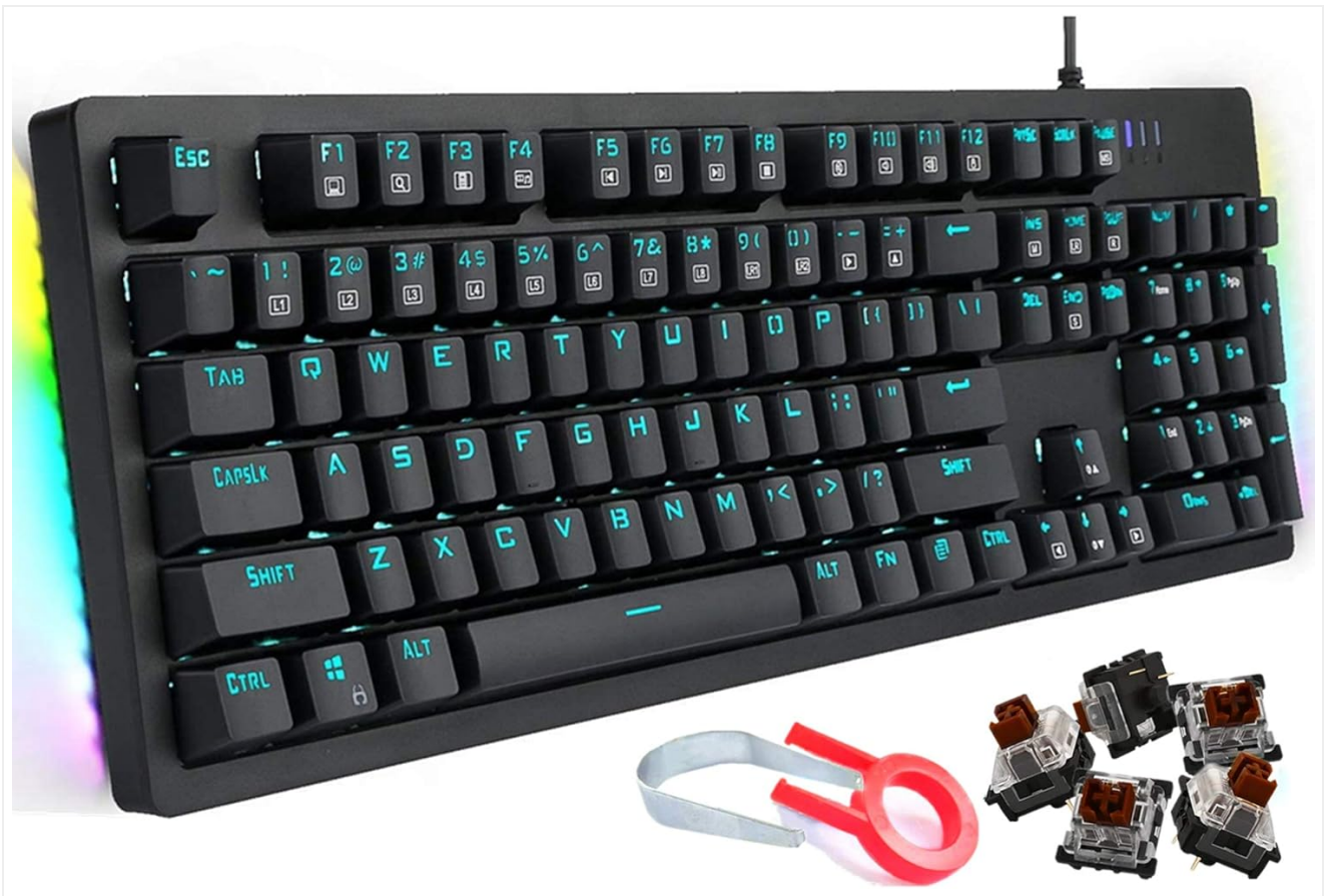
Image: The E-YOOSO K610 Mechanical Gaming Keyboard, showcasing its full layout, the included keycap puller, and several brown mechanical switches.