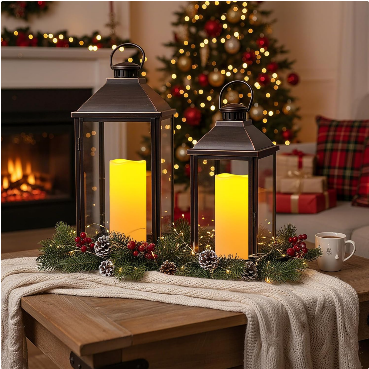
Figure 2: Flameless candles placed inside lanterns for outdoor ambiance.