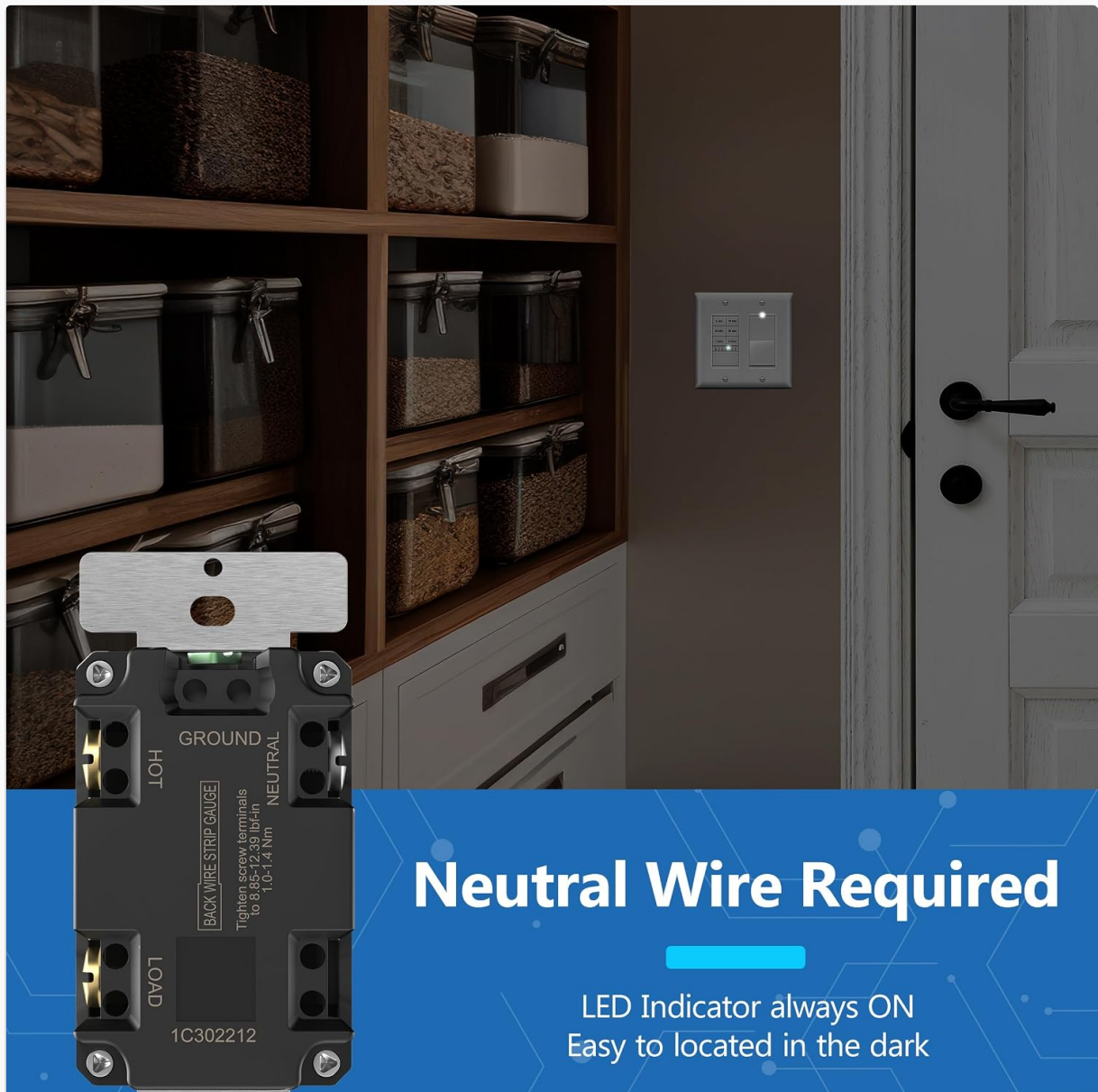
Image 4.1: Wiring diagram on the back of the LIDER LTS-2H switch, indicating connections for Hot, Ground, Load, and Neutral wires. A neutral wire is essential for installation.