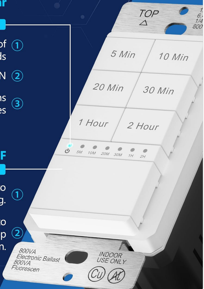
Image 5.1: Detailed view of the LIDER LTS-2H switch, highlighting the timer buttons, manual control, and LED indicator functionality.

Hold ON for 8 seconds to override the timer and keep the load on. ②