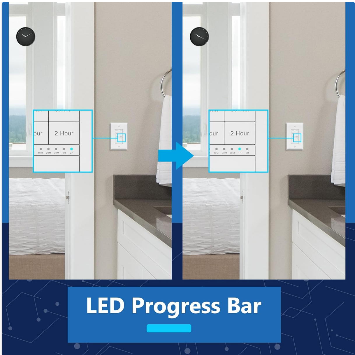
Image 5.2: Illustration of the LED indicator progress bar, demonstrating how the blue LEDs illuminate to show the active timer duration or setting confirmation.