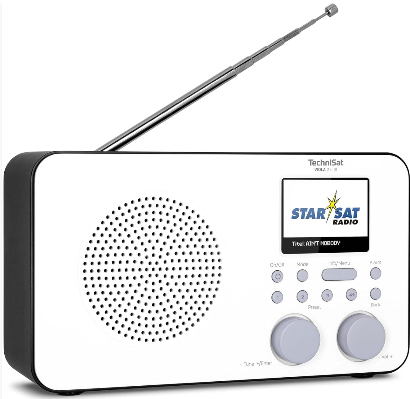
Figure 1: Front view of the TechniSat VIOLA 2 C IR radio, showing the speaker, color display, and control buttons.