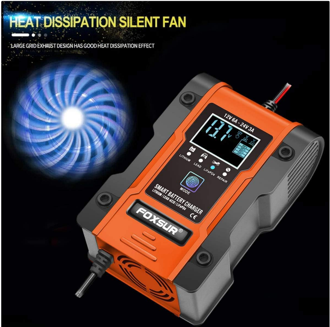
Image 3.1: The FOXSUR charger highlighting its heat dissipation silent fan, designed for efficient cooling.