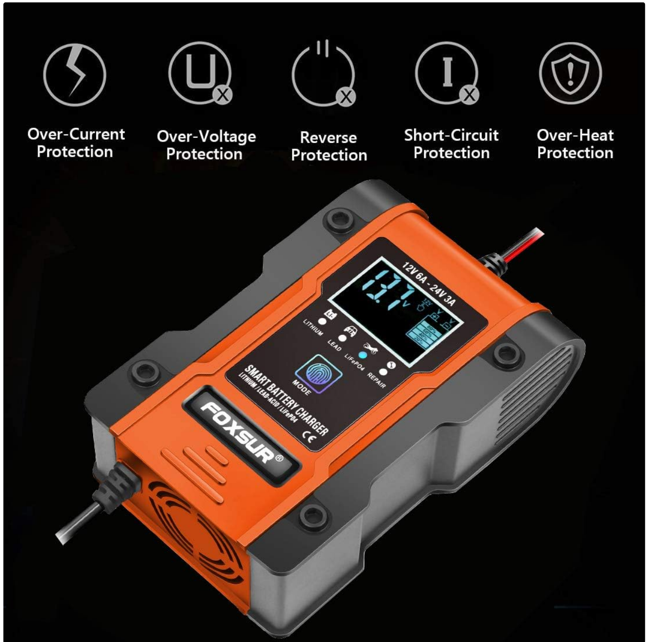
Image 2.1: Visual representation of the charger's multiple protection features, including over-current, over-voltage, reverse polarity, short-circuit, and over-heat protection.