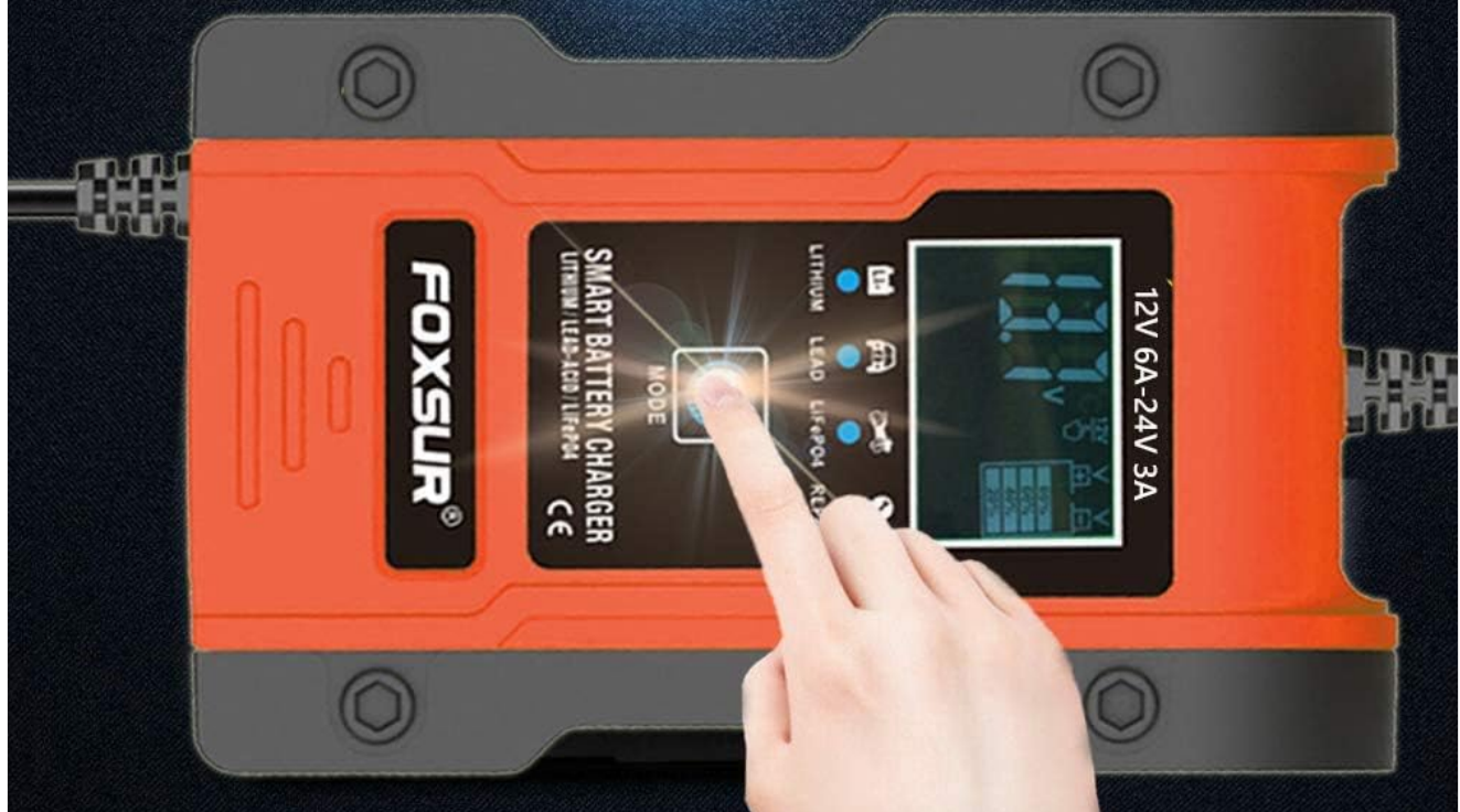
Image 5.1: The FOXSUR charger's display, highlighting the 'MODE' button for selecting charging programs.