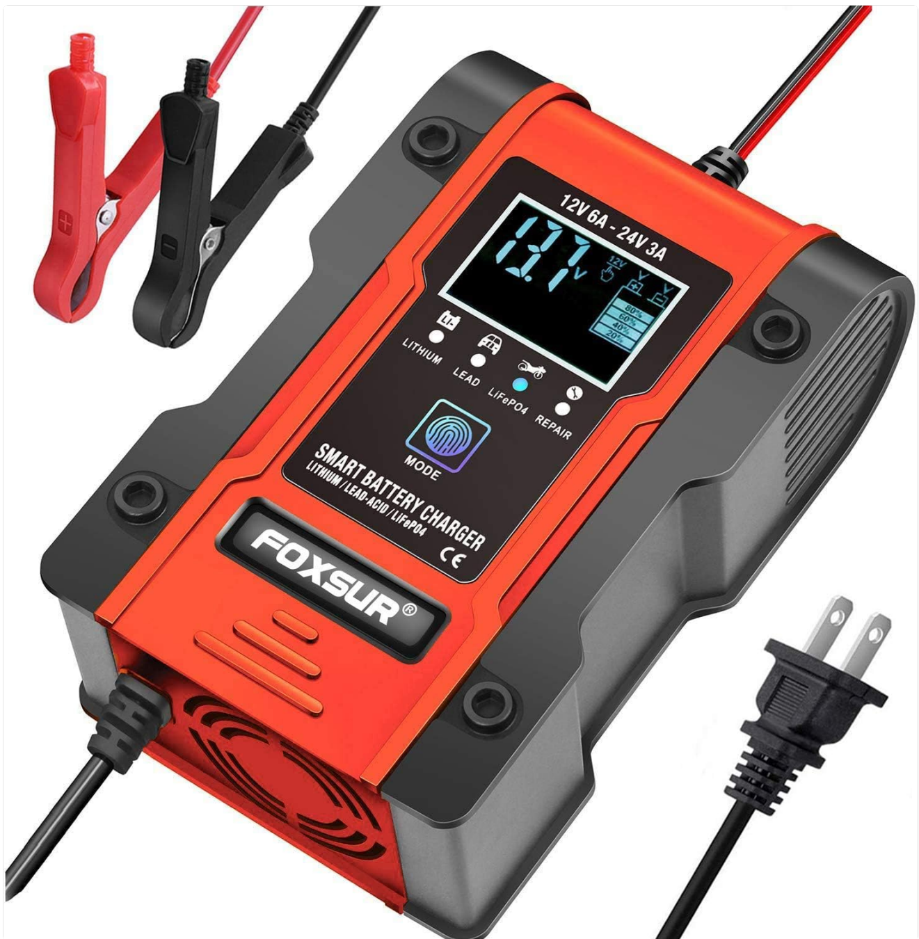
Image 1.1: The FOXSUR 12V/24V 6Amp Intelligent Car Battery Charger with its display and connection cables.