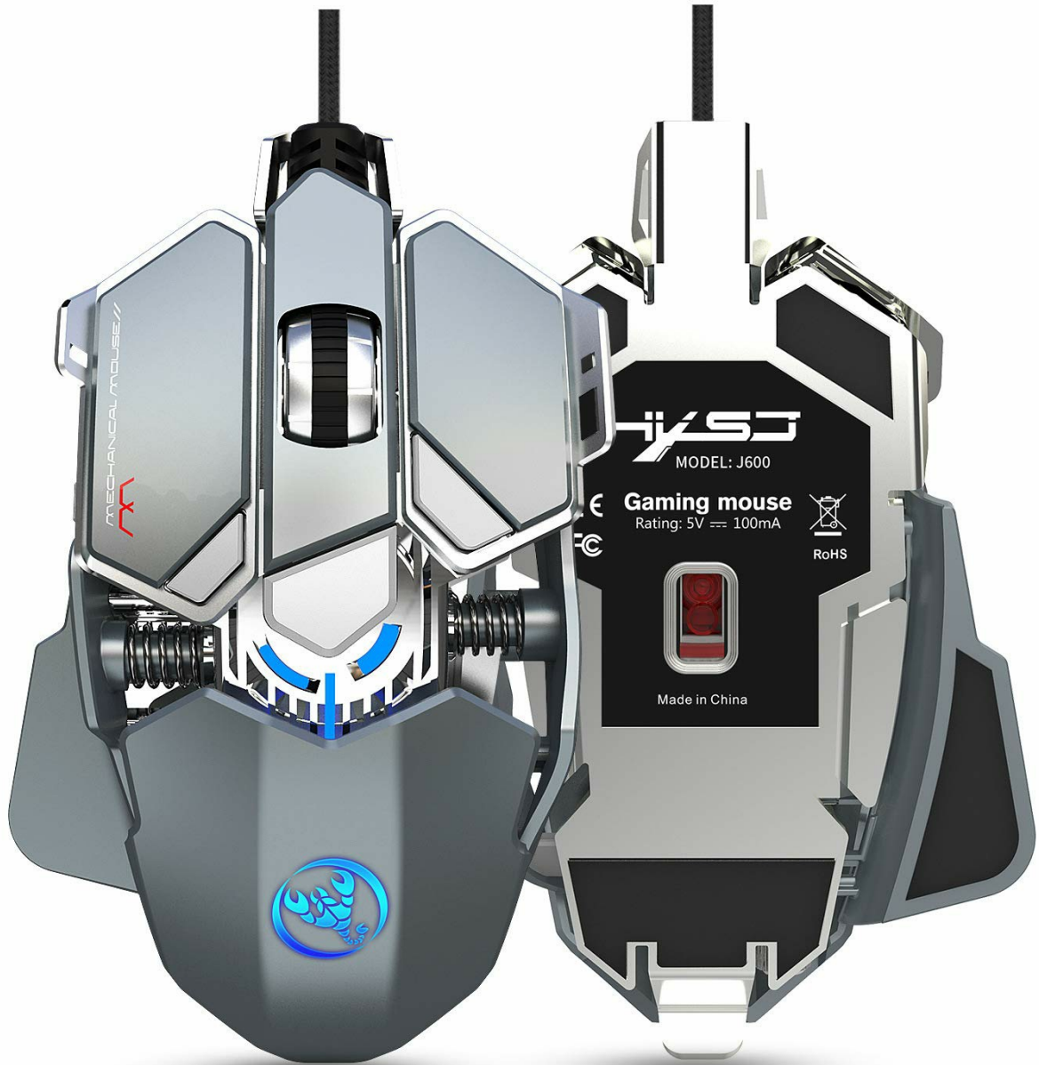
Figure 2.1: HXSJ J600 Mechanical Gaming Mouse. This image shows the overall design of the mouse, highlighting its mechanical aesthetic and wired connection.