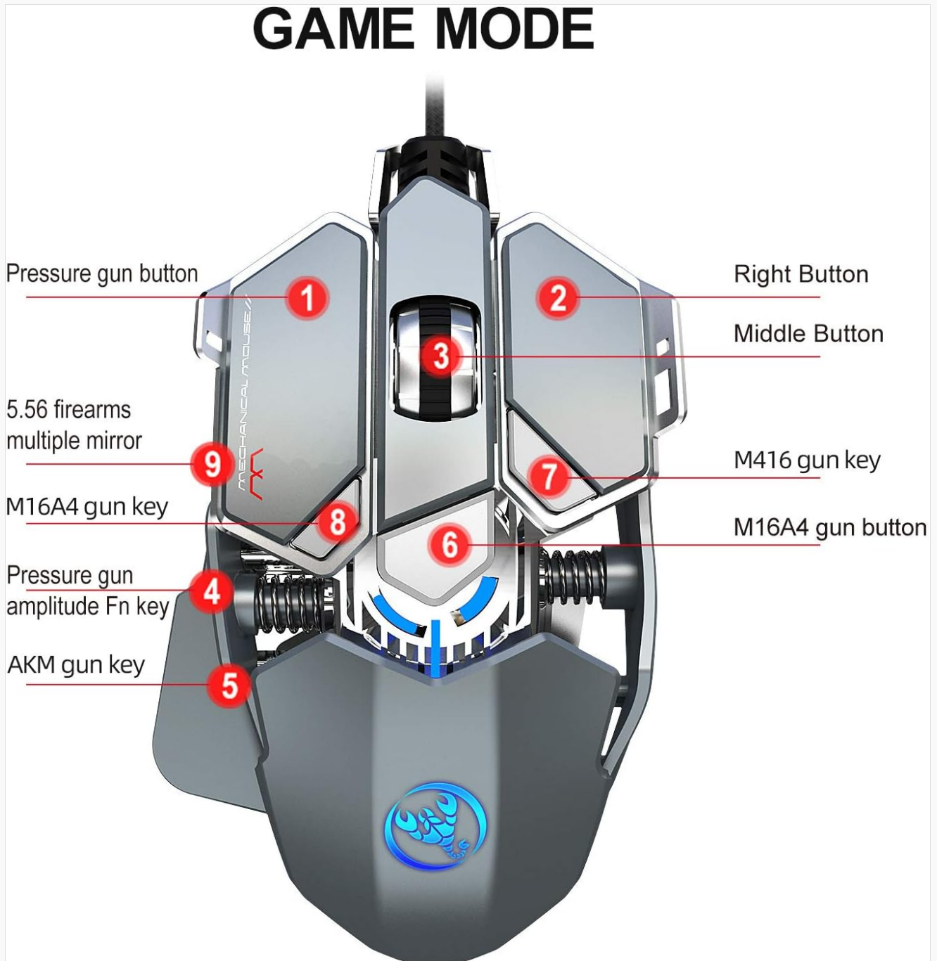
Figure 4.1: Button Layout. This diagram illustrates the numbered programmable buttons on the HXSJ J600 mouse, including the left, right, middle, and various side buttons.

The mouse features 9 programmable buttons. These buttons can be customized using the macro programming software to perform specific actions or complex sequences (macros) in games or applications.