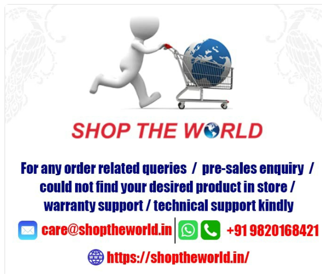
Image: Contact details for Shop The World, the packer/importer for tecmac products. It displays an email address (care@shoptheworld.in), WhatsApp number (+91 9820168421), and website (https://shoptheworld.in/).

For any technical assistance, pre-sales inquiries, order-related queries, or warranty support, please contact the manufacturer or authorized distributor using the details below: