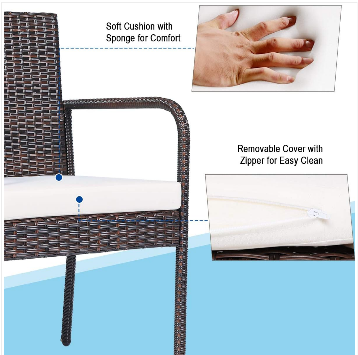
Figure 4: Cushion with removable cover for easy cleaning.