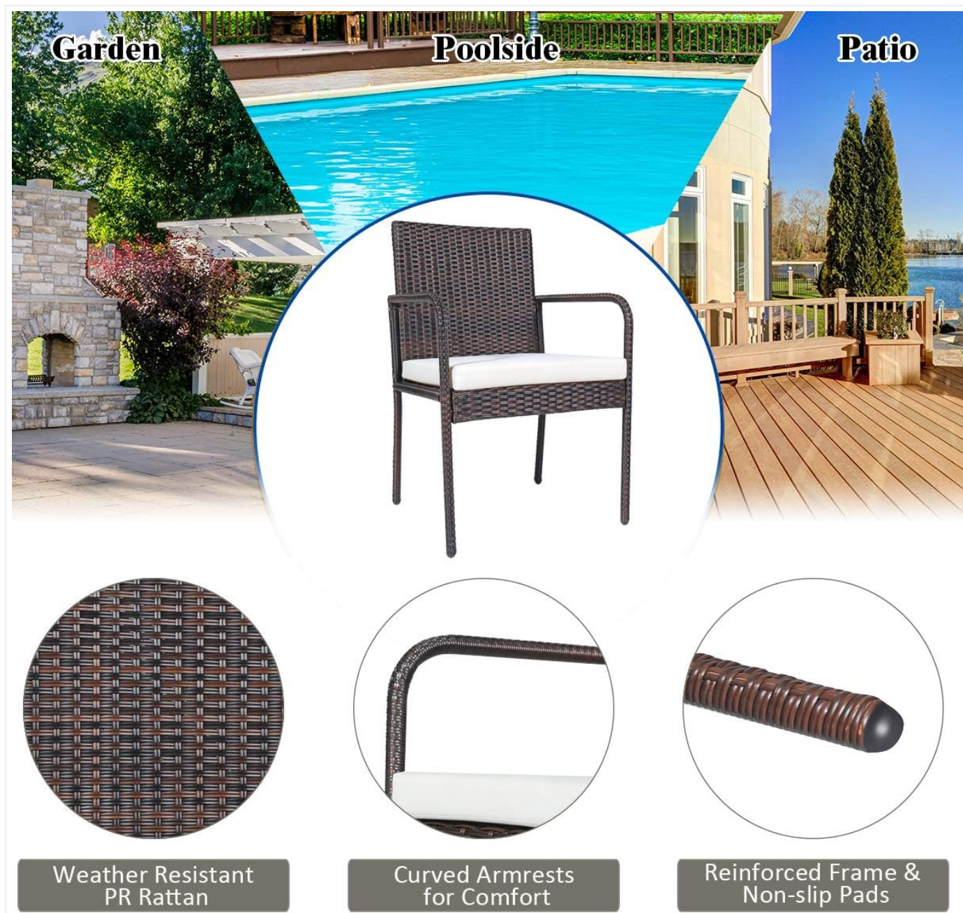
Figure 3: Versatile usage in various outdoor settings.