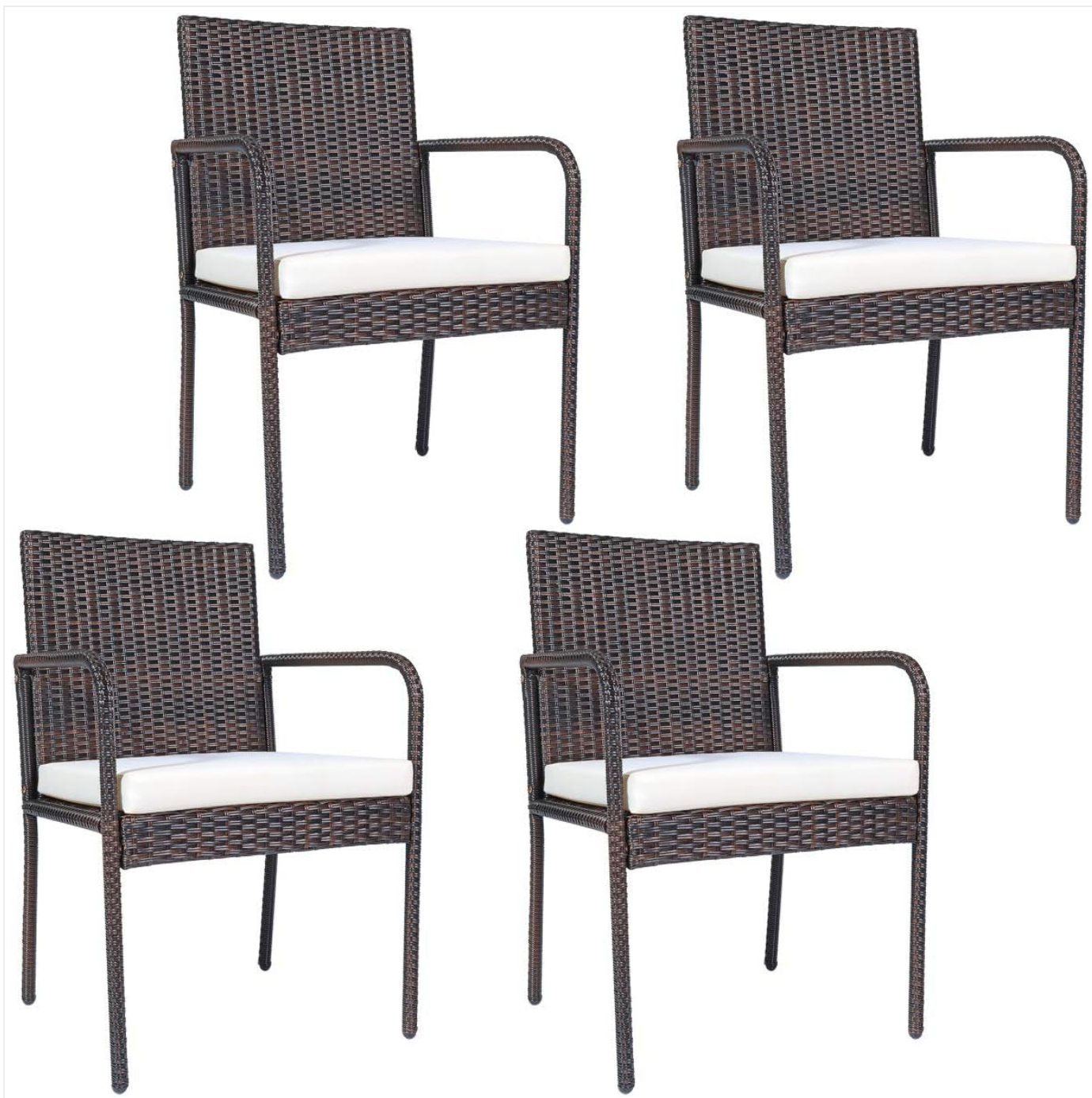
Figure 1: PATIOJOY Outdoor Patio Wicker Chairs Set of 4.