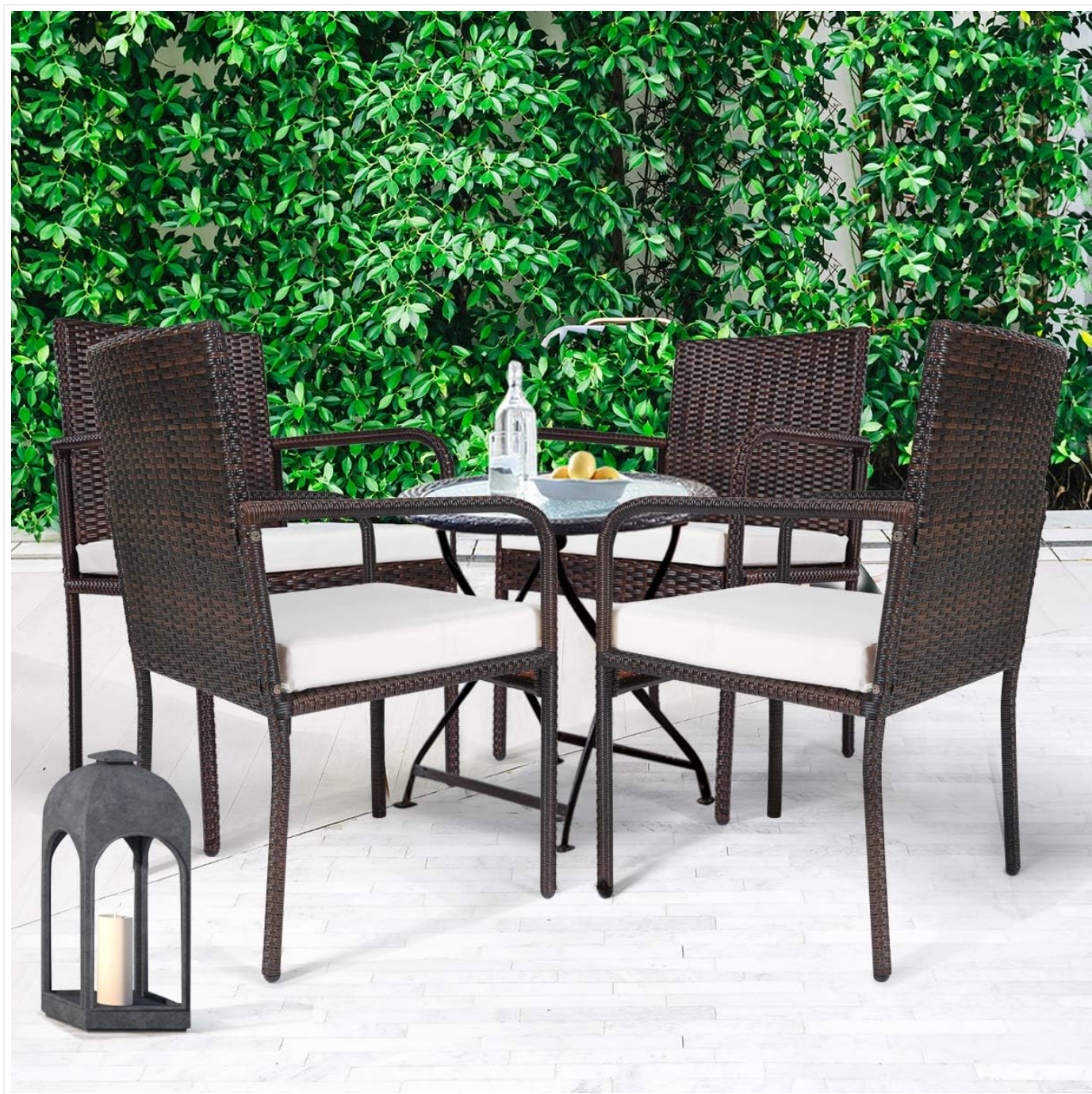
Figure 2: Assembled chairs in an outdoor setting.