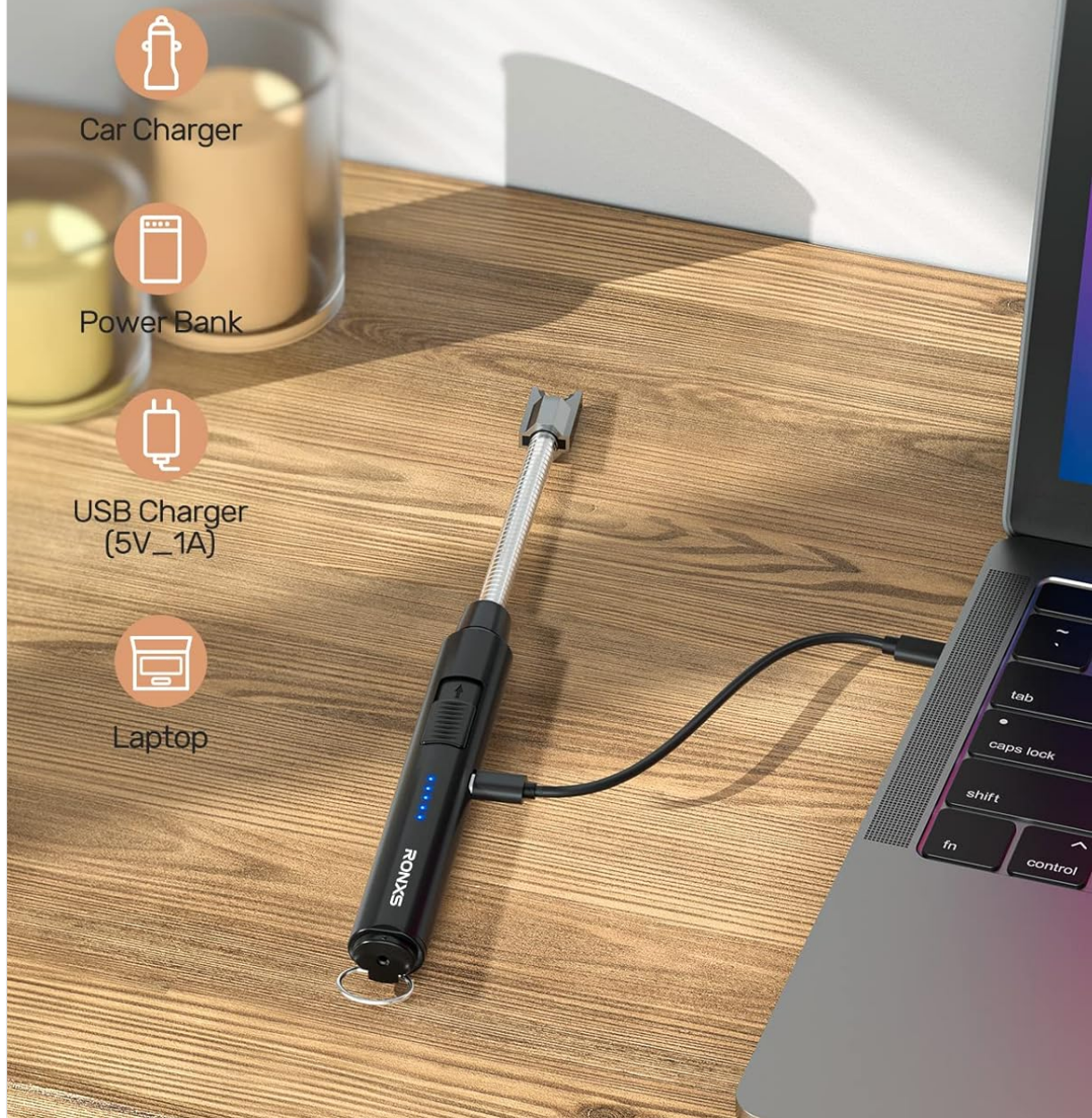
Image 4.1: The RONXS Electric Lighter being recharged via a USB connection, with LED lights indicating charge status.

5 LED lights to display the charge level