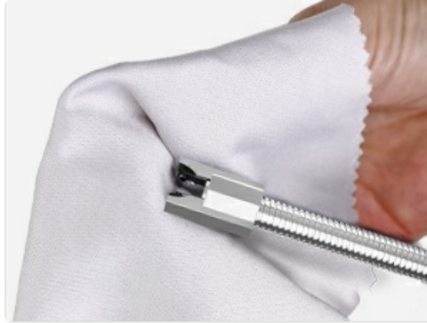
Image 6.1: Cleaning the arc tips of the lighter to ensure optimal performance.