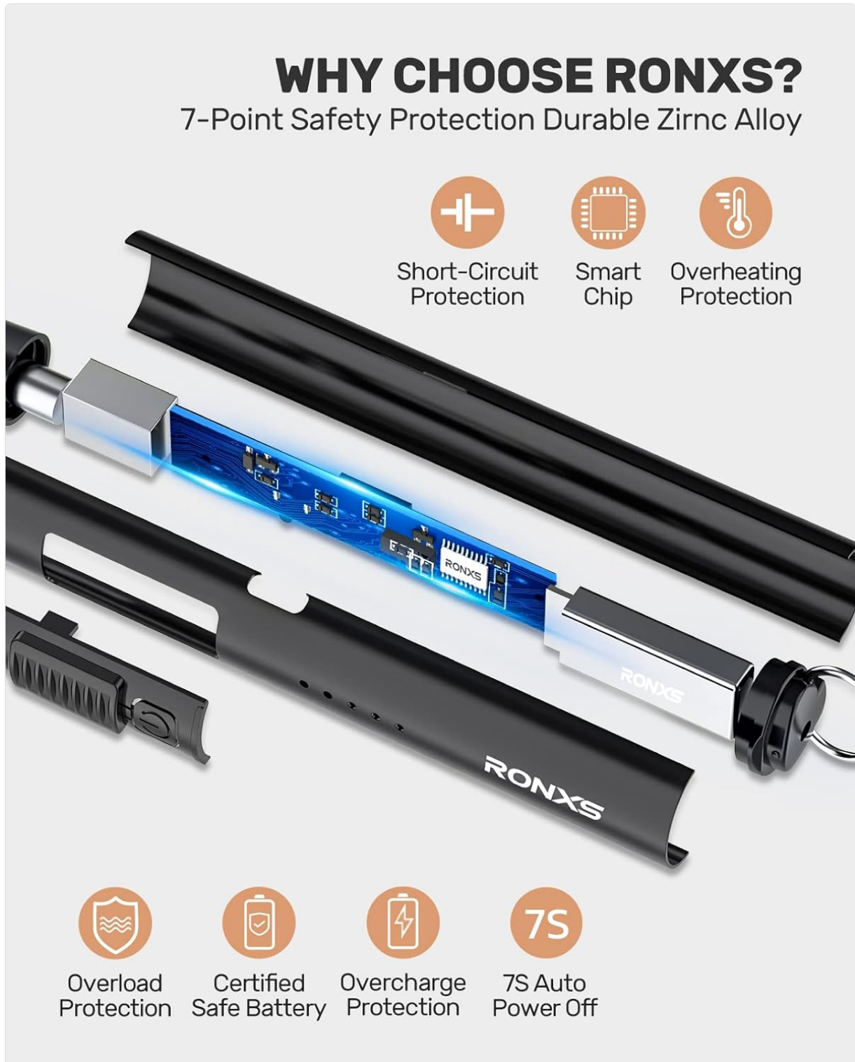
Image 2.1: Internal safety features of the RONXS Electric Lighter, including short-circuit, smart chip, and overheating protection.