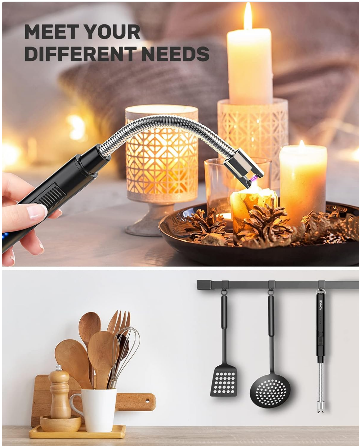
Image 5.1: The flexible neck of the RONXS Electric Lighter allows for easy access to various items, such as candles.

The flameless plasma technology makes the lighter wind and splash-proof, allowing for reliable ignition even in challenging weather conditions.