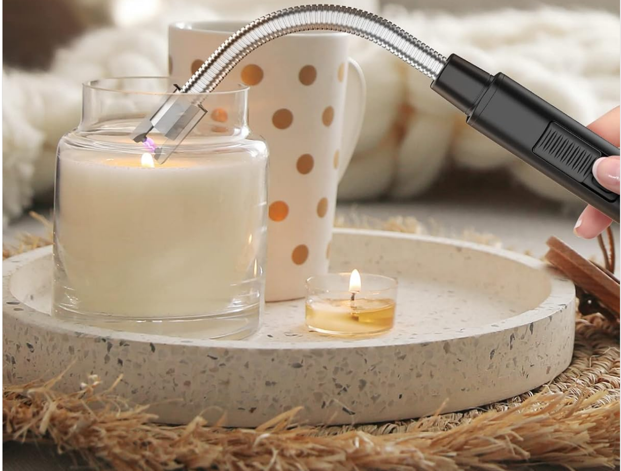
Image 1.1: The RONXS Electric Lighter in action, demonstrating its flexible neck and arc ignition for lighting a candle.