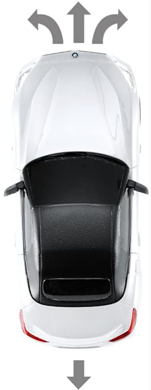
Diagram illustrating the car's functions (forward, reverse, stop, left, right), speed, remote range, and single-frequency operation, alongside a top-down view of the car and the remote.