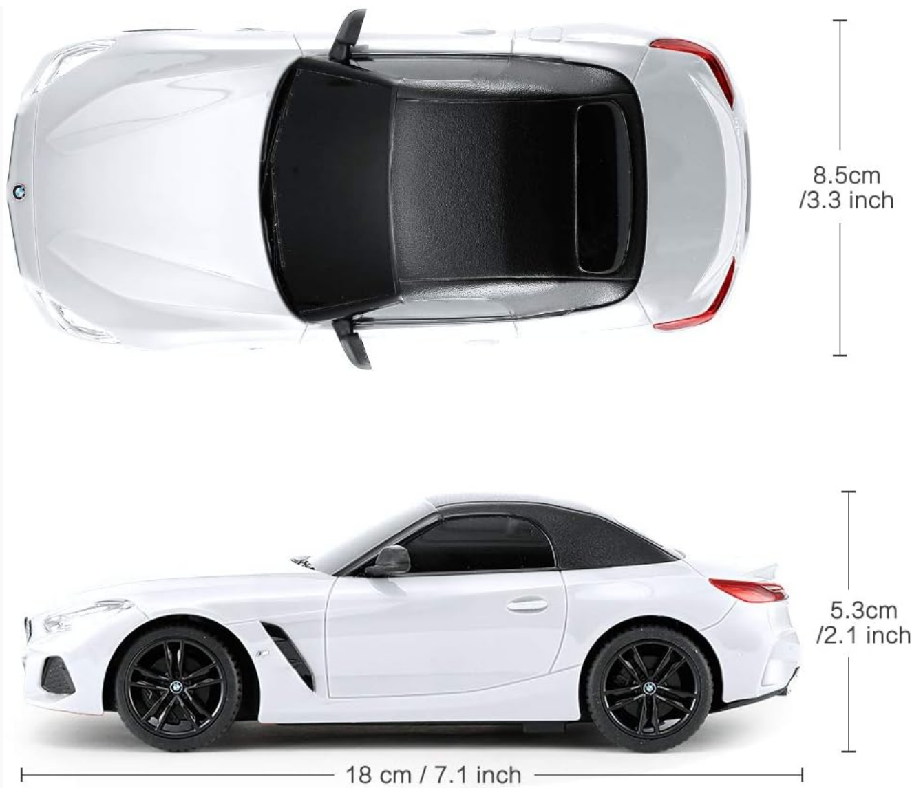
Side and top views of the RASTAR BMW Z4 Roadster RC car with key dimensions (length, width, height) indicated.