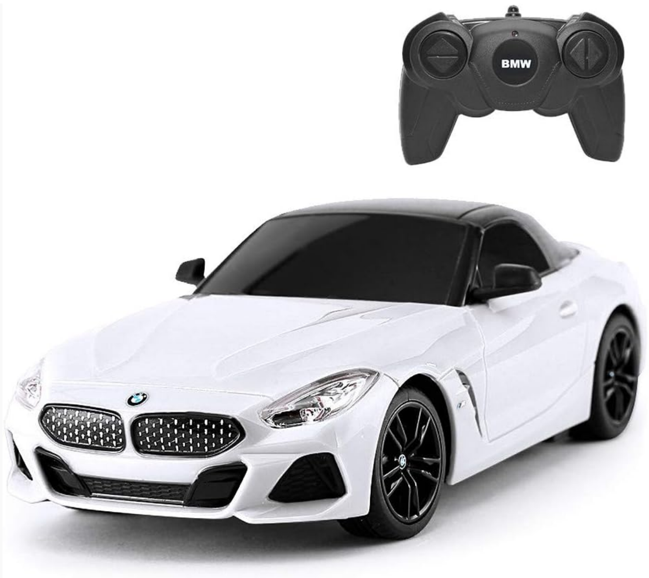
The RASTAR 1:24 BMW Z4 Roadster Remote Control Car shown with its accompanying remote controller.