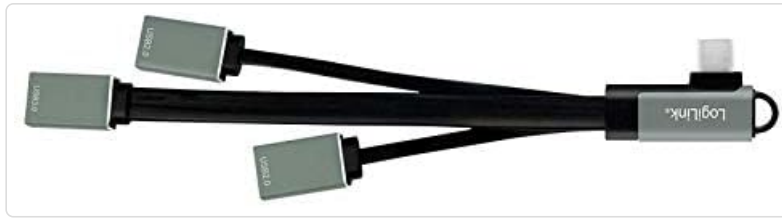
Image: Overview of the LogiLink UA0361 USB-C Hub, showcasing its compact design and multiple ports.