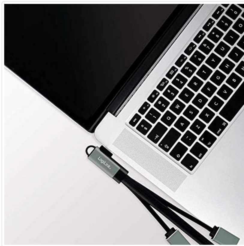
Image: The LogiLink UA0361 USB-C Hub connected to a laptop, demonstrating its compact and unobtrusive fit.