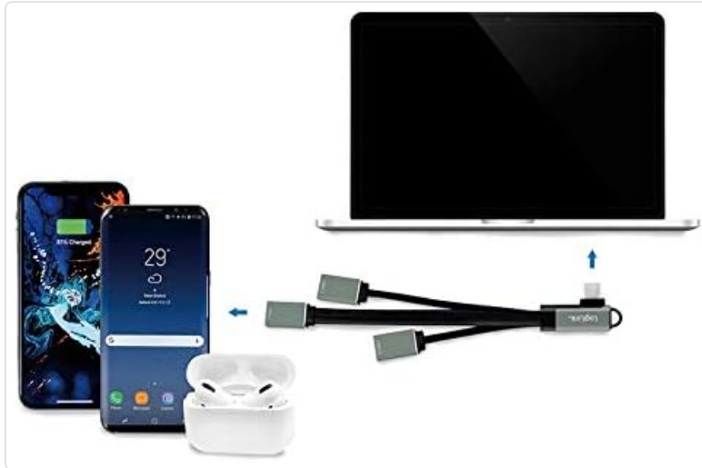
Image: The LogiLink UA0361 USB-C Hub facilitating connections for a smartphone, wireless earbuds, and another device to a laptop.