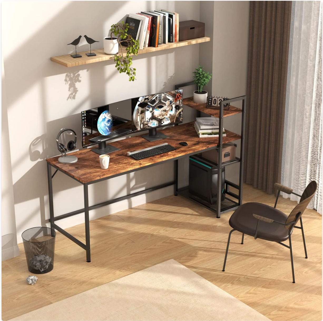
Image 1.2: An alternative view of the HOMIDEC Computer Desk, demonstrating its aesthetic integration into a modern living space.