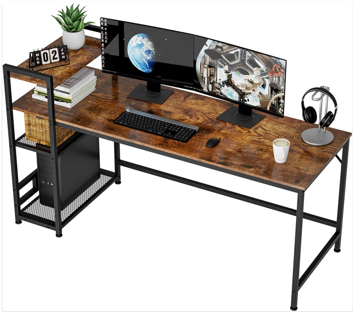
Image 1.1: The HOMIDEC Computer Desk with its integrated storage shelves, showcasing a typical setup with monitors and accessories.