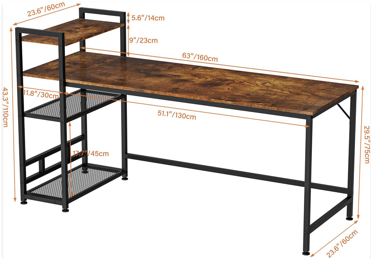
Image 8.1: Detailed dimensions of the HOMIDEC Computer Desk, including overall length, width, height, and shelf measurements.

Detailed specifications for the HOMIDEC Computer Desk, Model FY-SJDNZ160-FGS.