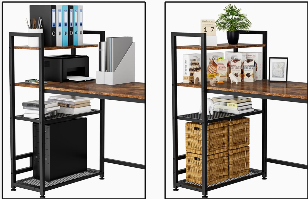
Image 5.1: Examples illustrating the practical use of the 4-tier storage shelves for various items such as a printer, books, and decorative elements.

Easily accommodate your laptop, pc, keyboard, desk accessories. books, potted plants, storage boxes, etc