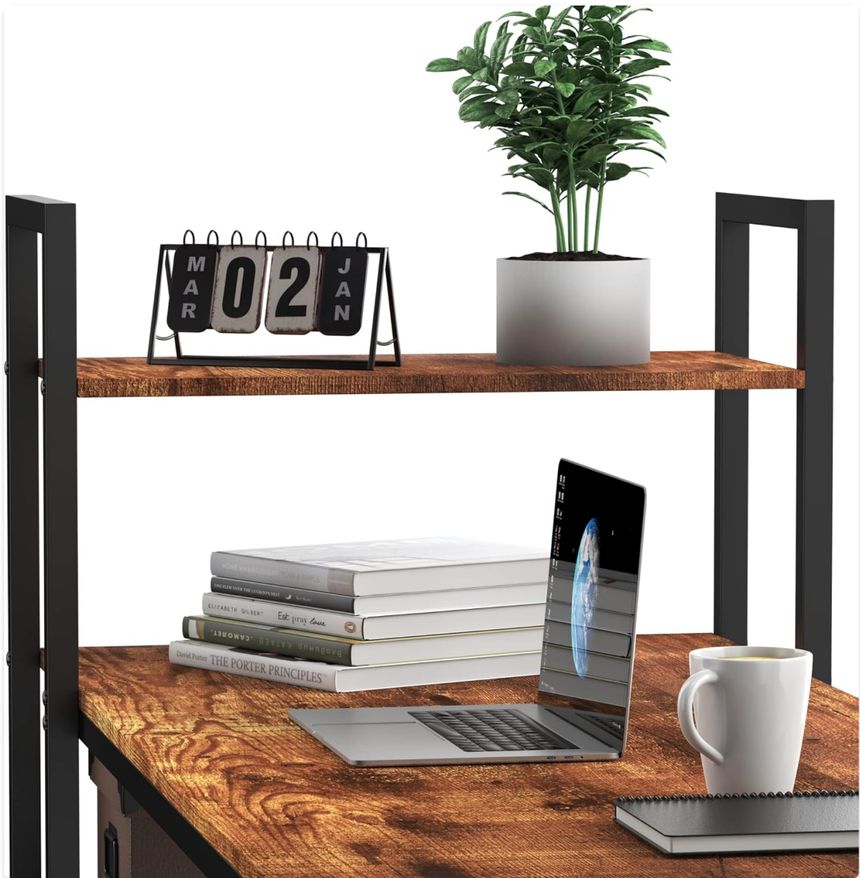
Image 5.2: A close-up view of the top shelf, demonstrating its capacity for small decorative items and a laptop.